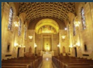
Chapel of Jesuit Novitiate of St. Isaac Jogues, Wernersville, PA

Source: Society of Jesus, Maryland Province