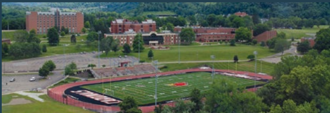
Campus of Wheeling Jesuit University