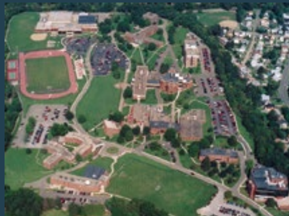
Aerial view of Wheeling Jesuit University