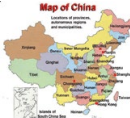
Map of China's Provinces