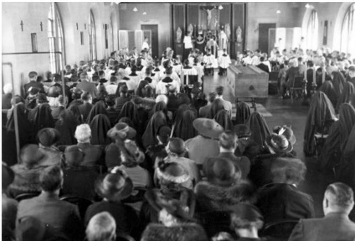
Funeral Mass in Maryknoll chapel – May 2, 1938