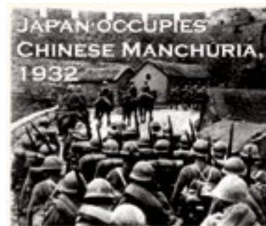
Japan occupies Chinese Manchuria 1932

The city of Fushun was located in the province of Liaoning – the southernmost part of Manchuria – with the Yellow Sea to the south, Korea to the southeast (separated by the Yalu River), and Inner Mongolia to the northwest. It was a prefectural level city. 22