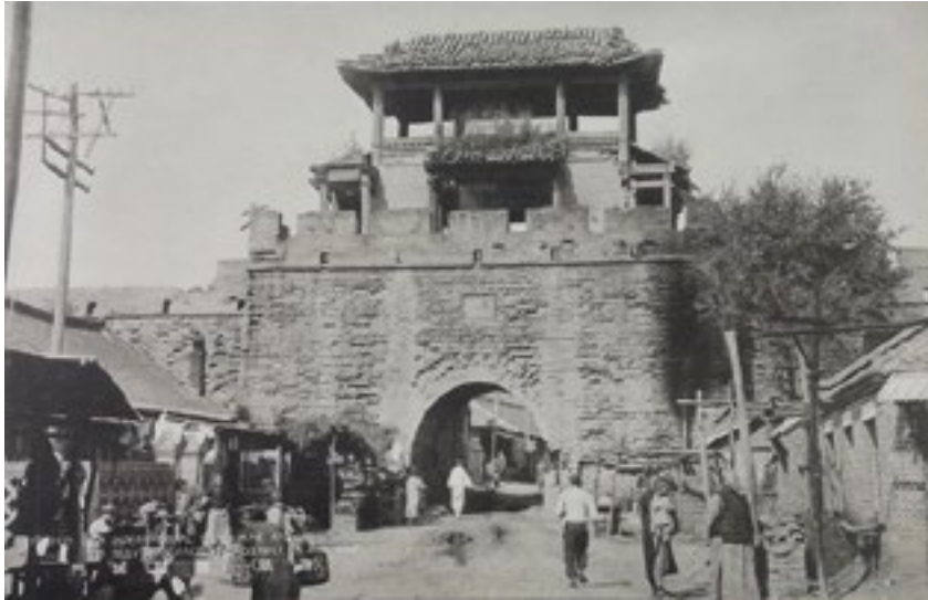
Fushun City Gate 1930s

Manchuria comprised northeastern China with its three provinces of Heilongjiang, Jilin, and Liaoning. It bordered Mongolia on the west, Russia on the north, and Korea on the south. Its territory was greater than all the Atlantic states as far as Florida, combined.