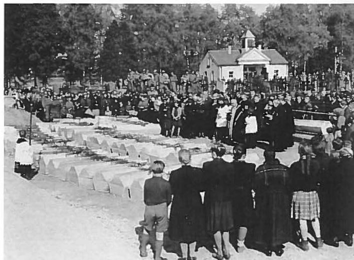
Approximately 500 Schwarzenfeld townspeople attend the April 25, 1945 funeral for 140 Death March victims.

As witnesses to this protest, the Schwarzenfelders were learning a valuable lesson. They were products of a culture that accepted subservience to authority as a way of life. Fr. Viktor, on the other