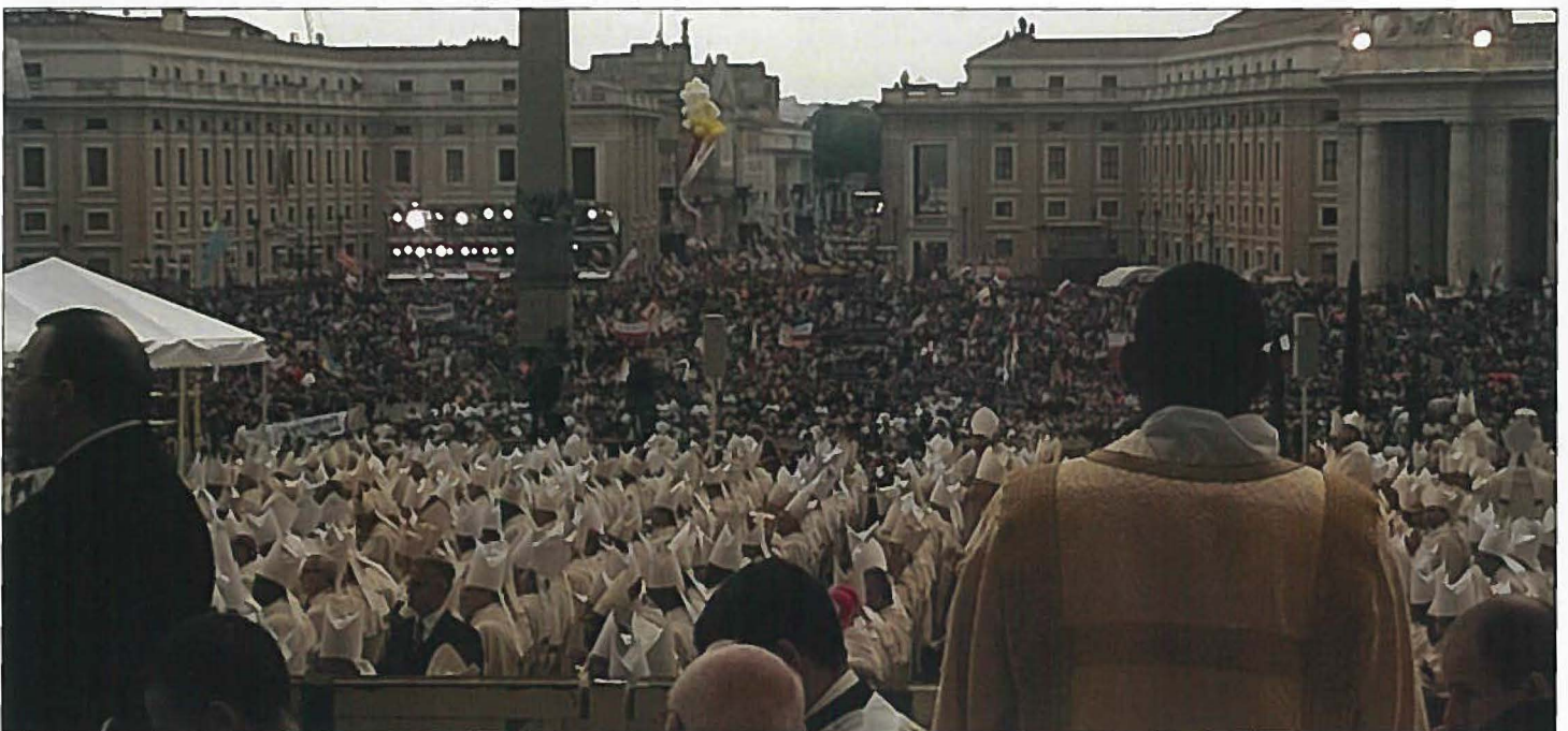
Panoramic view of St. Peter's Square from the front of St. Peter's Basilica during the dual papal canonization ceremony, Rome.

Back to our saints, though – how did we get here? John Paul II's story might be a little more well-known. Typically, there's a five year waiting period after someone dies before they can be considered for sainthood. That was waived about a month after his death. On December 19, 2009, Pope Benedict XVI declared him "Venerable",