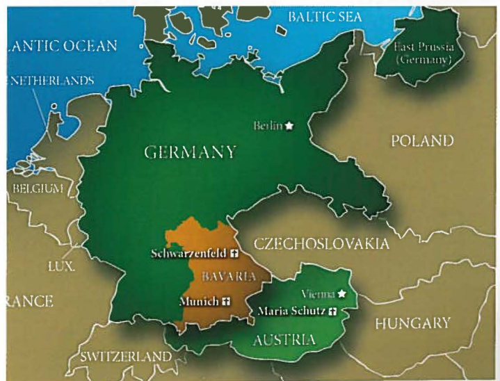
Map of pre-World War II Passionist foundations in Germany and Austria.