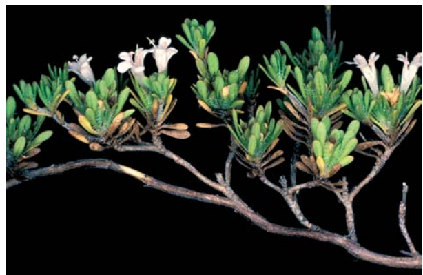
Fig. 3. Photograph of a brachlet with the leaves and flowers (Alcalá de los Gazules, Cádiz).