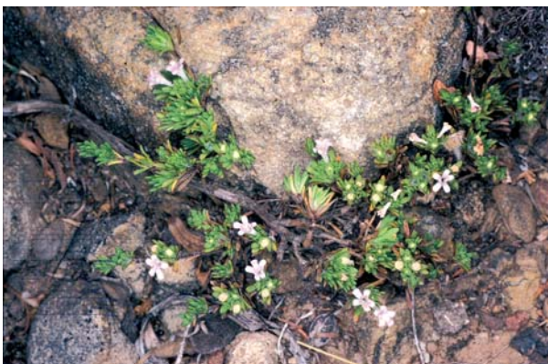
Fig. 2. Photograph of the whole plant (Alcalá de los Gazules, Cádiz).