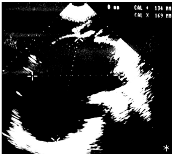
Figure 1. Transthoracic echocardiography at the time of mitral valve replacement

Chest X-ray shows a markedly enlarged cardiac silhouette. A transthoracic ECHO demonstrated a severely enlarged left atrium without any thrombus. Computed axial tomography revealed a left atrium measuring 20 \times 15 cm (Figure 2) in maximum diameters. Transesophageal ECHO showed the severely enlarged left atrium and a normal functioning valve with no stenosis or regurgitation. This patient now is under follow-up without any disability.