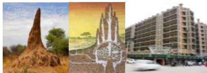
Figure 4. Zimbabwean Termite Nest and The Eastgate Centre (Chairiyah, R. 2018)

(S3) "Resembling the termite mound, the ceiling in the atrium in the second Municipal Office Building in Melbourne is made of rough precast sandblasted corrugated concrete, and the ceiling is 180 mm thick, 8 m long, and 21 m wide. The undulating space (ruang bergelombang) can absorb the heat produced by users to an optimal extent, promoting cross ventilation and increasing the natural light received by the space near the wall" (Yanping Yuan, etc., 2017).