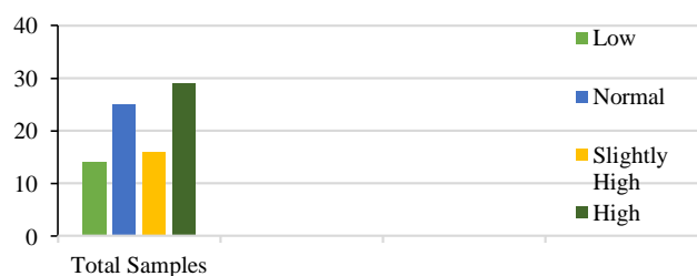
Figure 3. Characteristics of Samples According to Body Fat Percentage

Figure 3 shows the characteristics of samples according to the percentage of body fat. It can be seen that 14 people (16.7%) had low body fat percentage, 25 people (29.8%) had normal body fat percentage, 16 people (19%) had slightly high body fat percentage, and 29 (34.5%) people had high body fat percentage.