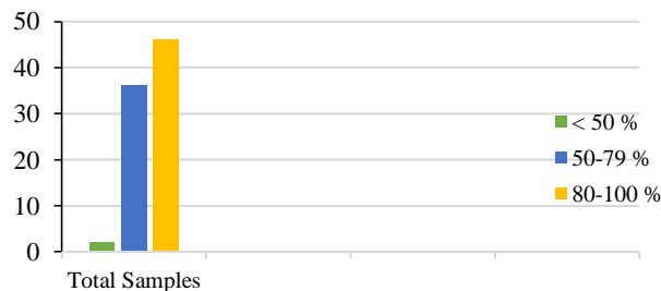
Figure 4. Sample Characteristics According to Percentage of Peak Expiratory Flow

As depicted in Figure 4, there were only two people (2.4%) with a percentage of peak expiratory flow of less than 50%. Thirty-six people (42.9%) had a percentage of peak expiratory flow of 50-79%, and as many as 46 people (54.8%) had a percentage of peak expiratory flow of 80-100%.