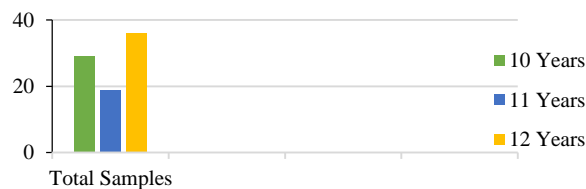
Figure 2. Characteristics of Samples According to Age

From Figure 2, it can be seen that the majority of samples in this study were 12-year-old students, with a total of 36 people (42.9%).