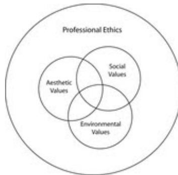
Figure 2. Professional Ethics in Landscape Architecture , (adopted from Thompson (2000a))

In reviewing the LA practitioners roles and capacities based on the IFLA's principles, this study adopts the trivalent value systems of LA practice to accomplish their projects. Among the ethics elements suggested by Thompson (2002) this paper will focus on the Ecological Values, whereas the other systems are also incorporated in order to pursue the study on climate change adaptation and mitigation. See the Figure2. Professional Ethics of Landscape Architecture .