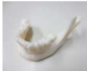
Figure 5. Reconstruction of the mandible cross section by 3-D printing use material Acrylonitrile Butadyene Styrene (ABS) a type of plastic polymer.