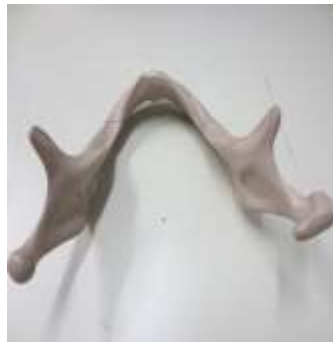
Figure. 7. Reconstruction of PEEK mandibular cross section can be used as implants to replace parts damaged by the tumor.