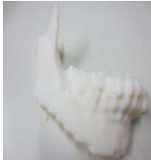
Figure 6. Mandibular model with 3-D printer are made of ABS.