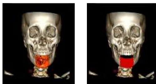
Figure. 3. Reconstruction of the model with positions in damage of the front teeth.

The layout of the damaged section on the lower jaw can be different as shown in Figures 2 and 3. For the reconstruction of the 3D printer uses material Acrylonitrile Butadiene Styrene (ABS), a polymer material with a melting point (melting point) of about 200oC. This material is not biocompatible and therefore can not use for implant material.