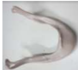
Figure 4. Reconstruction of the mandibular model of PEEK material using a machine Computer Numerical Control (CNC).

printers and CNC machines. PEEK a solid material so loud that need a CNC machine to print them. For use as an implant should match the shape and size are very accurate and precise as it has been patterned based on the damage suffered by the patient. To embed techniques as implant material requires a different technique that remains to be studied. .One Models reconstructed using CNC machines can be seen in figure 4.