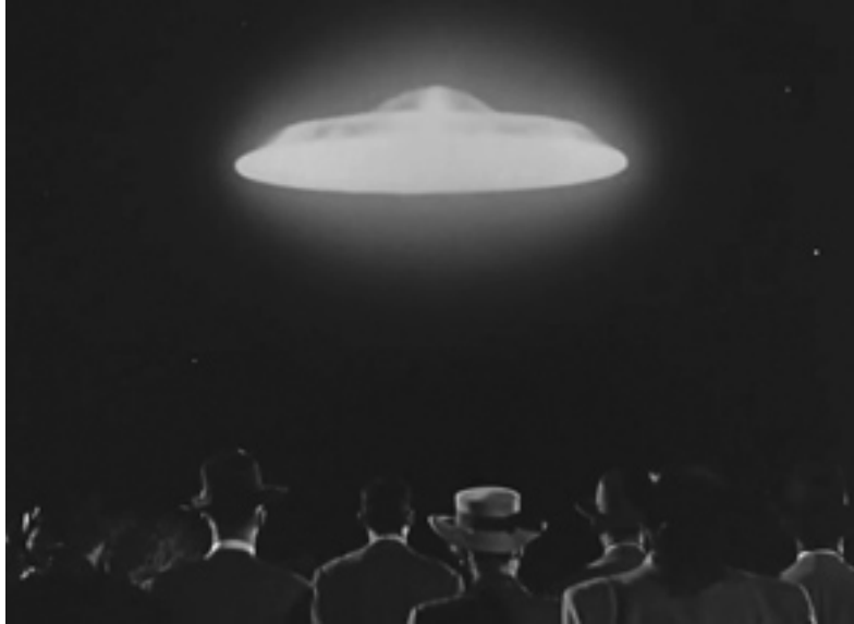
Figure 13: Figure 13: Klaatu's Hi-Tech Ascension

while Phillip L. Gianos called it "an extraordinary mix of science fiction, religion, and political philosophy" (137). One can only agree with them wholeheartedly. Indeed, not only was Klaatu a Christ-figure, but this holy construction was firmly buttressed by interlocking subtextual support characters, including disciples and a betrayer, which will be explicated in the final instalment of this analytical triptych.