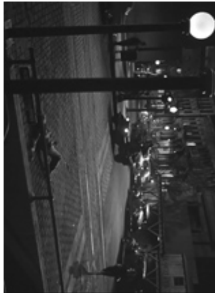
Figure 10: Figure 10: Klaatu's Crucifixion on a Crossbeam

This corona-like energy discharge-cum-hi-tech halo is subtextually analogous to the Gloriele of Christ, that halo/nimbus that adorns the head of the divine, and which is visually depicted in numerous Christ portraits throughout history. This religious interpretation is more easily appreciated when the film's resuscitation bed scene is rotated ninety degrees (see Figure 11). A short time later, accompanied by electronic humming and then urgent beeping sounds that reached a crescendo, the dead Klaatu is "miraculously resurrected" (Shapiro 81) in "a science fiction version of the Ascension" (Saleh 41). Klaatu's alien resuscitation science is therefore directly analogous to the recorded biblical resurrection miracle.