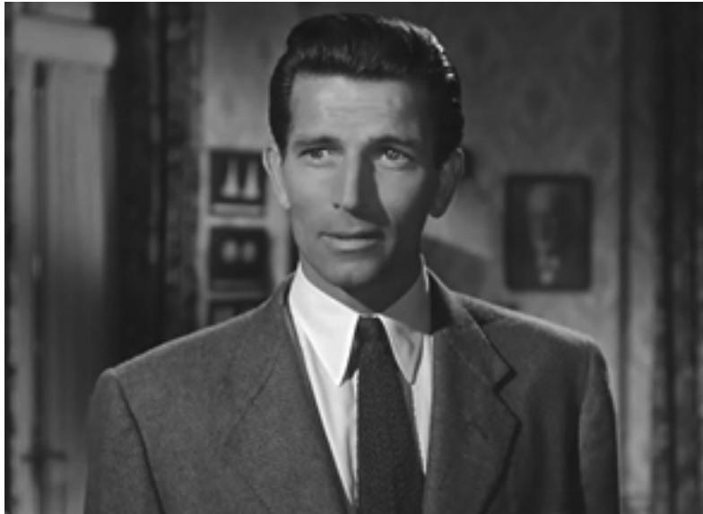
Figure 5: Figure 5: Klaatu as Mr. Carpenter

Not only was this SF film a cautionary political tale about human aggression that had subtextually constructed Klaatu as an alien messiah, but it was also a "modern retelling of the Christ story" (von Gunden and Stock 43) that turned The Day the Earth Stood Still into a subtextual SF Passion picture (i.e., the end time portion of a Christ cycle film). Like Jesus, Klaatu-as-alien-saviour came from the starry heavens, arrived triumphantly, bore wondrous gifts and offered humanity an unprecedented opportunity for galactic redemption. He was about to present an exotic token of friendship, namely a short, spike-pronged object, which some thought looked like a scroll containing a message (Craft 217), when a frightened, trigger-happy soldier ensconced within the defensive military perimeter that encircled Klaatu and his saucer misconstrued Klaatu's peaceful, gift-giving intention and promptly shot him in the shoulder. In that violent xenophobic act, the soldier accidentally destroyed the alien gift being proffered (see Figure 6), and as the wounded Klaatu ruefully explained: "It was a gift for your President. With this he could have studied life on the other planets," but now its colossal powers is "something we have to take purely on faith" (King and Krzywinska 88).