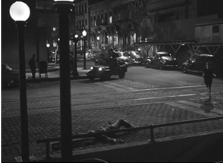
Figure 9: Figure 9: Klaatu's Crucifixion Pose

its "Platonic virtues of clarity, sanity, and reason" (Sobchack 76), a corona-like energy discharge began and "Klaatu's head glows in the rings of the resuscitation machine as though halos shine at his forehead" (Saleh 47).