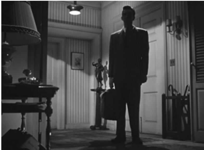
Figure 8: Figure 8: Mr. Carpenter in Shadow

Despite Klaatu's cadre of earthly "disciples" and his (literal) universal message that counselled peace, he was denied, rejected, pursued, cornered and then killed by human ignorance and intolerance (paralleling Jesus's earthly experiences). Klaatu's Christ-figure status was visually confirmed when the military went on their own version of a holy crusade and shot him for being a dangerous prophet-at-large (analogous to the Roman soldiers' pursuit, capture, piercing and crucifixion of Jesus to preserve the military, political and religious status quo of their ancient day). Furthermore, when Klaatu fled the pursuing military during the night and was shot once in the back, he twisted around, grabbed his side, indicating the wound site (akin to Jesus's pierced side - John 19:34), crashed onto the ground, and landed in a classic cruciform pose, complete with splayed arms and appropriately bent knee (see Figure 9).