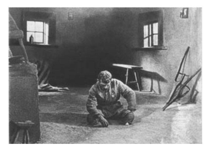
Figure 1: One of the opening scenes in Arsenal

resources from parents. Depending on differences in birth order, gender, physical traits, and aspects of temperament, siblings create differing roles for themselves within the family system. These differing roles in turn lead to disparate ways of currying parental favour. Eldest children, for example, are likely to seek parental favour by acting as surrogate parents toward their younger siblings. Younger siblings are not in a position to ingratiate themselves with parents in the same manner. Their niche is typically less parent identified, less driven by conscientious behavior, and more inclined toward sociability. As children become older and their unique interests and talents begin to emerge, siblings become increasingly diversified in their niches.<sup>(19)</sup>