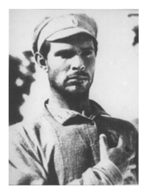
Figure 3: Tymish (Semen Svashchenko) in Arsenal

He possessed an artistic temperament; he was restless. He wanted to create as many excellent films as he could. Having become a filmmaker late in life, he must have felt that time was not on his side.