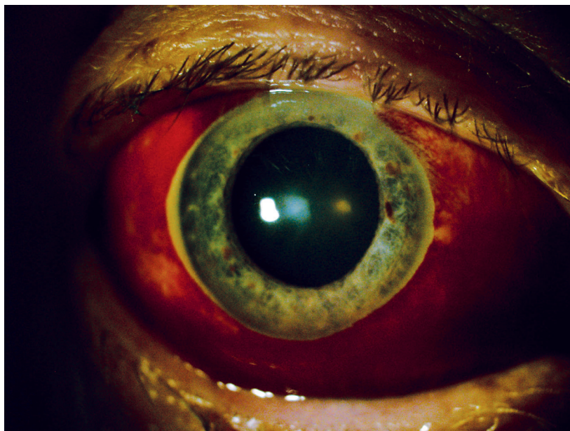
Figure 1: Subconjunctival hemorrhage OD

His habitual visual acuity was 20/25+ OD and 20/20- OS with refractive errors of -0.75-1.00x085 OD and -1.25-1.25x080 OS. His pupils were equal and reactive to light, without afferent pupillary defect; extraocular movement was full without restriction; confrontation field was full to finger-counting. Cover test was orthophoric. Goldmann applanation tonometry was 18 mmHg OD, 17 mmHg OS @ 1328. Slit lamp exam revealed grade 1+ nuclear sclerotic cataract OU and subconjunctival hemorrhage OD (Figure 1). Dilated fundus exam was unremarkable with C/D ratios of 0.30 round OU.