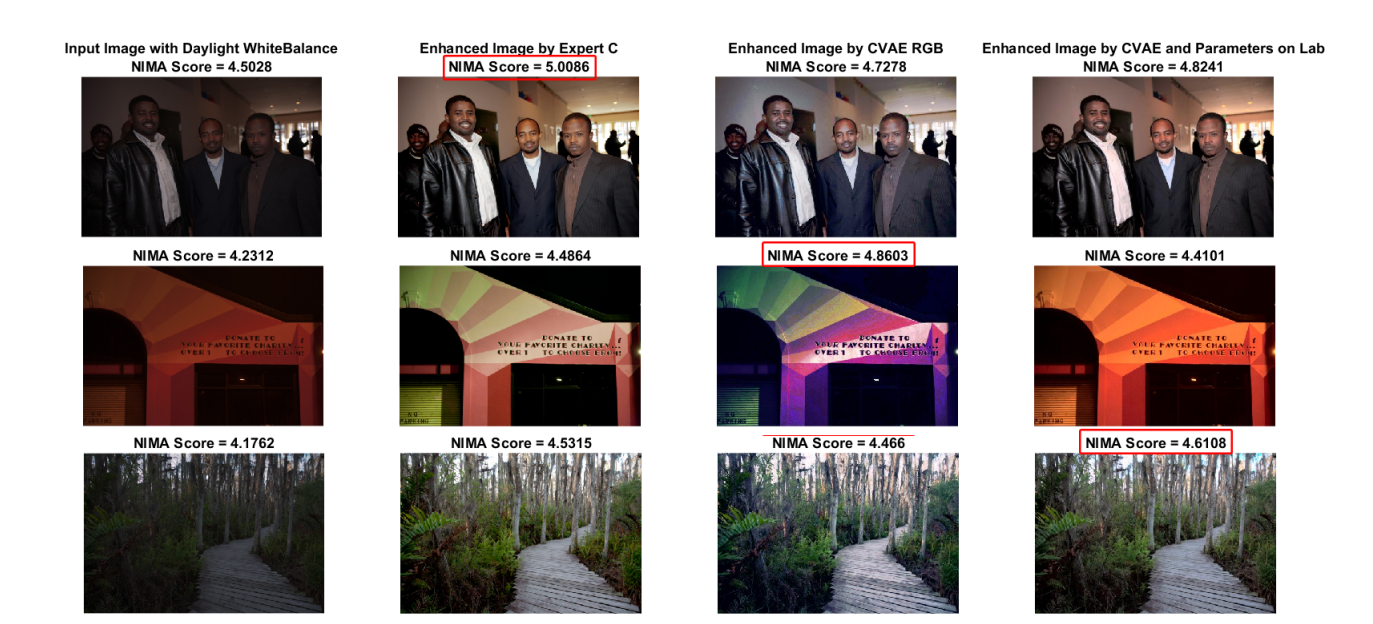
Fig. 2: Quantitative and qualitative illustration of the input and output test images of the MIT-Adobe FiveK dataset [1]. The NIMA score appears on top of each image. The best score of each data is emphasized by a red box.

the Figure 3, selecting the output with maximum NIMA score outperforms the expert's performance on the test data. In addition to quantitative comparison, we also provide the output of our models for different input images and visually compare the result with the input and expert's output.