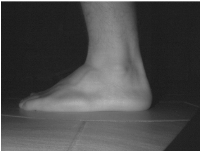
Fig. 2: The IR image used to enhance the depth map of an RGBD camera using the RGBD-Fusion algorithm [9].

F200's IR camera, in the presence of the IR projector's pattern is shown in Figure 2.