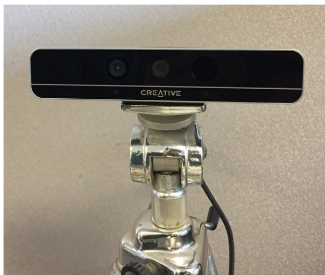
Fig. 1: An Intel Realsense F200 RGBD Camera.

RGBD cameras have become very affordable and accessible, with a number of models available on the market today. One of the most notable RGBD camera models is the Kinect, which has sold millions world wide. The Kinect uses a Structured Light system with an Infrared (IR) camera and projector pair for depth measurement, along with an RGB camera [1]. More recently, Intel has released a line of RGBD cameras including the Intel Realsense F200, R200 and SR300. The F200 and SR300 cameras work similar to the Kinect system, utilizing Structured Light, with an IR camera and projector. The R200 camera utilizes stereo IR cameras to measure scene depth, with an IR projector used to provide additional texture to the scene. All of the Intel Realsense cameras also have an RGB camera similar to the Kinect, for the capture of color information.