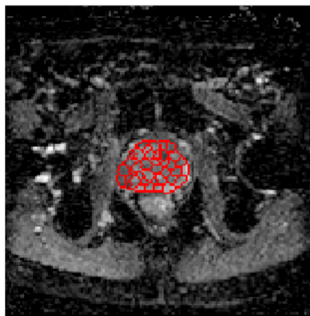
Fig. 1: Superpixel segmentation of prostate gland

Fig. 1 illustrates the superpixel segmentation of a prostate gland in ADC.