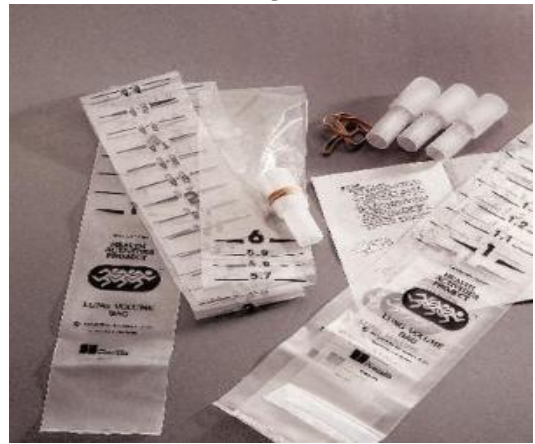
Figure 1: Lung Volume Bag set to measure lung capacity (Ward's Science 145051, 145068, https://www.wardsci.com/store/catalog/product.jsp?catalog_number=145051&sk=1