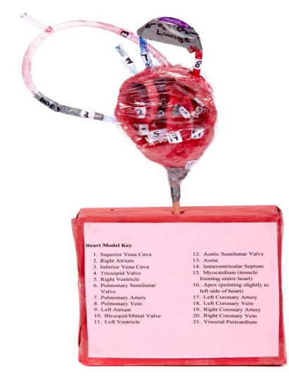
Figure 2: Some examples of heart models constructed by students as part of the heart unit. Students were given 4 weeks and had to get their project design approved before construction. All models were life sized.