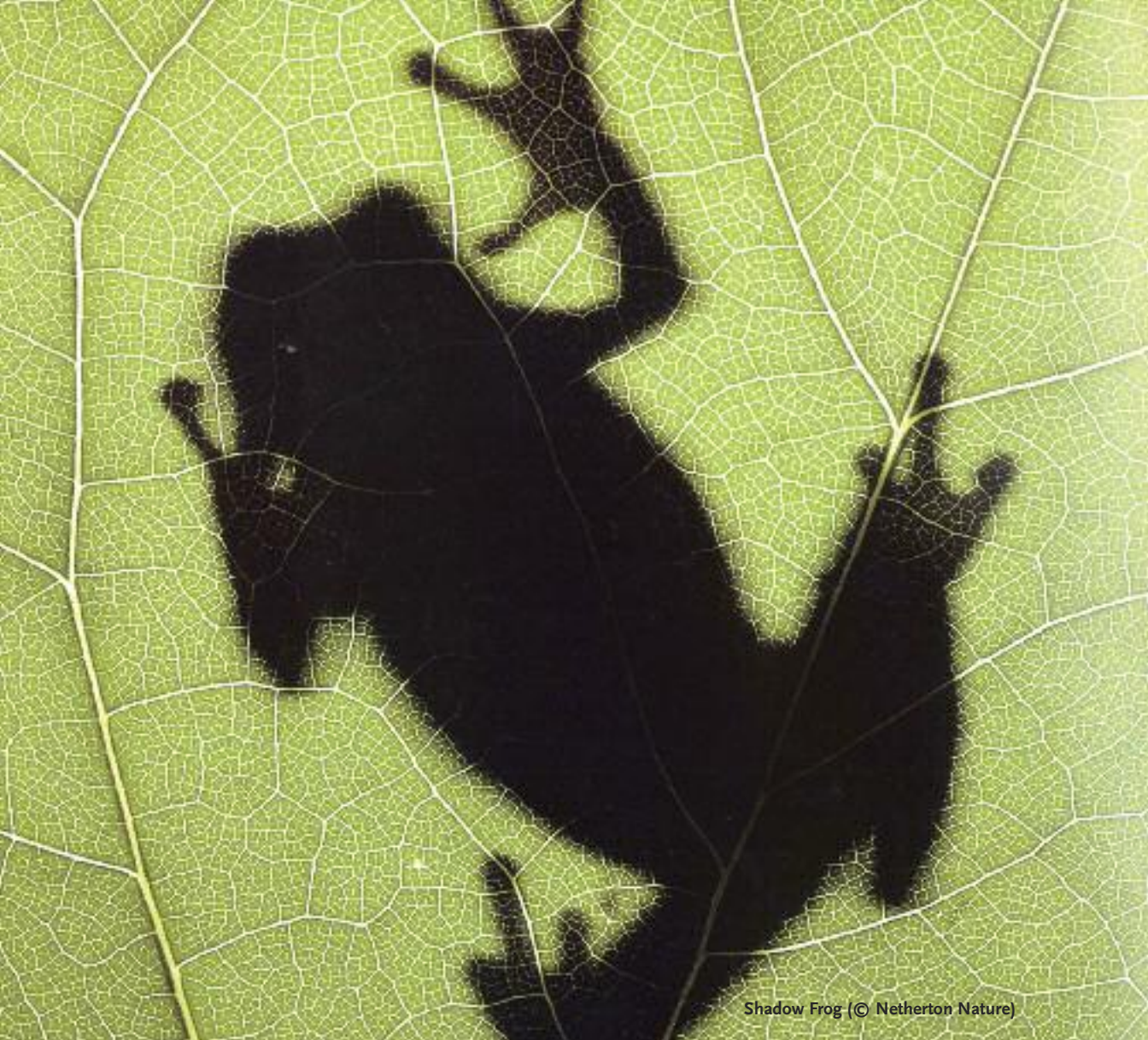
Shadow Frog