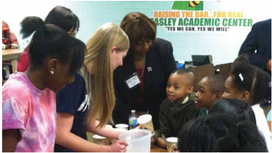
Illinois State Sen. Mattie Hunter watches Beasley Academic Center students participate in a states of matter science demo during IMSA's Chicago Field Office opening.

Through its recently relocated Chicago Field Office, IMSA joins forces with Chicago Public Schools to deliver professional development in mathematics and science instruction that focuses on inquiry and discovery; provide after school, weekend and summer mathematics and science programs for students; and address local needs by building and sustaining relationships with the local Chicago community. 360