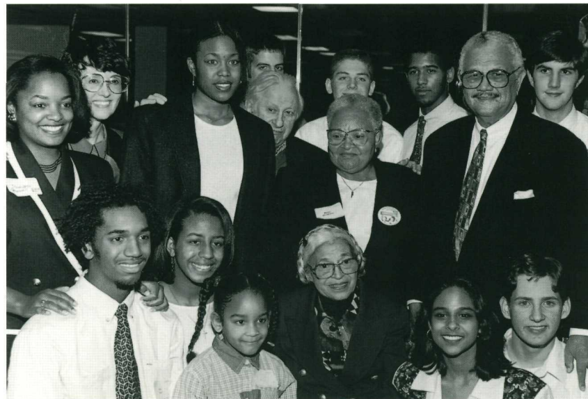
Rosa Parks Event – November 15th, 1995