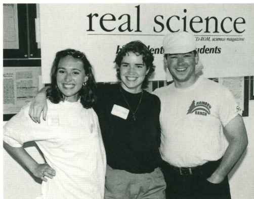
IMSA Alumni Open House – June 15th, 1996