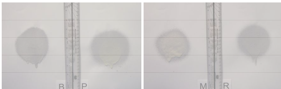
Fig 1. Spray pattern of Haruan spray that used (B) Butane, (P) Propane, (M) Butane-Propane mixture, (R) HFA 134a as propellants