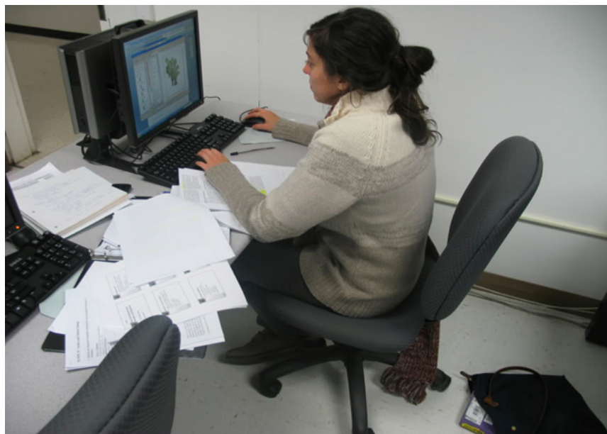
FIGURE 5 Freeze-frame photograph showing a master's student working in department computer lab

Across the study, graduate students consistently chose spaces and furniture that allowed them to spread out. Quite often, students work with multiple resources or documents at a time. This is especially true as students write or synthesize ideas, often using a laptop along with multiple online and print resources. Photo diary pictures show it is not uncommon for office desks at home to be used for storage instead of work as students opt for larger kitchen or coffee tables. Freeze frame images of students at work in campus computer labs show their papers and belongings spread across neighboring computer stations (see figure 5). Wherever students worked, there was a clear preference for laptops and large tables with many outlets available rather than rows of desktops in typical computer-lab fashion.