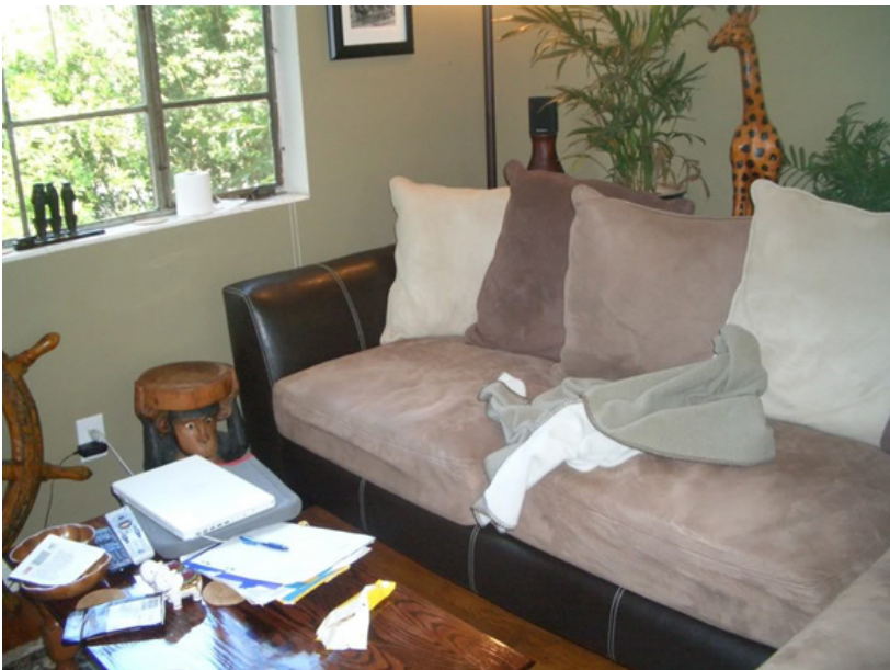
FIGURE 6 Photo diary photograph showing a laptop by a sofa as “favorite place to study and/or conduct research”

How and when a space is accessible was an important consideration for students when choosing a place to work. In regard to campus locations, students pointed to a host of barriers that affected the way they work. The data suggest that an important factor in a graduate student's life is time. Grad students must be flexible with their schedules, fitting in shorter bursts of study and research time around multiple commitments. Often longer periods for study are set aside either earlier in the morning or later in the evening and night. This means that graduate students find themselves working throughout the day and night and want spaces that are open as much as possible. FSU's main library is open 24/5, but several students complained about not being able to use the library during their prime work time because it closes at 6pm on Friday and Saturday and opens at noon on Sunday. For many students, Friday evening and Sunday morning are the least busy times of their week, when they can devote several hours to intensive research.