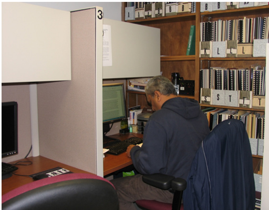
FIGURE 1 Freeze-frame photograph showing a PhD student working in a shared office space along the side of a hallway that houses departmental materials

Some graduate students referred to the library as a "second home" after their home department. 31 Even students who were happy with their department spaces reported coming to the library for a change of pace, to meet with a group, or to access materials. For those without a department office, library spaces played an even more central role. However, some students rarely visited the library in person and instead relied heavily on the library's website and online resources. This feedback raised questions concerning the adequacy of the library's virtual presence but was beyond the scope of this analysis.