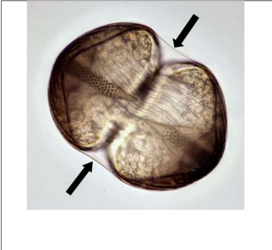
Figure 1. Ventral view of a glochidium of Arkansia wheeleri , showing the intact egg membrane (arrows). (C. Barnhart).