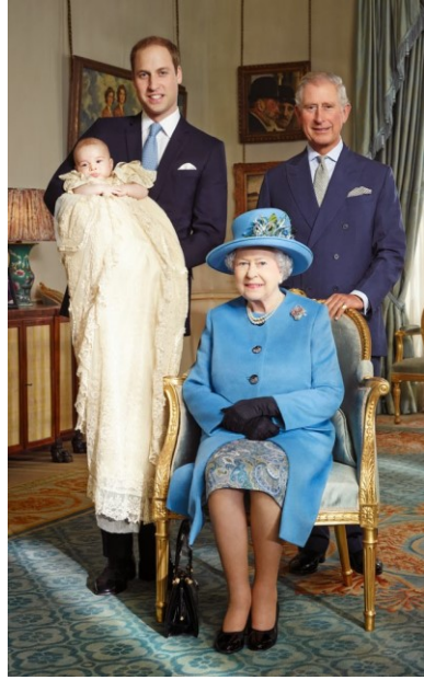
Figure 8: Queen Elizabeth, The Prince of Wales, The Duke of Cambridge, and Prince George 8

It is important that George's mother, Catherine, is not included in the photograph because she is not part of the succession. She is just seen as the mother of the future king and nothing more. The final significant thing about this photo is the fact that George is already being indoctrinated into the family tradition of introducing the young members into a life in front of the cameras. Will George be as confident as Elizabeth or as reticent as William? Only time will tell, but people are already speculating that he will be living in the massive shadow of his deceased grandmother, Diana.