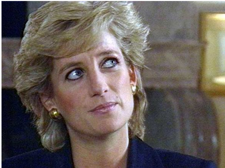
Figure 13. Diana during the Panorama interview, 1995 13

her rhetoric from just being someone who people aspire to be to being someone who represents who people are. Yes, she is still beautiful, but she could pass for being any regular working mom. She just happens to be one of the most famous women in the world. This style of rhetoric is also based purely on femininity rather than Elizabeth's rhetorical mixture of femininity and masculinity. She is allowing herself to look frail because she wants to deemphasize her authority and emphasize that she is no longer a royal.