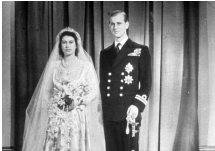
Figure 3. The Queen and The Duke of Edinburgh on their wedding day, 20 November 1947. 3

This photograph also shows “patriotism”. Not only is Elizabeth a war veteran, but Phillip was currently serving in the British Navy. The fact that both of them served during World War II heightens the connection that the public would have with them, because they actually did something to stop the war.