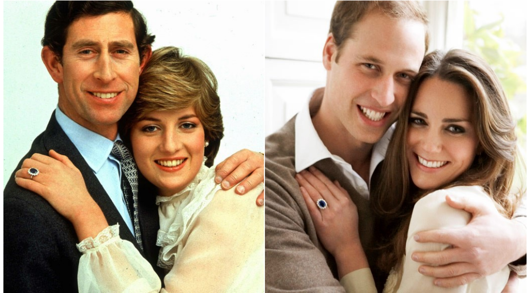
Figure 17: Charles and Diana's official engagement photo (left); William and Catherine's official engagement photo (right) 17

real life, but it is also a chance for them to honor his mother who would have loved to share in the couple's happiness.