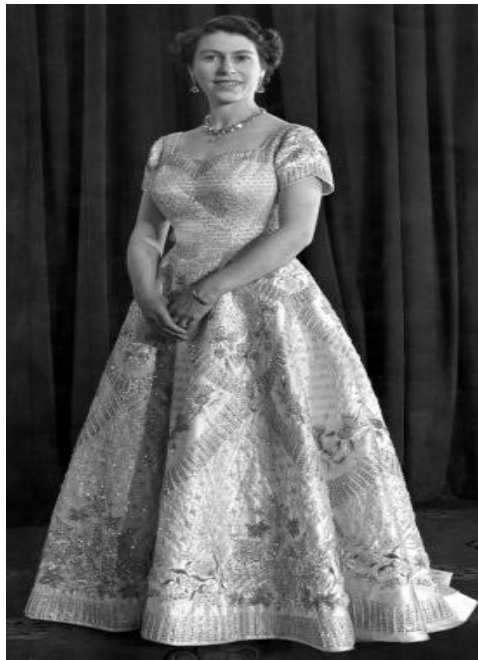
Figure 6: The Queen in the Throne Room Buckingham Palace 6

Queen Elizabeth is". But, the importance of that gown is that the gown is white, which is symbolic for two reasons. The first is the fact that the gown is similar to a wedding dress, which works as Elizabeth is going through another ceremony in order to be "wedded" to her country. The other thing is that according to Bedell Smith, "her garments...were designed to signify her priestlike status" (85). This idea goes back to the symbolism that white equates purity. In order for Elizabeth to successfully become Queen, she must "abject" anything that could taint her ability to be a sovereign ruler, figurehead of the government, and ruler of the military branches.