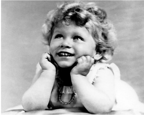
Figure 1. Princess Elizabeth aged two, in 1928. 1

The photograph also gives the impression that this is a child who is already confident. She is not looking straight at the camera and the photographer, but she is happily looking at what is above the frame. Although some think that people present confidence in a photograph by staring down the lens, it would have been interpreted by the British people as bad manners. Instead, by not noticing the camera or the photographer behind it, Elizabeth projects the image of the lovely and well-behaved child who could cooperate with being photographed in a certain way for a long period of time. This would suggest that Elizabeth is the very model of the British characteristic of having “good manners”. If she could behave for these frivolous photographs, many would believe that she could behave herself during official visits and ceremonies, despite her young age.