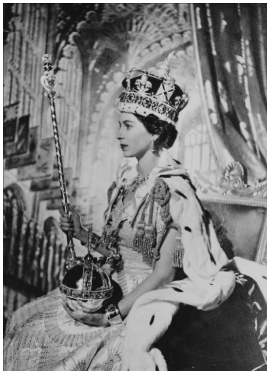
Figure 5: The Queen on the day of her Coronation, 2 June 1953. 55

idea is elevated by the fact that she has all of the traditional visual items of the coronation. If she was smiling during the picture, her visual rhetoric would be rendered ineffective because she would be seen as not taking this important ceremony seriously. She also shows that she is a patriot for the British cause. After all, she is accepting her rightful duty as Queen, so it has to be assumed that she does love the country and her people.