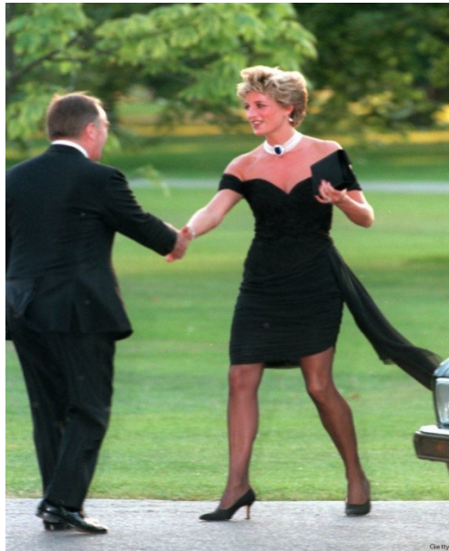
Figure 12. Diana at the Vanity Fair Party, 1995 12

This particular photograph, photographed for a newspaper or a magazine, illuminates how Diana uses her physical beauty to gain visual rhetoric. In fact, in this particular picture she looks like she is playing the part of someone who is extremely confident and comfortable in her own body. She was always known as being a fair and modest beauty, but her appearance at the Vanity Fair party disrupts all of those visual descriptors. Instead of being fair, she has a tan. Instead of being modest, she is wearing a very unroyal dress that shows off both her décolletage and legs.