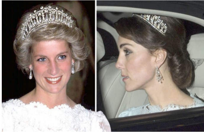
Figure 21: Diana wearing the Cambridge Lover's Knot tiara (left); Catherine wearing the Cambridge Lover's Knot tiara (right) 21

not around, Catherine can be a natural substitute for her mother-in-law, but without the sadness that is apparent throughout of her history. With Catherine, her happy ending is still happening and the royal lineage can continue, which is the importance of royals being photographed.