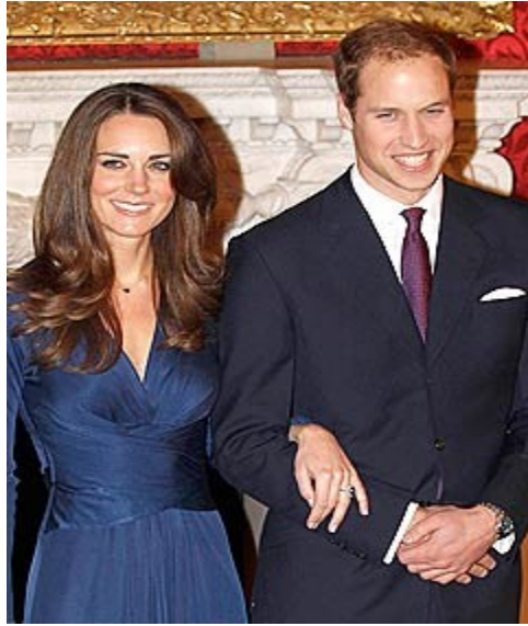
Figure 15. William and Catherine at their engagement press conference 15

considered an appropriate homage to her deceased mother-in-law without it being the exact same dress.