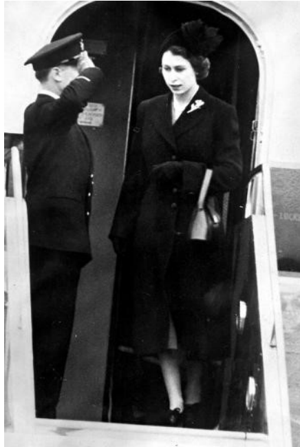
Figure 4. The 25-year-old Queen Elizabeth II returns to London from Kenya... 4

the “stiff upper lip” that is associated with the British people. She is grieving the loss of her father, but she cannot stay mired in that feeling for long because she has a country to lead now. The photograph also highlights how she represses showing any emotion publically as a way to gain ethos with her new subjects.