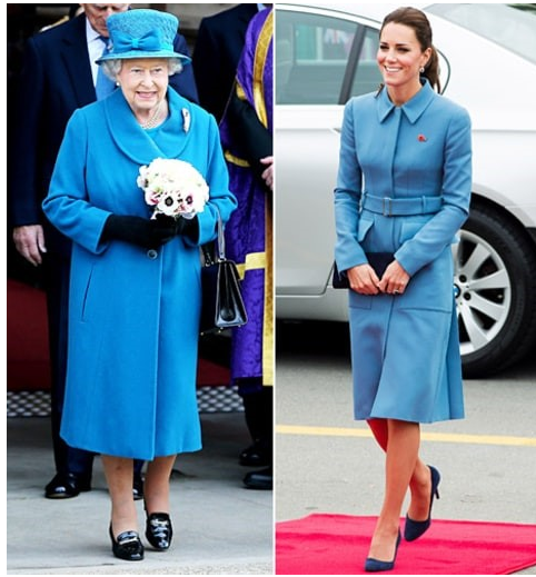
Figure 19. Elizabeth and Catherine wearing blue 19

In Figure 20 and Figure 21, Catherine is seen wearing items that are allusions to iconic items that Diana wore during her tenure as Princess of Wales. Arguably the most famous example of this was the outfit that Catherine wore to publicly show her son, Prince George for the first time (Figure 20). Her bespoke Jenny Packham blue polka-dotted dress immediately drew comparisons to a similar dress that Diana wore at Prince William's first public appearance. Many people saw this dress as not only a sign that William and Catherine knew the gender of their child, but they were deliberately ensuring that Diana was present, at least in memory, during the birth of their son, her first grandchild. With that thought in mind, it was seen as a lovely touch to someone who would have loved to have been a grandmother. It was also a nice sign for the public that they should also feel that they are fortunate to have the opportunity to see William's child that Diana did not get.