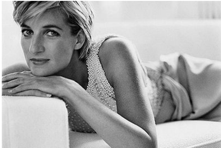
Figure 14. Diana, 1997 14

In this particular photograph (Figure 14), Diana is laying down on a white sofa. She is wearing a beaded sleeveless gown. She is reclining on the arm of the sofa with her hands posed under her chin. She barely has a smile on her face as she stares directly into the camera.