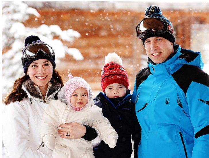
Figure 22: Catherine, Prince George, Princess Charlotte, and William on a family skiing holiday 22

their children soon. In an unusual move, William and Catherine allowed photographs to be taken of their private family holiday in the French Alps. In one of these photographs (Figure 22), William and Catherine are seen holding their children, Prince George of Cambridge and Princess Charlotte of Cambridge, outside of a lodge. They are all wearing attire appropriate for skiing with William and Catherine even wearing ski goggles. However, Catherine is not wearing gloves as her engagement ring is visible in the picture. William and Catherine are also smiling while the children look extremely confused as to why they are being photographed.