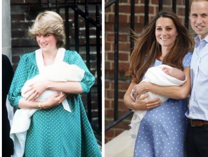
Figure 20. Diana holding Prince William (left); Catherine holding Prince George (right) 20

In the fall of 2015, Catherine caused a stir when she attended an event for bureaucrats wearing Diana's iconic tiara, the Cambridge Lover's Knot tiara (Figure 21) in a photograph disseminated in newspapers and social media. Many pundits expected Catherine to never wear it since it was so tied to Diana's image as the fairytale princess. However, this was Catherine's way of saying to her dissenters that she is not afraid of Diana's ghost haunting her items. In fact, she is going to embrace Diana's choices since she is so similar to her deceased mother-in-law. Both women were/are shy, smart, beautiful, and non-royal, so it only makes natural sense that Catherine leans heavily towards following her mother-in-law's example.