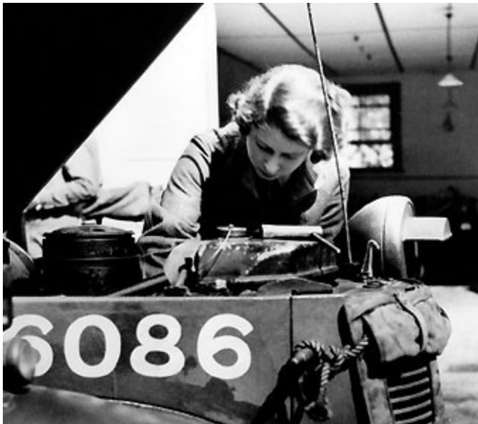
Figure 2. Princess Elizabeth tinkering with an engine during her ATS training in World War II. 2

In order to prove the detractors wrong, Elizabeth was able to display this military service through photographs such as one where she is shown “under the hood” of a military vehicle (Figure 2). She is unaccompanied as she works diligently on what appears to be the engine. Even though Elizabeth had to know that there was a photograph taken of her at the time, she does not show it.