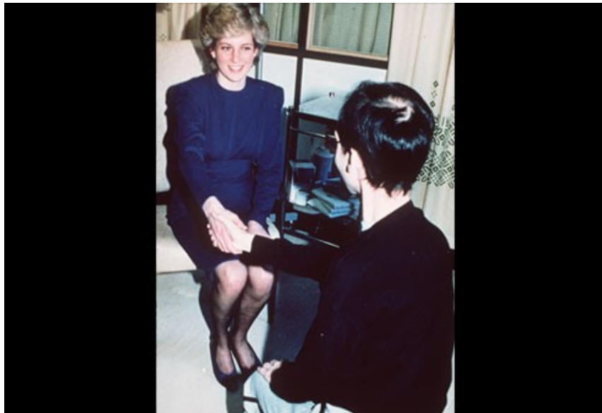
Figure 10. Diana shaking hands with an AIDS victim, 1987 10

company of an AIDS victims shows that she can understand that particular culture even if she does not belong to that culture. She also shows how “polite” she is. She is shaking hands with this man, even though it may go against people’s natural tendencies towards AIDS victims at the time. If she would have declined the handshake, people would have understood. Instead she still shook his hand. This idea also shows how “friendly” she is. She is smiling really wide with her mouth and her eyes, which shows approachability to a rather unapproachable situation.