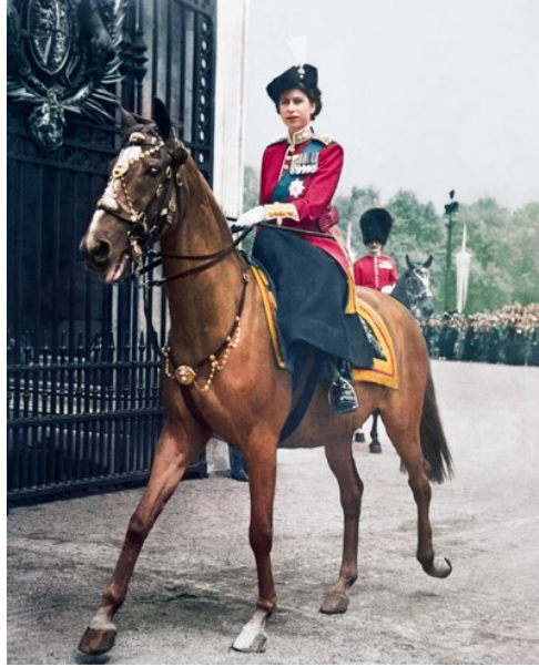
Figure 7: Queen Elizabeth on horseback during Trooping of the Colour 7

Although she largely has downplayed the stereotypical feminine aspects of her personality and image, she still retains certain aspects to show to her public that she is also the Queen Mother of her people. These aspects were shown in a photograph from the christening of her great-grandson, Prince George of Cambridge, from 2013. This event was symbolic of the fact that Elizabeth now has three direct heirs to the throne, which is an extremely rare event. In the photograph (Figure 8), Prince George is shown wearing a christening gown and being held by his smiling father, Prince William, Duke of Cambridge. He is standing next to his father, Charles, Prince of Wales, who is standing behind Queen Elizabeth's chair. Queen Elizabeth is seated and smiling with her hands folded neatly in her lap.