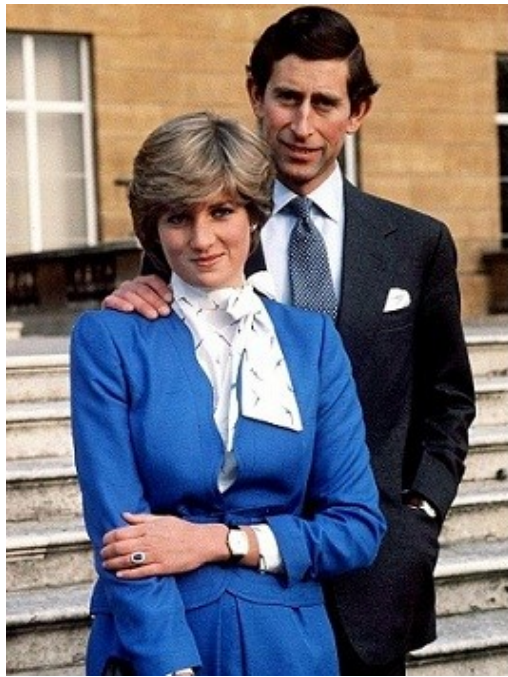
Figure 9. Prince Charles and Lady Diana Spencer on the day of their engagement. 9

each other's waist or hand, but instead Charles is just holding her shoulder and standing behind Diana, rather than beside Diana. It is like he is hiding behind Diana, rather than sharing the spotlight with her. Of course, the pose suggests that he already understands the public's demands to see Diana. Even though he was the heir apparent, she was the main attraction in their relationship. Charles just looks distant in the photograph. One of his hands is in his coat pocket, which is a typically casual stance. This is a formal picture, which requires a formal stance. By having his hand in his pocket, it reads like he is not fully committed to the picture.