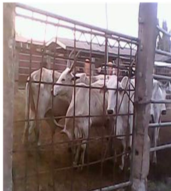
Figure 1: Cattle kept at open yard at Atokun