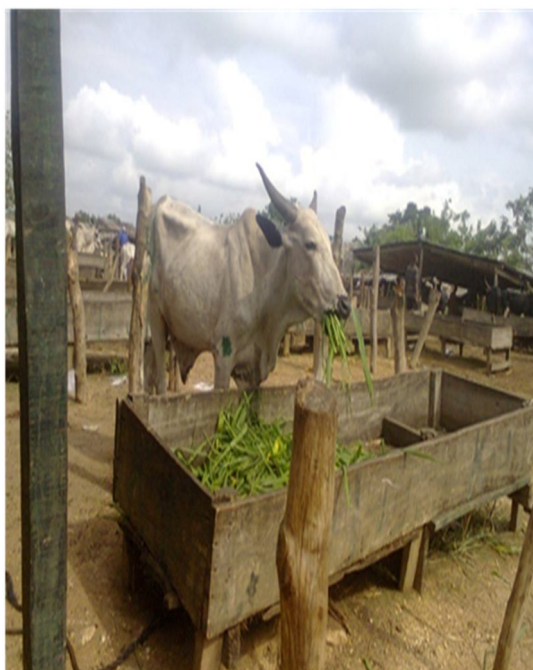
Figure 3: Cut and carry feeding system at Randa cattle market