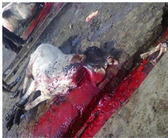
Figure 7: Muhammedian slaughtering at Randa

Lawrie, (1984) reported that external contamination of meat is a constant possibility from the moment of bleeding to consumption. Microorganisms could have contact with meat from the exterior of the animal and its intestinal tract as well as from knives, cloths, air, carts and equipment in