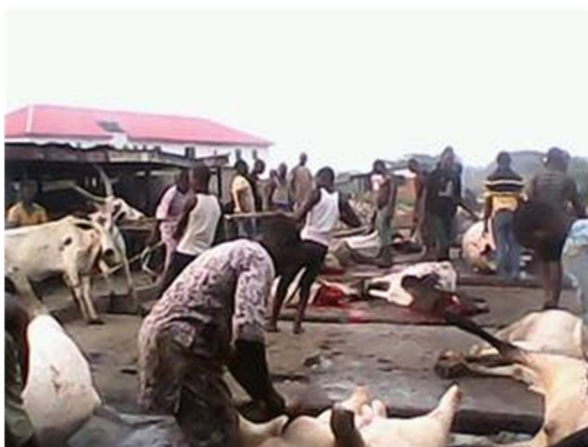
Figure 6: Pre slaughter procedures at Randa cattle market.

tion of beef to the meat stall, mainly through unsterilized jute bags, head pans and uncleaned boot of vehicles and the dropping of carcasses on dirty ground which was observed to be the regular practices at the slaughter slabs/ meat markets could have also predisposed beef to contamination.