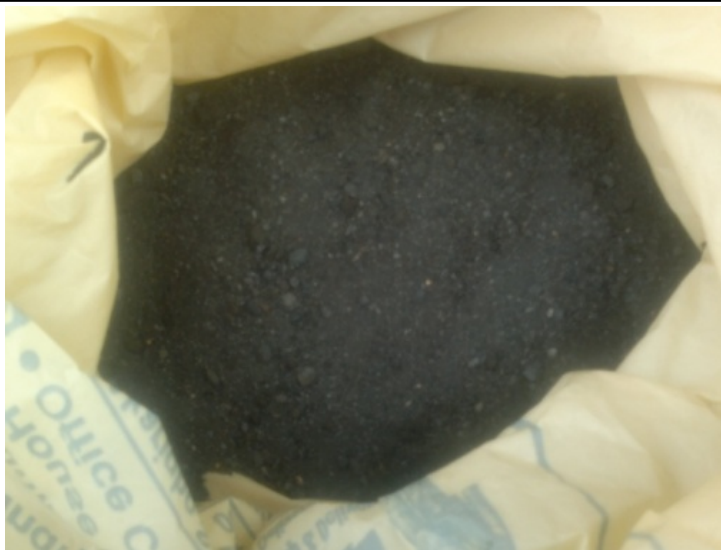
Figure 1: Foundry Sand Sample

The construction industries rely heavily on conventional materials such as cement, granite and sand for the production of concrete. The high and increasing cost of these materials has greatly hindered the development of shelter and other infrastructural facilities in developing countries. There arises the need for engineering considerations for the use of cheaper and locally available materials to meet desired need to enhance self efficiency and lead to an overall reduction in construction cost for sustainable development (Olutoge, 2010).