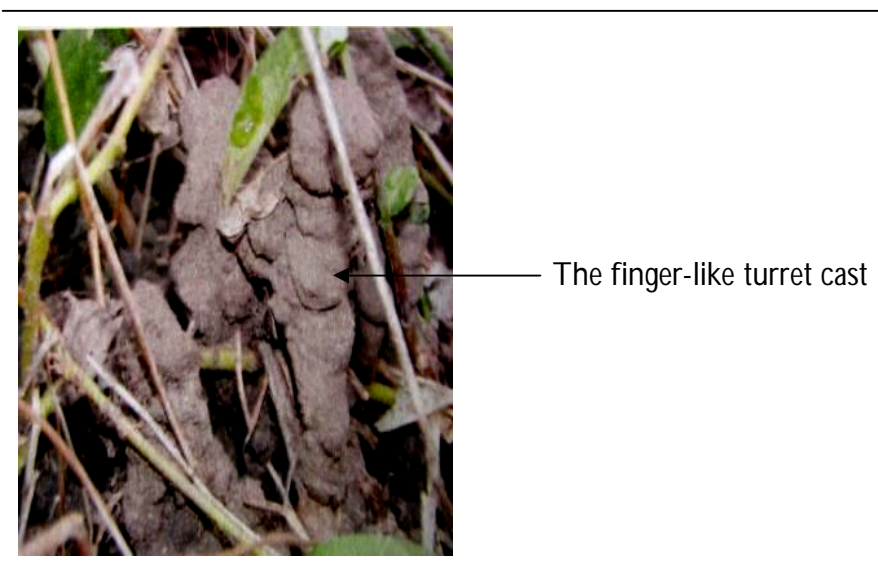
Plate 1: Finger-like turret casts in the under-growths