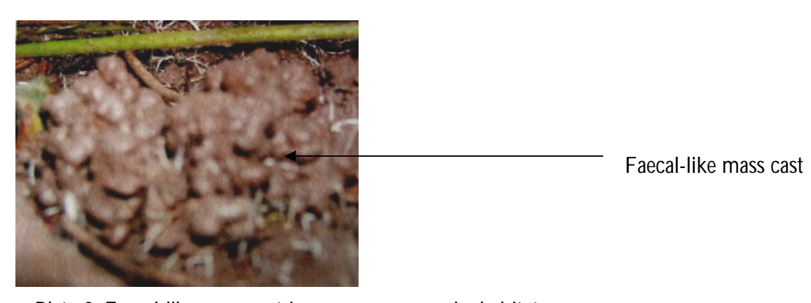
Plate 2: Faecal-like mass cast in more open marshy habitat