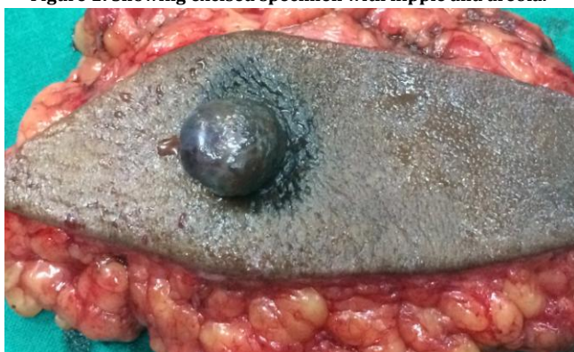
Figure 1: Showing excised specimen with nipple and areola.