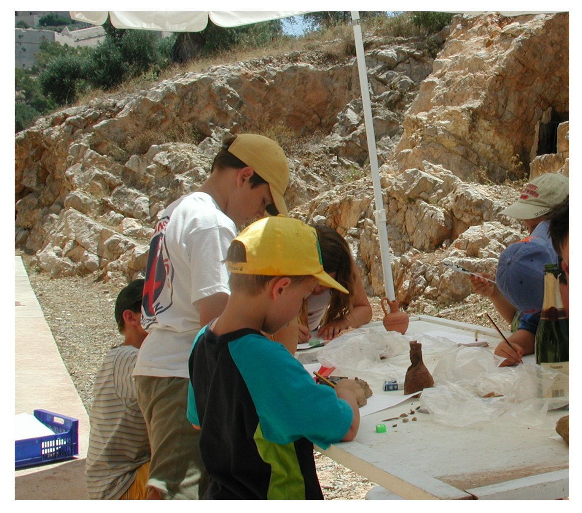
Figures 1-2. Archaeology one week summer school at the World Heritage necropolis of Puig des Molins in Ibiza (Spain).

The authors have participated, coordinated and run summer schools for children at Spanish museums. For example, at the museum of Puig des Molins (Ibiza, Spain), one week workshops were run throughout the summer for children aged between 8 and 12 years (Mezquida et al. 2003; Márquez et al. 2003; Figures 1 and 2). The workshop consisted of the excavation of graves and plastic skeletons and artefacts with the objective of presenting archaeology (and especially its techniques) to children and also raising their interest in the past and the historical heritage. It was an opportunity to allow children to learn about their local history and in a way that learning was multidisciplinary by using a number of skills used in mathematics (measuring), biology (human anatomy), geology (soils), drawing, etc.