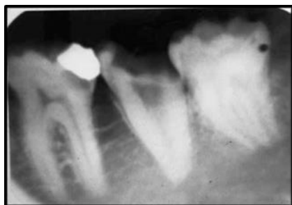
Figure 1. Carious Tooth 37 with Pulp Involvement

A 30-year-old female patient complained of pain of her lower back tooth. Intra oral examination revealed carious tooth 37 with pulp involvement (Figure 1).