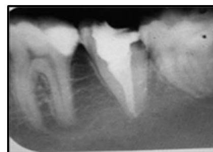
Figure 3. Obturation