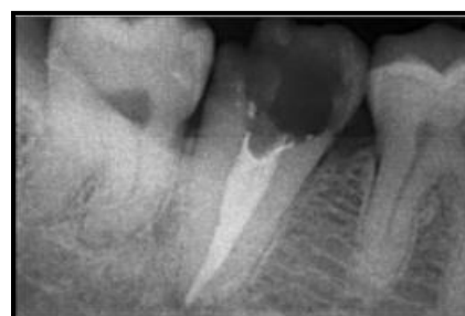
Figure 3. Obturation

Obturation of the canal was done with obtura and warm vertical condensation technique (Figure 3). A post obturation radiograph showed a well obturated canal.