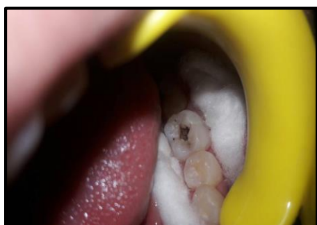
Figure 1. Clinical view of the carious lesion