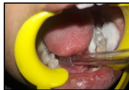
Figure 3. Restoration of the cavity using GIC