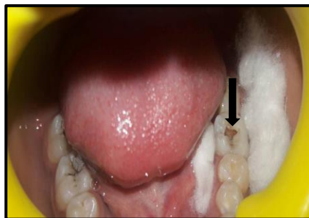
Figure 2. Removal of caries using spoon excavator. The black arrow depicts undermining enamel on the distal wall.