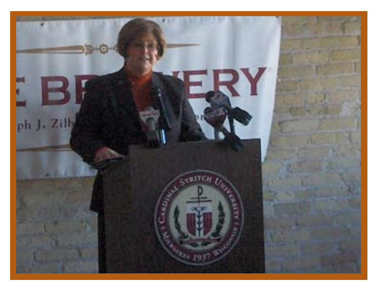
Dr. Sobehart announces Stritch's plans for the City Center site at a Dec. 22 news conference at the Pabst.

Stritch officials remain optimistic that the council will vote in favor of rezoning the property for PUD (planned unit development). A favorable vote will allow the University to sign all the papers buying the properties and begin planning of its new campus.