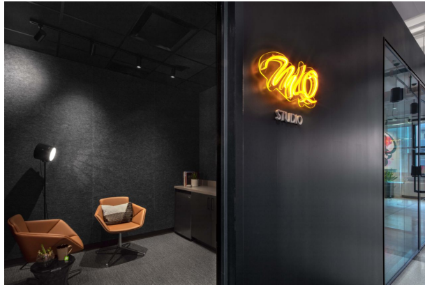
M. Moser Associates lactation room

M. Moser Associates The MLQ room at M. Moser's New York office.