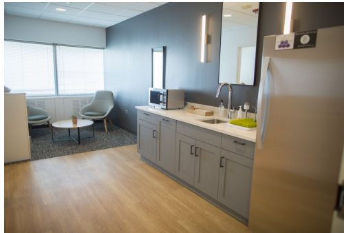
Ford lactation lounge

While the move to make pumping rooms more functional for nursing moms seems overdue, major companies are now starting to get on board with this movement. For example, Ford has announced an initiative to bring mothers' rooms to the company. New lactation lounges launched last month at Ford World Headquarters in Dearborn, Michigan. Their amenities include a waiting area featuring seating, a sink with filtered water, lockers, a refrigerator, microwave, and mirror, as well as private nursing suites with comfortable chairs, telephones, Wi-Fi, adjustable lighting, worktables, and industrial-grade breast pumps.