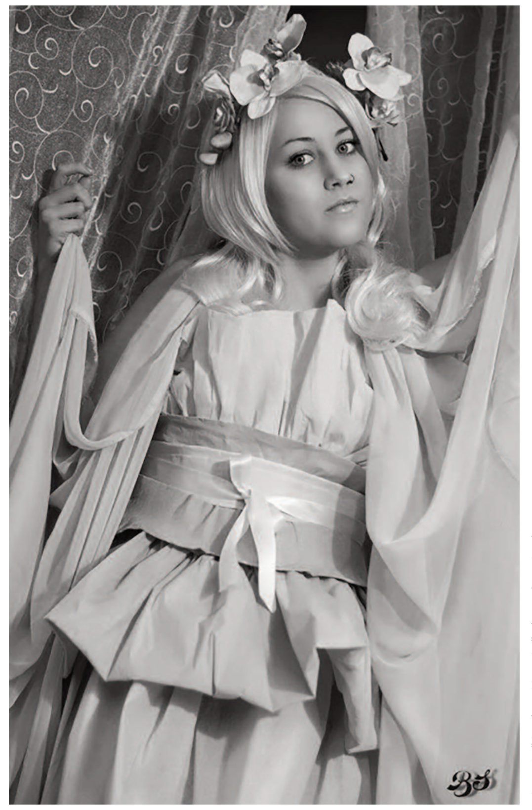
Figure 2. "Garden of Serenity", by Barbara Stäcker