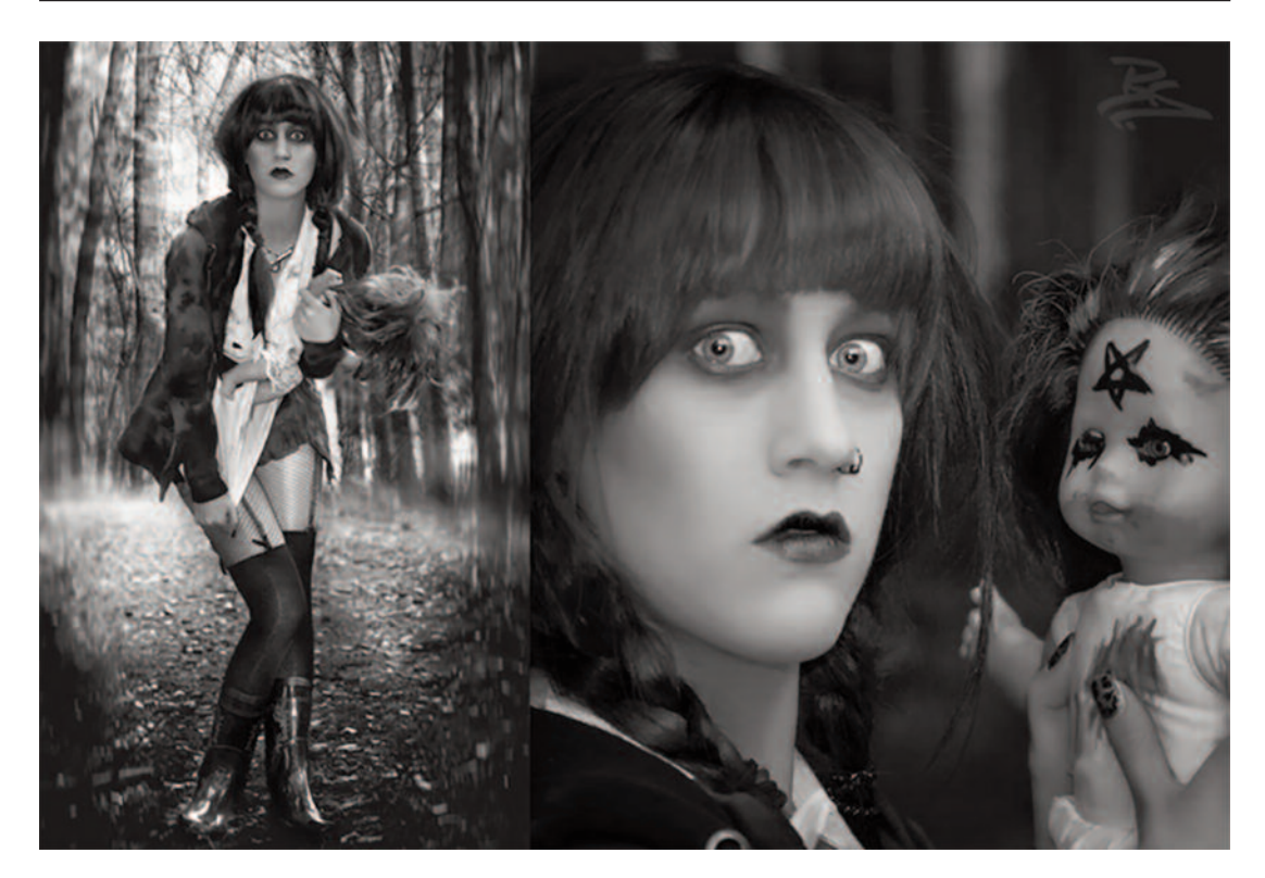
Figure 5. "Damaged," by Barbara Stäcker

half at the belly bottom). Her breasts are completely flattened with layers of tape (like a mini bra), her hair is very short and her hands are up in the air as though she was hand-cuffed, alluding to a bondage scene in which she performs the submissive role. The interaction with the photographer and her mother opens a double reading of her androgynous and eroticised breastless body: it turns Nana into a child that her mother can protect again, while at the same time the flattened breast and eroticised hand gesture queer her female body as androgynous and open her heterosexuality to the often-stigmatised practice of bondage and submission. While she submits to a dominant partner like her mother, the photographer, a lover or even cancer, her strong look also foregrounds how the