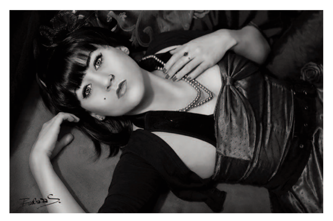
Figure 1. "Suspiria Snow White", by Barbara Stäcker

pher and caretaker became more prevalent (Bell 2012).<sup>5</sup> These postmodern photonarratives opened opportunities for readerviewers to become agents of witnessing and commemoration which, in turn, lead to "transformational encounters" (DeShazer 2012; 2014). More recently, digital cancer narratives in the form of selfies, blogs and social media websites forge connectivity by inspiring affective bonds (McCosker and Darcy 2013; Mahato 2011).