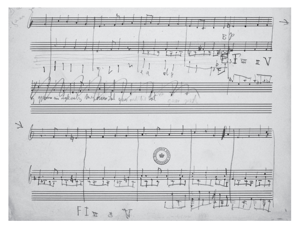
EX. 2: Nielsen's draft for the beginning of the song 'I Solen gaar jeg bag min Plov'. The Royal Library, Copenhagen.

merely alluded to – for no more than a couple of bars. Indeed, many of these songs exhibit a miniature manifestation of the shifting diatonicism – what Daniel Grimley calls a 'fractured musical surface'<sup>8</sup> – that has been found to thwart expectation in Nielsen's large-scale compositions. In other words, despite his expressed aim of simplicity and accessibility, Nielsen tested the bounds of the overriding tonic surprisingly often in his folkelige songs.