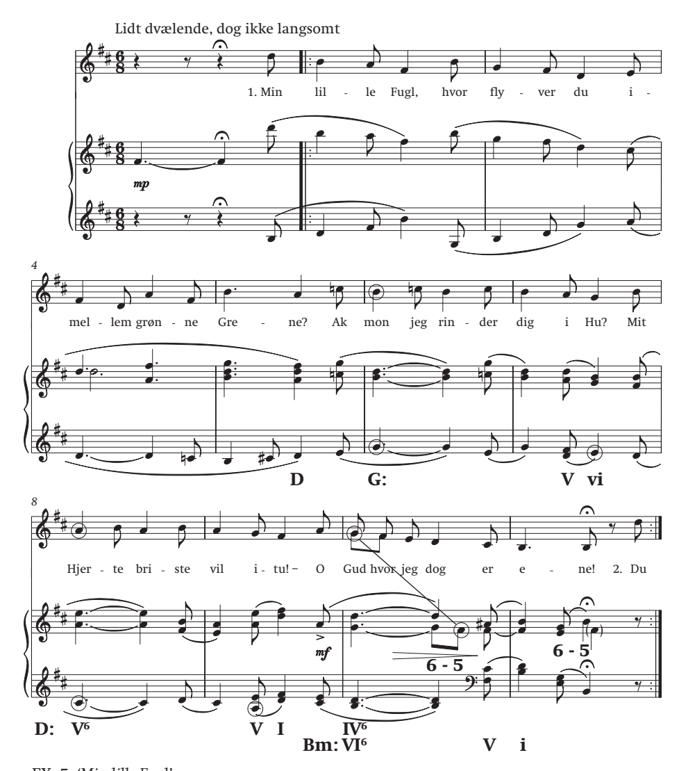
EX. 5: 'Min lille Fugl'.

is practically over before B minor exerts its authority. This abrupt tonal reorientation is made all the more obvious by the accompaniment's descent into the bass range for the very first time and the strong root-position progressions, virtually absent until now.