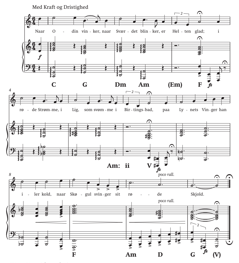
EX. 3: 'Naar Odin vinker'

tial-sounding vocal line. And yet, the intricacies of his setting suggest that he sought to transcend this theme of heroism and to express an even more timeless message.