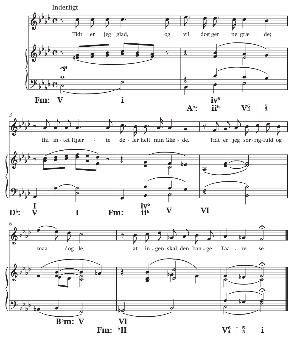
EX. 4: 'Tidt er jeg glad'.

at the seams because Nielsen has arranged the harmony so that the end of one phrase is at the same time the beginning of the next. Each phrase ends on a dominant that progresses into the next phrase; this musical dependency matches the poetry's string of dependent clauses. Also, on a larger scale, the two-bar units are joined by a circle-of-fifths sequence. At the end of the first phrase, instead of launching this sequential progression, Nielsen might have returned to the F minor tonic, the iv<sup>6</sup> in bar 2 leading to V as the listener expects, just as the poet might have explained the protagonist's