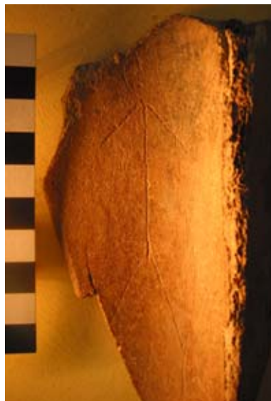
Figure 9. Apparently iconographic engraving on bone, from Oldisleben 1, Germany, from a Micoquian context (Bednarik 2006).

The largest assemblage of Lower Paleolithic, much earlier engravings is that from Bilzingsleben (Mania and Mania 1988; Bednarik 1988, 1995; Steguweit 1999). Other examples are the finds from Sainte Anne I, France (Raynal and Séguy 1986; Crémades 1996); Whylen in Germany (Moog 1939); Kozarnika Cave in Bulgaria; and Wonderwork Cave in South Africa (P. Beaumont, pers. comm.). Middle Paleolithic engravings are numerous in Europe, southwestern Asia and southern Africa. They include those from Schulen, Belgium (Huyge 1990); Bacho Kiro and Temnata Cave, Bulgaria (Marshack 1976; Crémades et al. 1995); Tata, Hungary (Bednarik 2003c); La Quina and La Ferrassie, both France (Martin 1907-10; Marshack 1976, 1991; Capitan and Peyrony 1912, 1921), as well as Grotte Vaufray (Vincent 1988), Abri Suard (Duport 1960; Debénath and Duport 1971; Crémades 1996), Peyrere 1 Cave (d’Errico and Allard 1997), all in France; Tagliente Shelter, Italy (Leonardi 1988); Cueva Morín, Spain (Freeman and Gonzalez Echegaray 1983); Prolom 2, Ukraine (Stepanchuk 1993); Kebara Cave (Davis 1974), Quneitra (Goren-Inbar 1990; Marshack 1996) and Qafzeh Cave (Hovers et al. 1997), all three in Israel; and in South Africa Howieson’s Poort Shelter (Stapleton and Hewitt 1928), Apollo 11 Cave (Wendt 1974, 1976;