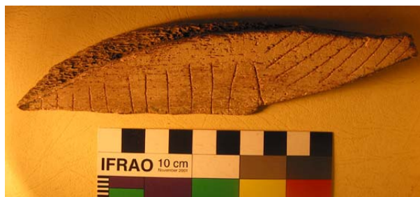
Figure 8. Portable engraving on bone, from Oldisleben 1 in Germany, of the early Late Pleistocene (Bednarik 2006).

made with stone tools. In a number of cases their skepticism was indeed justified, but the tendency of extrapolating from them has stifled the study of symbol origins. The two main objections were that among the many examples of pre-Upper Paleolithic engravings, there were no recognizable motif templates, and that there were no repeated patterns. Both of these objections have now been refuted, in fact at a single site. Oldisleben 1, of the Eem geological period north of Weimar, Germany, belongs to the eastern Micoquian tool industry. Together with a distinctive stone tool tradition dating broadly from between 135,000 and 80,000 years ago, three engraved bone fragments were recovered (Bednarik 2006). Two of them bear series of sub-parallel grooves made with such precision and under such conditions that their intentionality cannot realistically be questioned (see figure 8):