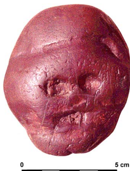
Figure 1. The Makapansgat jasperite cobble, earliest palaeoart find known, 2.5 to 3 million years old, South Africa (Bednarik 1998).