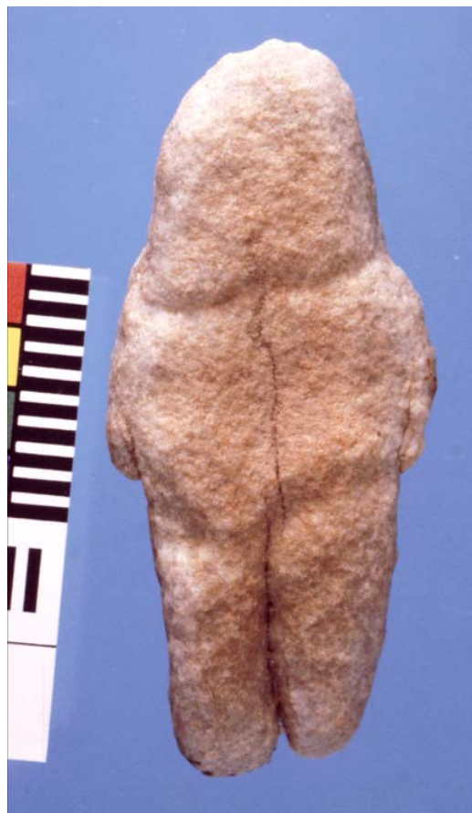
Figure 4. The Tan-Tan proto-figurine, c. 400,000 years old, is the earliest find of its kind, and also the earliest evidence of the application of pigment (Bednarik 2003b).

The practice of modifying natural objects to emphasize some iconic quality has persisted ever since, it can be found through the succeeding periods of the Paleolithic and it can still be found today. In a scientific sense it is a subtle management of visual ambiguity: the defining characteristics of an iconographically already ambiguous object are intentionally accentuated.