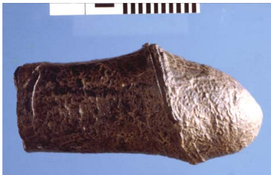
Figure 2. The Erfoud manuport, from a Late Acheulian dwelling in Morocco (Bednarik 2002).

Such objects attracted sufficient curiosity to be collected and taken back to occupation sites. The ability of detecting such levels of iconicity is certainly not