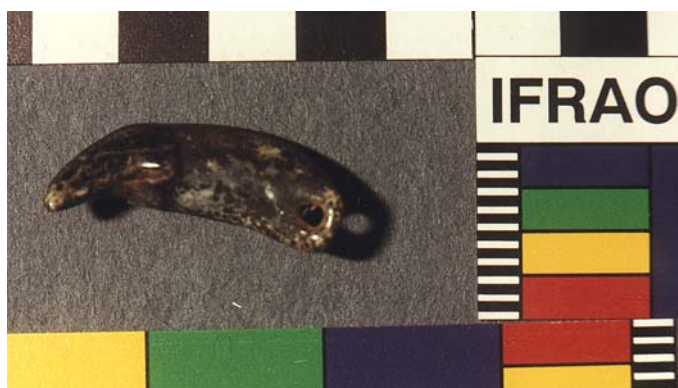
Figure 6. One of the two oldest pendants known in the world, a perforated wolf's canine from Repolusthöhle in Austria, c. 300,000 years old (Bednarik 1992).

Such explanations are of course not archaeologically recoverable, but the specimens themselves proving symboling ability are. Beads of the Lower Paleolithic are available not only from the French and English Acheulian, but also from sites in Austria (See figure 6), Libya and Israel (Bednarik 1992, 2001, 2003c).