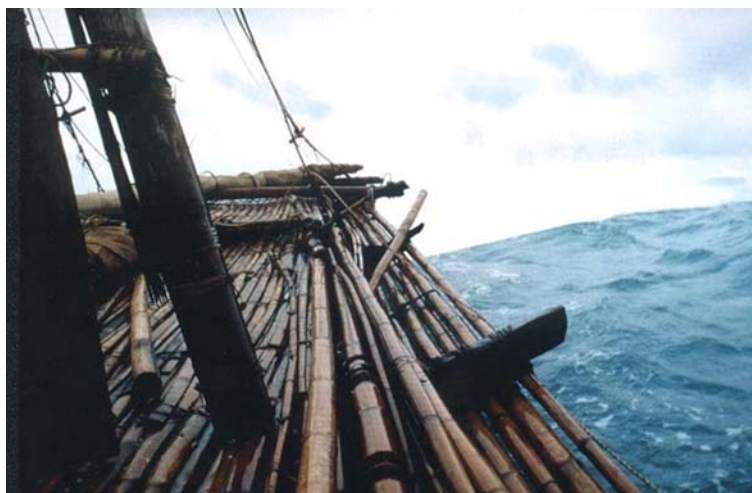
Figure 3. Paleolithic seafaring experiment. This bamboo raft was built with stone tools and sailed across the Timor Sea in December 1998 (Bednarik 2003c).

does so with the introduction of seafaring in Wallacea, Indonesia (Bednarik 1999b, 2003b). The last-mentioned, in particular, tells us a great deal about the developing symboling ability of humans, and in more ways than one. One of the most sophisticated symbol systems developed by our lineage is of course language, and it is widely agreed that maritime navigation and colonization of lands by seagoing vessels presupposes fairly complex communication forms, almost certainly of the verbal kind. Since Pleistocene seafaring necessarily involved forward planning and coordinated community efforts (Bednarik and Kuckenbug 1999), it is almost impossible to account for it in the absence of 'reflective' language (Davidson and Noble 1989). But there are even more relevant incidental effects. Seafaring is the earliest example we have in hominin history of the domestication of multiple natural systems of energy. It harnesses the combined effects of waves, currents, wind and buoyancy, and it remains the most complex utilization of energy systems throughout the Pleistocene period (see figure 3):