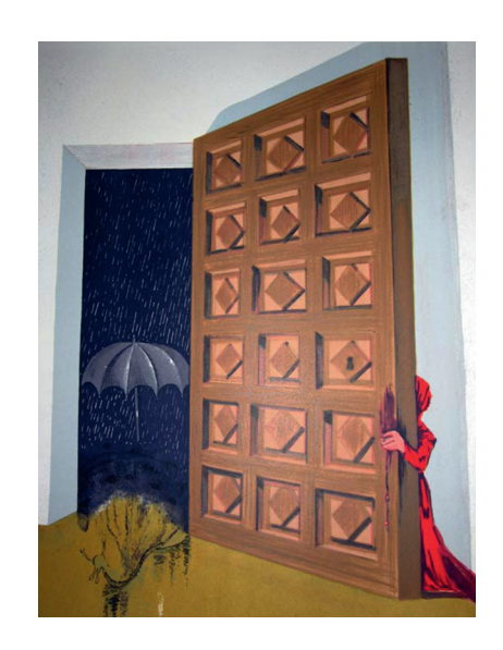
III. 1 [Salvador Dalí, The Girl who Trod on the Loaf, 1966. Colored lithograph on paper based on Dalí's original gouaches illustrating Hans Christian Andersen's fairy tales, 65.4 x 50.5 cm. ]