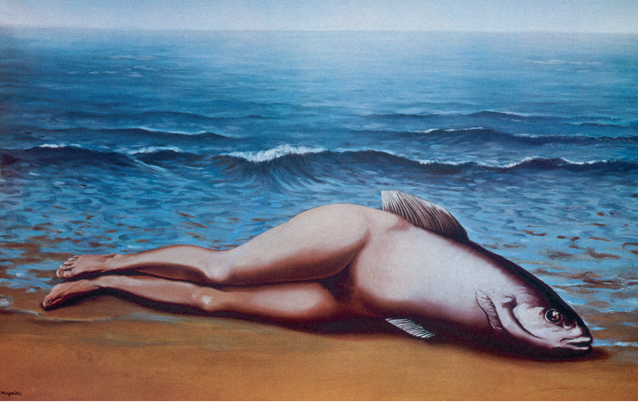
III. 6 [René Magritte L'invention collective [Collective invention] 1935. Oil on canvas, 73 x 116 cm. Private Collection. © Rene Magritte, The Estate of Magritte/billedkunst.dk 2014 & © 2014. Bl, ADAGP, Paris/Scala Florence.]

with the surrounding sea, while an increasingly ominous sky looms above her; her eyes widening and staring directly and insistently at the spectator, a daunting signal of doom. The eyes are closed demonstratively again before she freezes back into immobility.