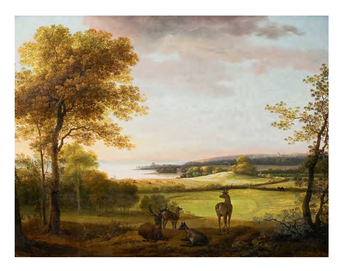
III. 2 [Jens Juel, View from Sørup of Fredensborg Castle, c. 1782. Oil on canvas, 60.6 x 77.5 cm. Fuglsang Kunstmuseum, Toreby, ]

merges seamlessly with the productive universe of nature in the background must have been occupied by the Dowager Queen Juliane Marie (1729-1796), who shared the real power in the country with Ove Høegh-Guldberg (1731-1808) after the fall of Johann Friedrich Struensee (1737-1772). But the prevailing patriotic discourse did not limit the unified national sense of belonging to a specific place. Instead, it was grounded in the citizenship concept, where the crucial factor was the duties and rights the individual had in relation to the State, with the King as its the highest authority.<sup>2</sup>