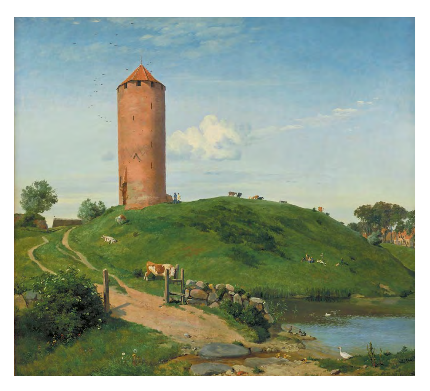
III. 5 [J. Th. Lundbye, The Goose Tower in Vordingborg , 1842. Oil on canvas, 141.2 x 156.5 cm. Statens Museum for Kunst, Copenhagen]

were attached; a medieval tower from the fortifications of King Valdemar Atterdag in Vordingborg; and a Renaissance castle in northern Zealand. All are situated in the Danish landscape.