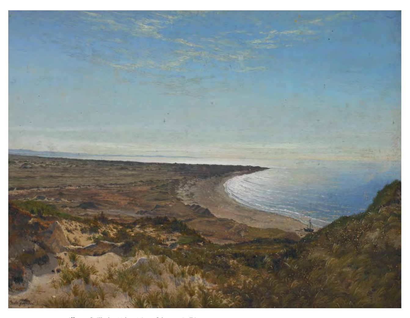
III. 17 [Vilhelm Kyhn, View of the sea, Bulbjerg, 1845. Oil on canvas, 30 x 41 cm. Private collection, ]