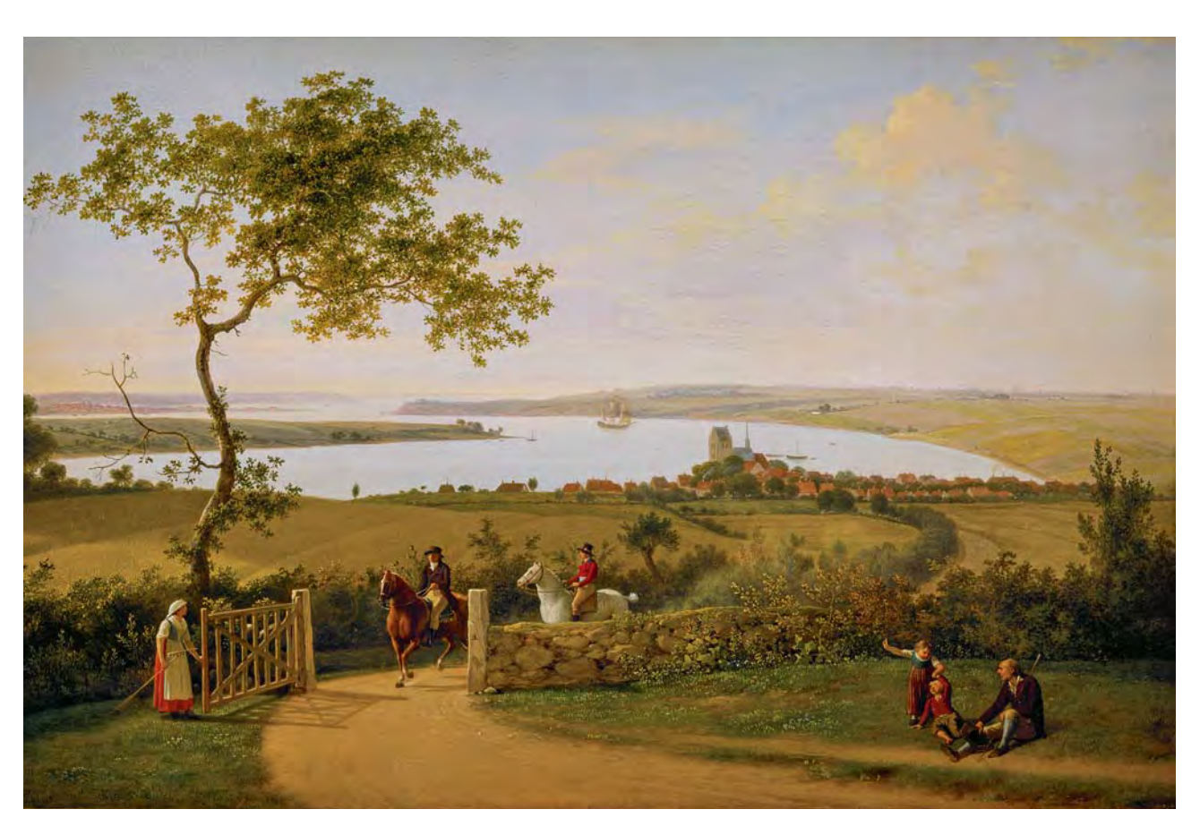
III. 4 [Jens Juel, View across the Little Belt from a hill at Middelfart , c. 1800. Oil on canvas, 42.3 x 62.5 cm. Thorvaldsens Museum, Copenhagen]

seems deliberately to aspire to the natural, rather than the regulated. The winding road functions as a striking compositional element that unifies the picture planes rather than separating and instituting boundaries, as is the case in the former work. Class distinctions are emphasized in View across the Little Belt from Hindsgavl on Funen in a very distinct way from in View across the Little Belt from a hill at Middelfart . However, class difference is not abolished altogether in the second painting; instead, an easygoing co-existence of peasant and lord is implied. Patriotism and the great agrarian reforms were not only echoes of the 'Liberty, Equality, Fraternity' of the French Revolution, they were also a pragmatic means of maintaining the existing class boundaries by giving the peasants a number of concessions and new privileges.