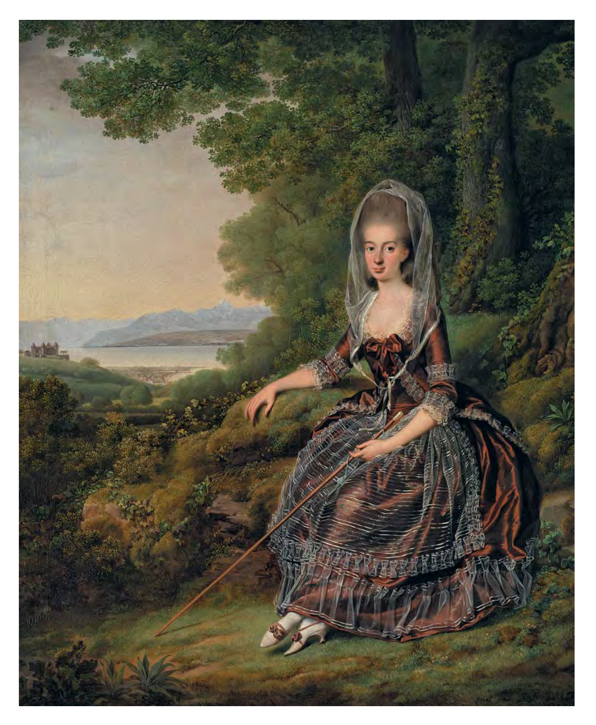
III. 1 [Jens Juel, Baroness Matilda Guiguer de Prangins in her park by Lake Geneva , 1779. Oil on canvas, 86.5 x 72 cm. Statens Museum for Kunst, Copenhagen]

There is laundry bleaching and the humble figures of peasants filling the middle ground with busy patriotic activity, which is discreetly accentuated by the smoke that billows from the chimney of a small house that can be glimpsed in the middle ground of the picture. The patriotic citizen was willing to make an effort for his fatherland; this was not necessarily the same as the country in which he was born – but more on this later.