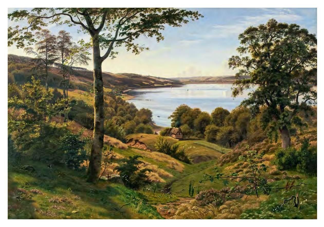
III. 11 [Vilhelm Kyhn, View by Vejle Fjord, 1862.Oil on canvas, 151 x 221 cm. ARoS Aarhus Kunstmuseum]

the preliminary sketch for the work; nor are the tall, slender beeches as prominent as in the final work. These are features which may reasonably be assumed to have entered the picture at the wish of the commissioner in order to accentuate the national statement in the piece.