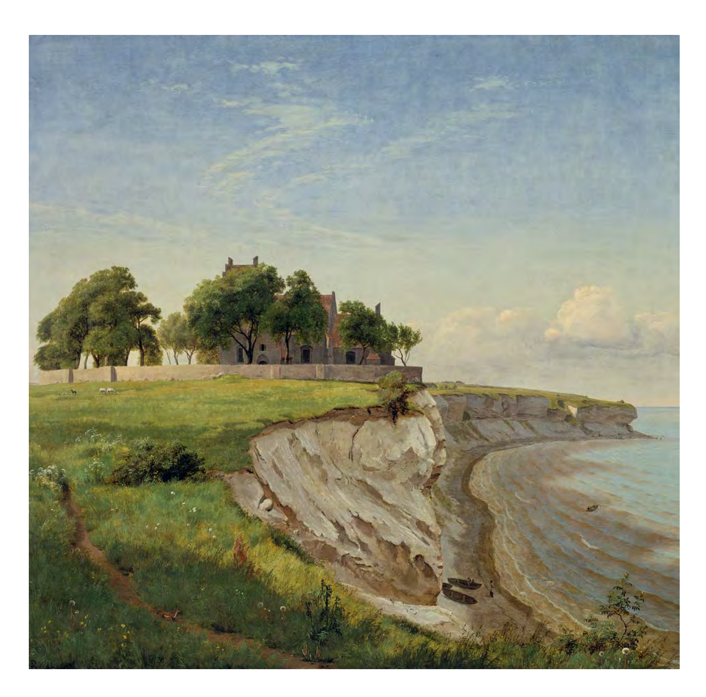
III. 6 [P. C. Skovgaard, Højerup Church at Stevns Klint, 1842.Oil on canvas, 142.2 x 149.5 cm. Statens Museum for Kunst, Copenhagen]