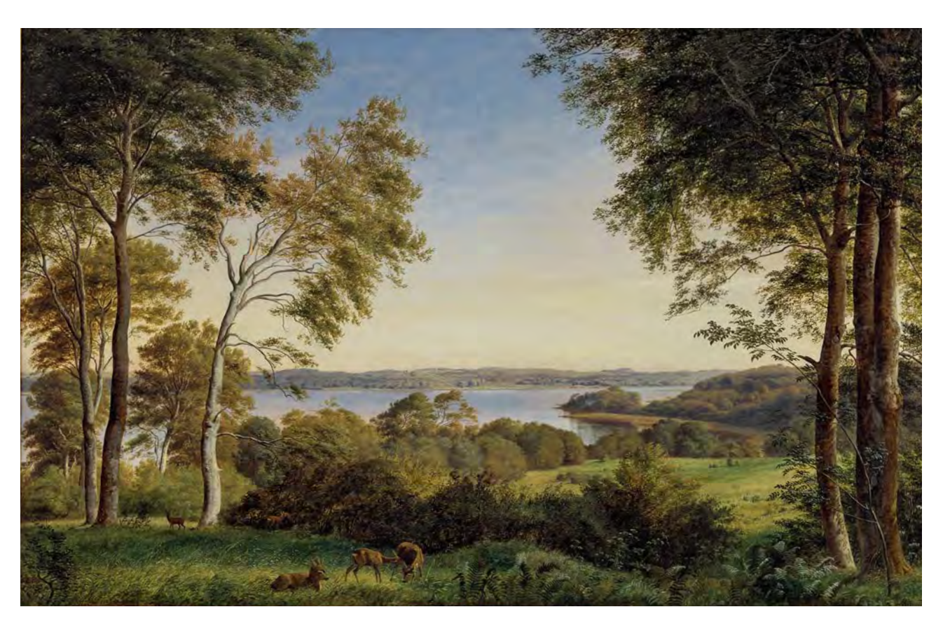
III. 12 [P. C. Skovgaard, View of Lake Skarre, 1845.Oil on canvas, 127 x 195 cm. Statens Museum for Kunst, Copenhagen]

being so specific to the place, it is also striking to see how much the subject recalls, for example, P. C. Skovgaard's monumental subject from the lake Skarresø ( View of Lake Skarre , 1845; ill. 12). It was not far from Zealand to Jutland.