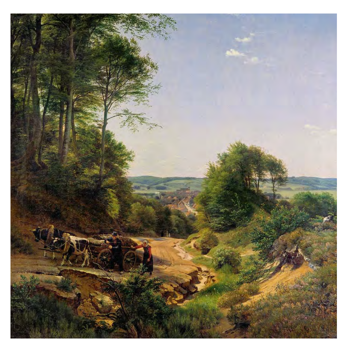
III. 10 [P. C. Skovgaard, View of Vejle, 1852. Oil on canvas, 98 x 100 cm. Vejle Kunstmuseum]

Skovgaard's response to this was a picture that included features associated with the beech woods favoured by the Zealand aesthetic, but at the same time differentiated itself by its emphasis on the hilly terrain which had no parallel in Zealand. The hilly landscape is viewed from a high point, with the town of Vejle in the embrace of the valley far off in the distance. The picture is built up around a winding gravel road which is lined with slender beeches, and on the road there is a scene of an ox-drawn cart toiling uphill with the aid of a couple belonging to the farming class. Far down the road, a group of bourgeois ladies and children are moving in the same direction. Since the Falster speech of 1741, Lehmann had struggled persistently to mobilize the farming class in the battle against absolutism, and after the adoption of the June Constitution to convince the 'Friends of the Farmers' that the National-Liberals were an obvious political ally (Wammen 224-226). Perhaps it was these factors that Skovgaard, with Lehmann as his commissioner, was referring to in his interpretation of the Vejle landscape? It is at all events worth noting that neither of the figure groups on the road is present in