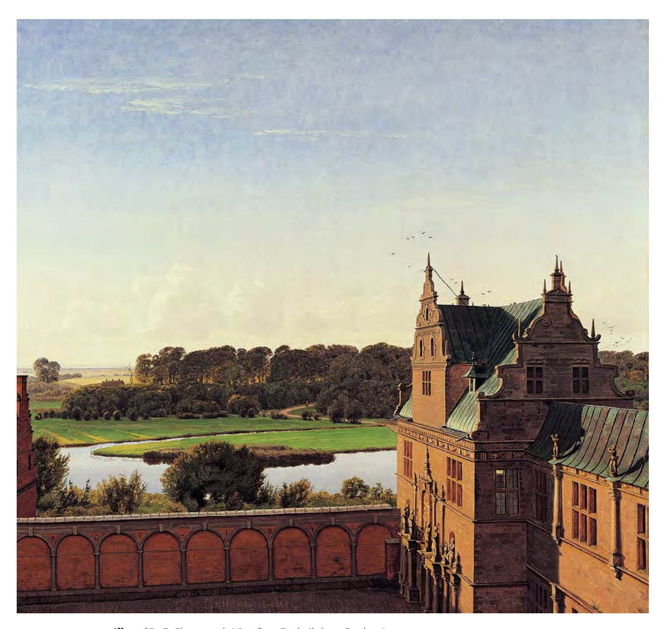
III. 7 [P. C. Skovgaard, View from Frederiksborg Castle, 1842.Oil on canvas, 140 x 150 cm. Ordrupgaard, Copenhagen]

I was lured to the windows and the wonderful, lovely view across the lake [...]. Especially yesterday with the afternoon sun and the clear spring sky, it was so entirely charming that more than once I had to confess that the view is one of the finest things the castle possesses. (Molbech 10-11)