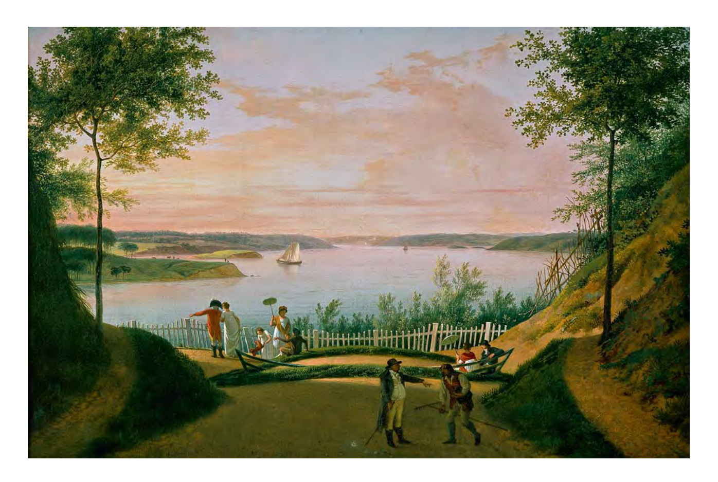
III. 3 [Jens Juel, View across the Little Belt from Hindsgavl on Funen, c. 1800.Oil on canvas, 42 x 62.5 cm. Thorvaldsens Museum, Copenhagen, ]