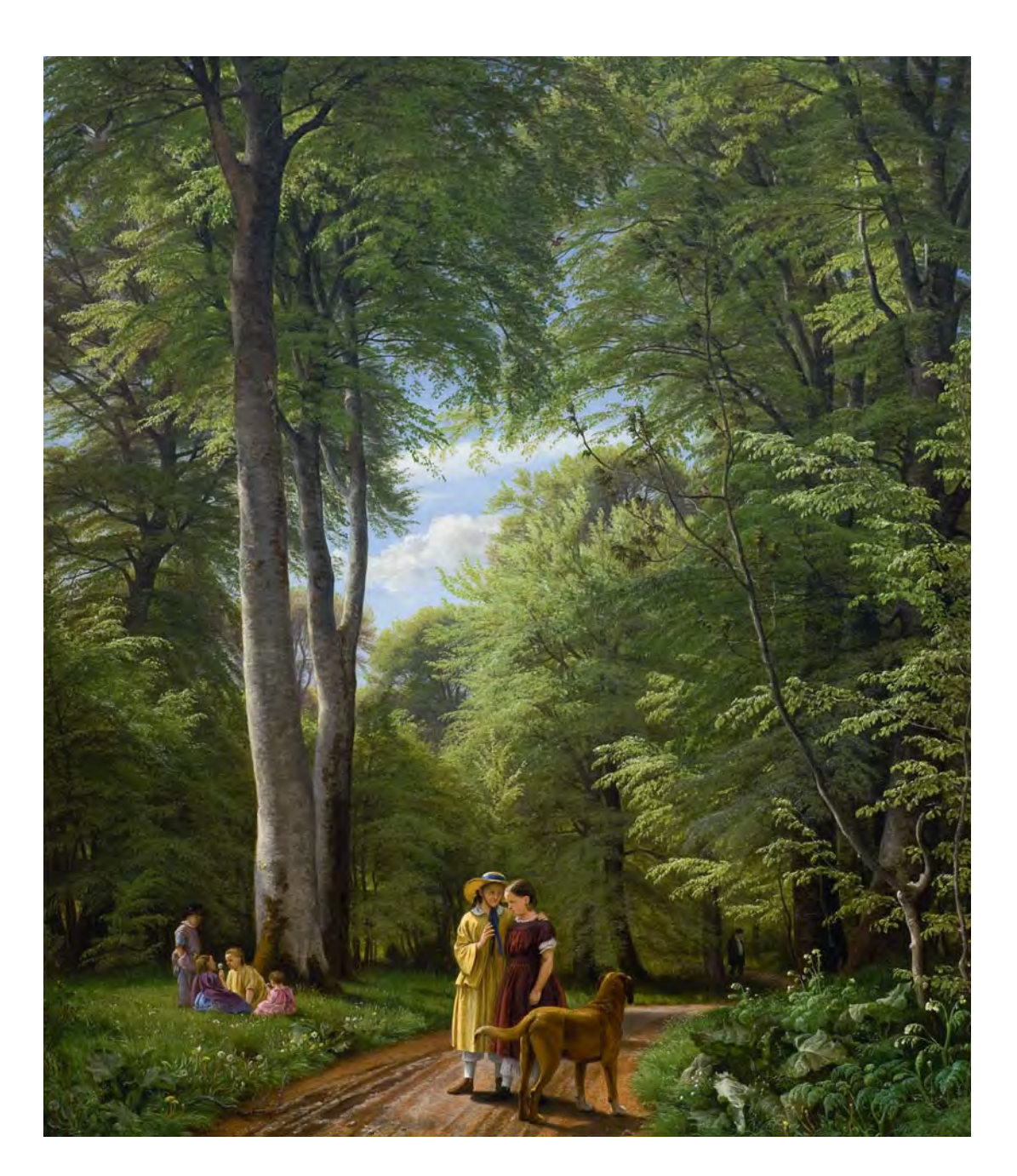
III. 14 [P. C. Skovgaard, Beech wood in May. Subject from Iselingen , 1857. Oil on canvas, 189.5 x 158.5 cm. Statens Museum for Kunst, Copenhagen]

resources of the forest, made its reproduction difficult. Timber had suddenly become a valuable political resource that was decidedly scarce in the Danish kingdom. This was to be remedied by the Forest Reserve Ordinance's regulation of access to forest areas, its protection orders and the fencing-in of the forests; and Iselingen, as mentioned, was one of the places where the interaction between these regulations and Ordinance's instructions for rational and economically sustainable forestry had most conspicuously borne fruit.