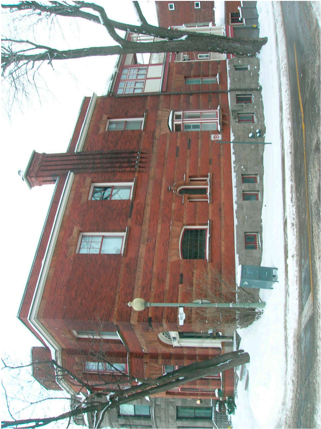
Figure 5. Levine lived in a basement room here, 4274 Dorchester Blvd. West, Montreal in 1947-48.