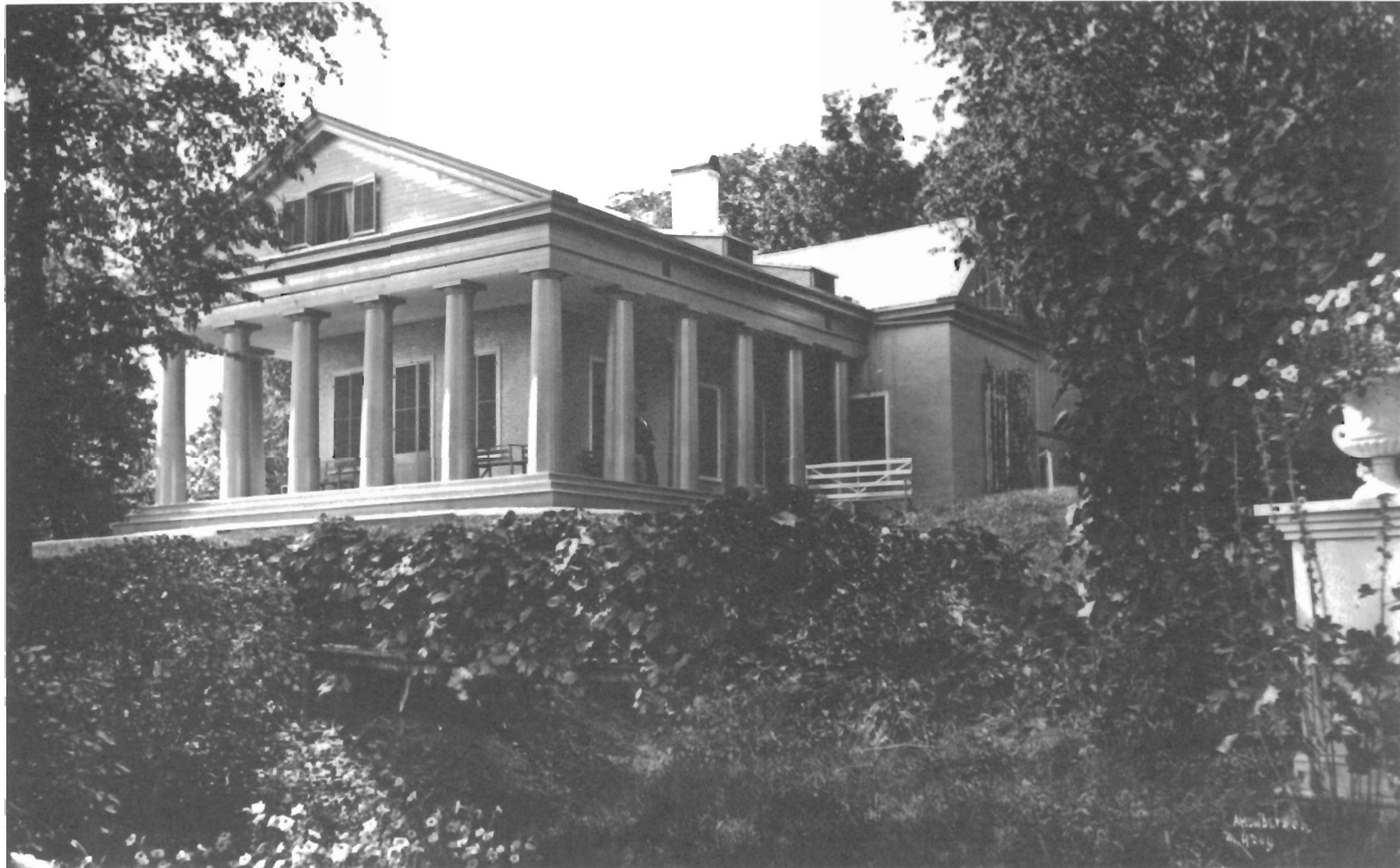
Figure 5. D.R. McCord's house, Temple Grove, Montreal, 1872. (Modern print from the original collodion glass plate negative taken by Alexander Henderson. McCord Museum of Canadian History, Montreal.)

"When There Is No Vision, the People Perish."