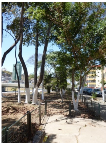
Figure 6. The picture shows the area between the buildings in the Conjunto IAPI and the Avenida Antônio Carlos (Photo by Mario Peters, 2014).

Another aspect that the residents mentioned was the urbanization of the favela, which helped improve living conditions and also affected the aesthetic aspect. It is important to point out that although the conjunto is located very close to the city center and beside a highway linking the center with Pampulha 18 (which gives it great visibility), it occupies a corner of the Lagoinha district between the highway and the favela, so that nobody is likely to enter the conjunto unless they are going to visit someone there. In addition, the apartment blocks are separated from the street by railings and gardens, so that they stand some distance from the street.