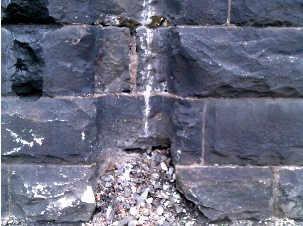
Figure 7. Photograph of and quote about emotional support and alleviation of fear and anxiety

“A doctor will stand sturdy and strong and hold up to you, tell you the truth if you want to hear it or not. The reinforcement of this wall, which is also part of that bridge that’s even a sturdier, these sort of pillars that are holding it up here... This wall is the foundation making sure everything holds together, such as you holding yourself together. Your doctor is making sure you hold it together whenever he gives you the good news or bad news... So, it’s kind of like a mutual-relationship then... The wall is there to let you know that sometimes you might break down and crumble, but you can also stay sturdy and stay strong. They might get some bad news about their health and they may crumble a little bit, but they can still stand strong and bear through it and deal with the situation and move on, not fold up, or crumble up, and just go to dust.”