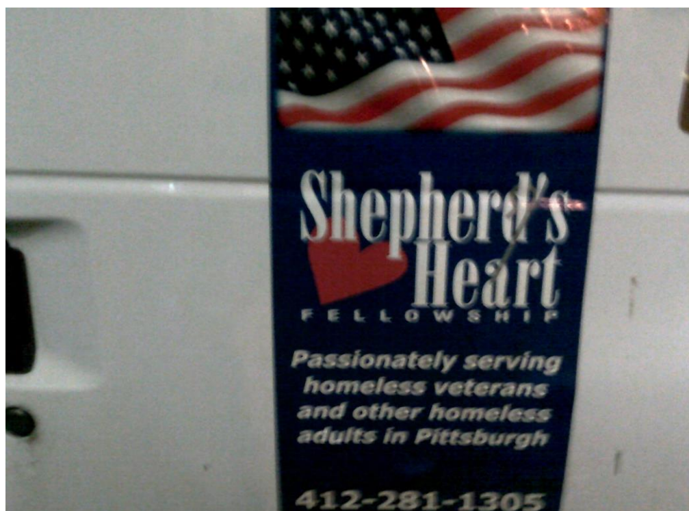
Figure 5. Photograph of and quote about physical comfort

“That’s a picture of the sign out front of the Veteran’s Center where I live now, where I’m staying. My thinking was that take a picture of something that pertains to the road you’re taking to make yourself better... I have a roof over my head, meals, I don’t have to worry about taking my meds because they give them to me.”