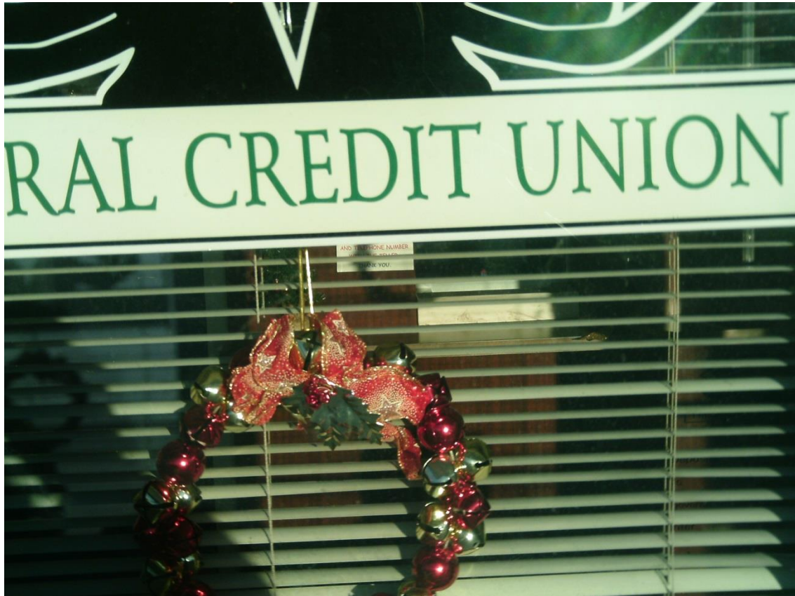
Figure 2. Photograph of quote about respect for patient's values, preference and expressed needs

“Well, when you come in for your meetings with the health care provider, [they ask] how you’ve been doing, where you’ve been going, what you’ve been doing. So that dialogue, through that conversation, through them conversations, through them meetings [I can] express. I mean, there’s so many variations of what’s talked about. It can be like these pictures, they could be your housing situation, your financial situation, your medical situation, your physical situation, your health situation because everything networks off of everything else. Everything is inter-connected.”