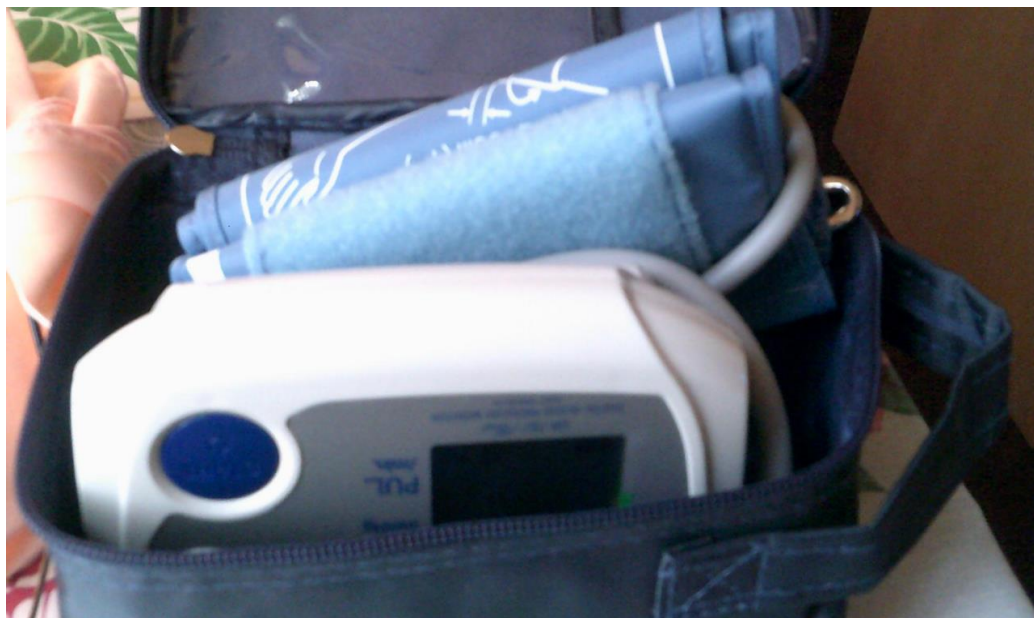
Figure 8. Photograph of and quote about involvement of family and friends

“Too much knowledge is dangerous. Because you get in the habit of being too healthy. And checking your fever, and checking your blood sugar, and your temperature every single day, your blood pressure every single day. And just going through all that give-and-take of taking care of yourself, not taking care of yourself. So, I gave it to my wife and let her be in charge. So, if she says, ‘OK, it’s time to take it now,’ OK, I’ll take it now. So, then she’ll look at me like, ‘I know what you’re thinking. Nope, can’t [eat that].’”