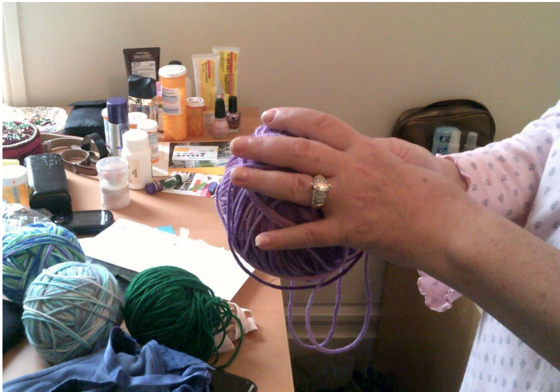
Figure 10. Photograph of and quote about being present with patient