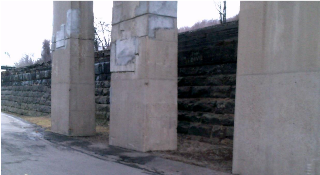
Figure 9. Photograph of and quote about quality care

“Good quality health care to me is having something that you really can depend on, as far as going to your doctors... You want to go to someone who is going to be able to help you and satisfy the needs that you have with your health care. Someone that you can depend on when you are having problems, where if they can’t help you they’ll try to get some way or somehow, someone who can help you. [This] picture, it’s a bridge and these are the pillars that are holding up the bridge as it’s standing as something strong, something sturdy that will hold up. As so, such as a doctor will stand sturdy and strong and hold up to you, tell you the truth if you want to hear it or not.”