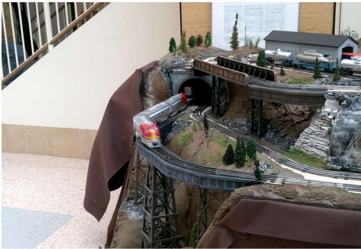
Figure 4. Photograph of and quote about coordination and integration of care

“Health care is like the engine, but you also need the bridge and [to] keep that kind of balance to where that bridge is stable and that engine is able to pass... I feel it’s important to be a part of my health care because it makes it easier... When you go to different providers, you have different opinions about things. It’s nice to have a primary care provider... They can either stop them or they can call the doctor that’s associated with [the medication] and get it tweaked or stopped. In Mississippi, I had a bad experience with it because the psychologist wanted a medication, but they had a nurse practitioner prescribe the medications. When I had an allergic reaction to one of the medications, the nurse practitioner in their wisdom stopped it... The psychologist in their wisdom wanted me to be taking something, they really couldn’t see me not taking anything, but what they kept recommending to him was something I couldn’t take.”