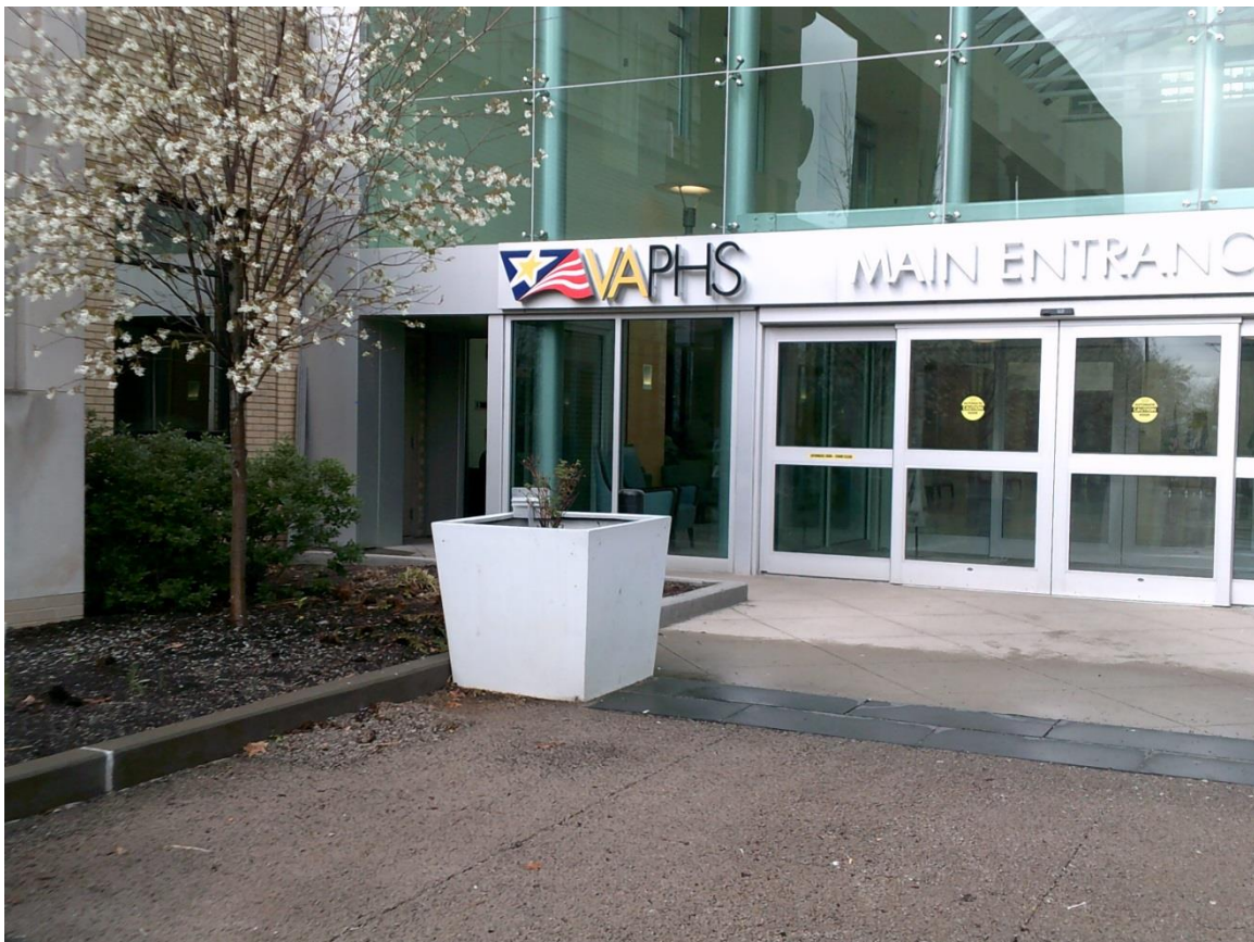
Figure 6. Photograph of and quote about transition and continuity

"I utilize [VA] programs. I was in the CTAD. I was in the domiciliary program, not only here but the one in Aspinwall. I was in the VA in Coatesville and I was in VA in Lebanon... I've been out here in Western Pennsylvania since '09, I came out here in '09 after completing a 6-month program in Lebanon, PA. After in 2000 going through Coatesville I would get out and disregard my health things like that. I kept refocusing on some help I was getting and, it makes you think. And you start [thinking], 'Why it would be nice to take full the plunge and decide to get healthy, mentally, physically, spiritually, socially, and also financial?' All the benefits that the VA has and, as a Veteran, utilizing my benefits. So, I been dealing with them, going through the VA system since about 2000."