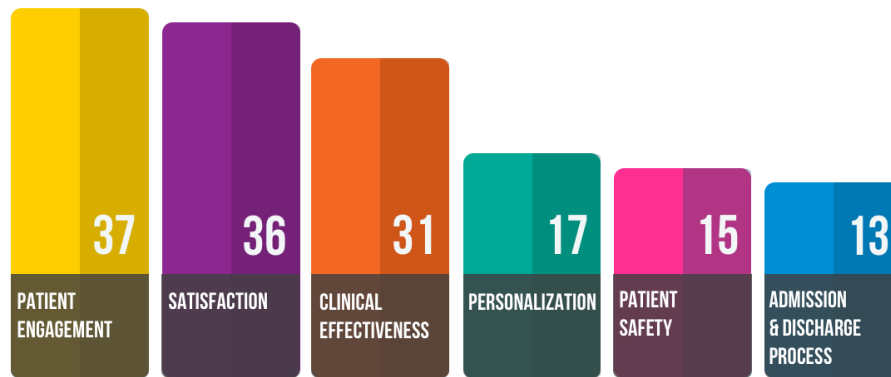
Figure 1. Hierarchy of variables based on the frequency of mention in the reviewed literature