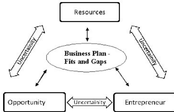
Figure 1: Three driving forces

Source: Based on Jeffrey Timmons' framework, as presented in Jeffrey A. Timmons, New Venture Creation (Homewood, IL: Richard D. Irwin, 1990)