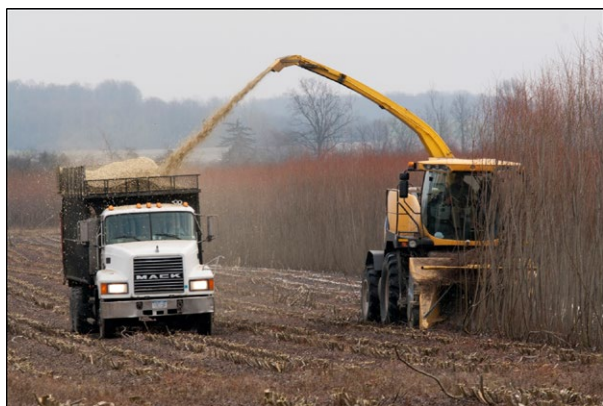
Figure 2. Harvesting willow biomass crops in New York State with a New Holland forage harvester and coppice header.

Harvests of approximately 60 ha of willow biomass crops during late 2012 and early 2013 in New York State, and 20 ha of poplar biomass in Western Oregon, revealed important patterns in the operation of the New Holland