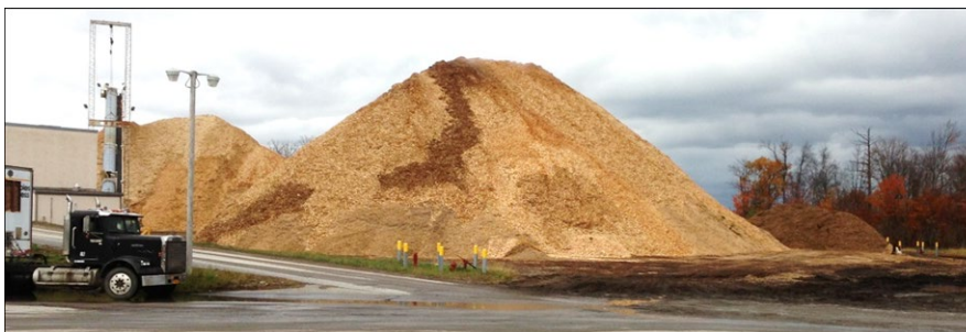
Figure 3. Piles of forest residues (left) and a smaller pile of willow biomass crops (right) at the Lyonsdale ReEnergy facility in 2013. After using over 1,000 Mg wet of material in 2013, plant operators were comfortable enough with willow biomass to add it directly to their main wood chip pile in 2014.

notably, the average ash content of the cultivar Fish Creek ( Salix purpurea ) (1.3%) was significantly lower than other cultivars tested, which had mean ash contents up to 2.4%. The moisture and energy content of willow from these large scale harvesting trials is similar to debarked forest wood chips, but ash content of debarked chips was lower (0.6%) (Chandrasekaran et al. 2012).