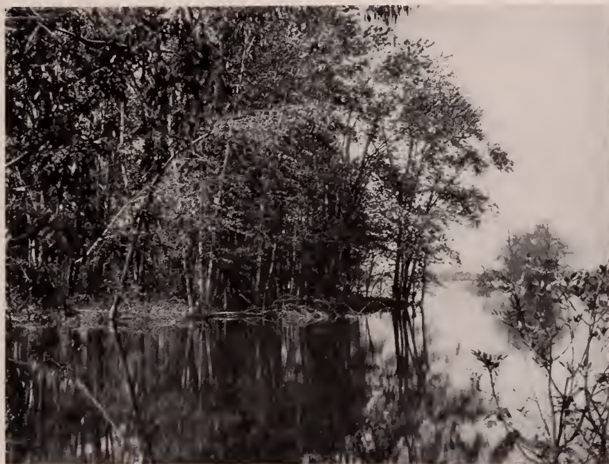
Fig. 128. Maple woods on low flat at mouth of Chittenango Creek. May 28, 1928.