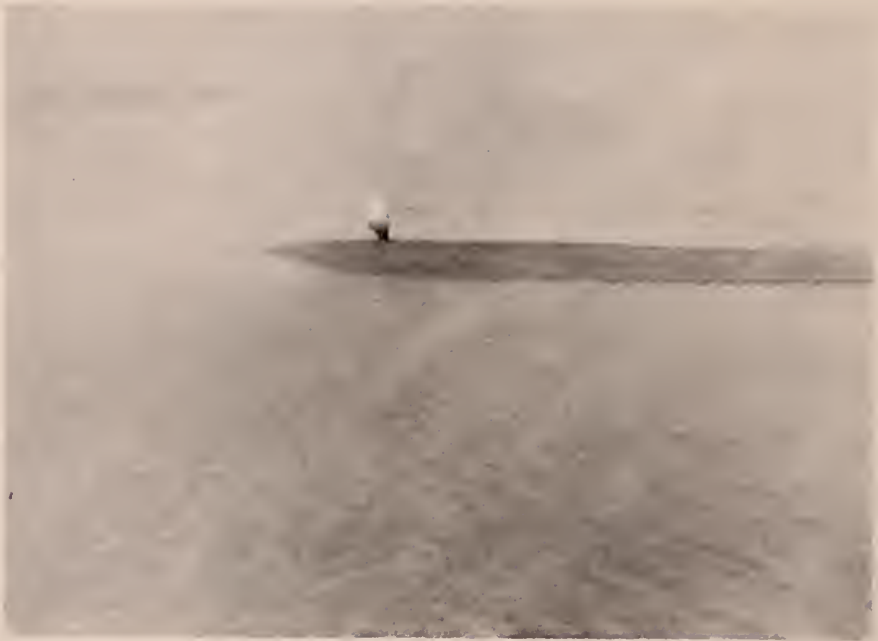
Fig. 189. Herring gull. Verona Beach. June 11, 1929.