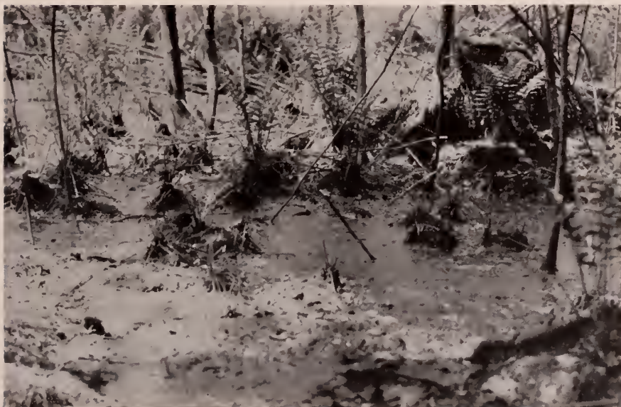
Fig. 140. Fern hummocks in shallow pool. McClanathan woods, three-fourths mile northeast of Sylvan Beach. July 11, 1929.