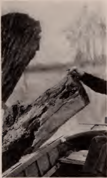
Fig. 204. Adult tree swallow and stump containing nest and eggs from which the incubating bird was taken. Chittenango Creek. May 28, 1928.