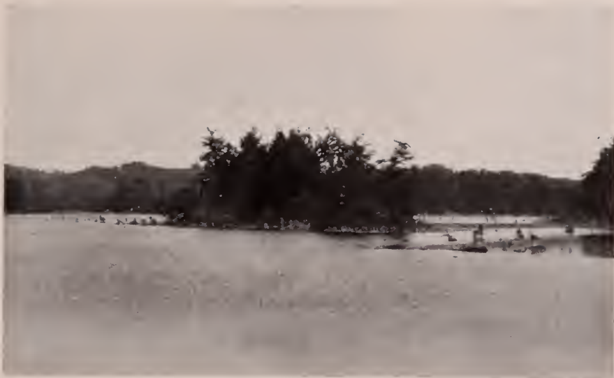
Fig. 155. Francis Pond about four miles northwest of Cleveland. A favorite resort of eastern bluebirds, tree swallows, eastern belted kingfishers and great blue herons. July 28, 1928.