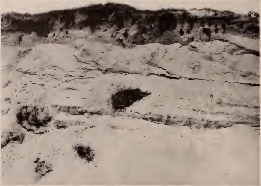
Fig. 209. Burrows of bank swallows in sand pit. Oak Orchard district. July 9, 1928.