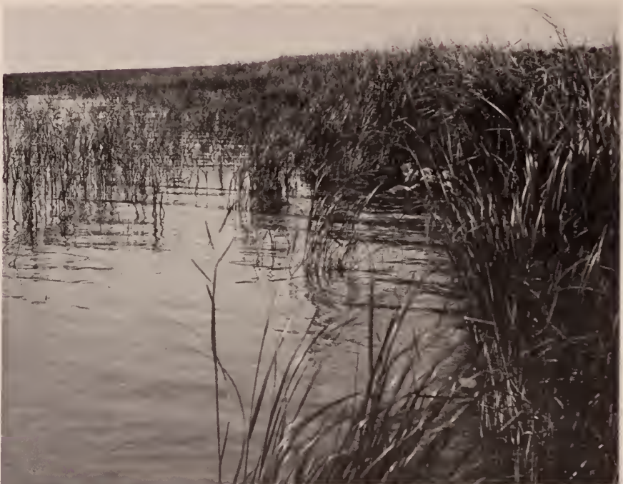
Fig. 178. View along north shore of Long Island. Sept. 9, 1915..