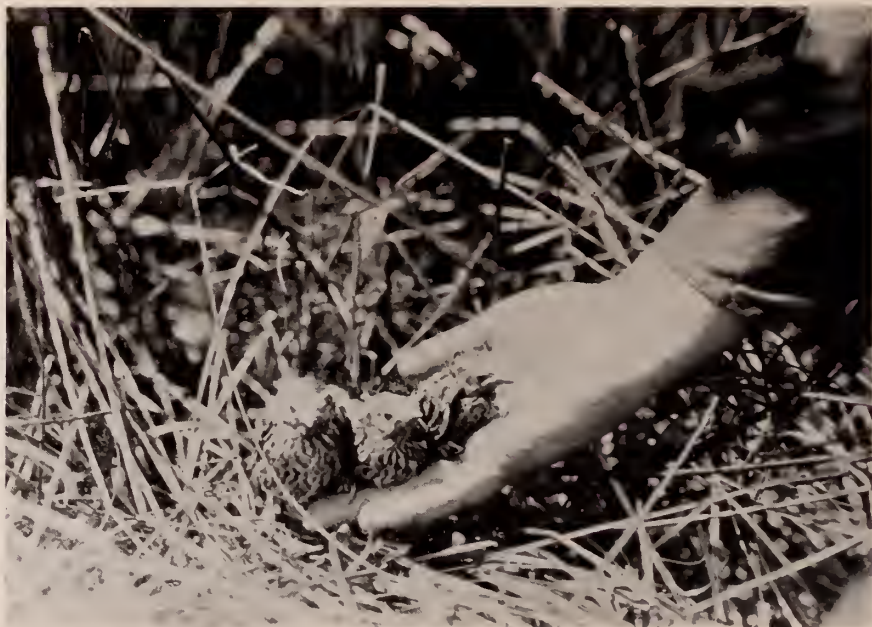
Fig. 230. Young eastern red-winged blackbirds from nest in grassy marsh one mile west of village of West Monroe. June 8, 1928.