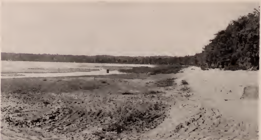
Fig. 134. Looking north along Oakland Beach. September 9, 1927.