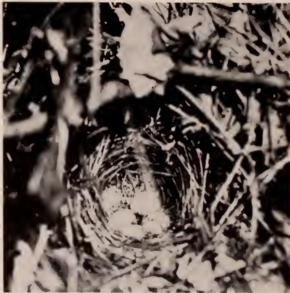
Fig. 232. Nest and five eggs of song sparrow in maple sapling. West Monroe district. May 15, 1929.