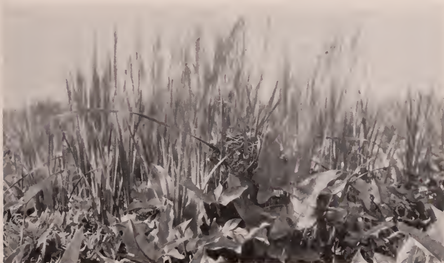
Fig. 221. Nest of long-billed marsh wren in narrow-leaved cat-tails and arrow arum. Cicero Swamp one and one-half miles southwest of Clay. June 18, 1929.