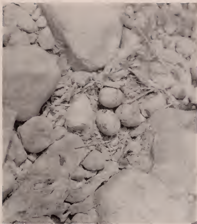
Fig. 193. Nest and eggs of common tern on Long Island. August 2, 1929.