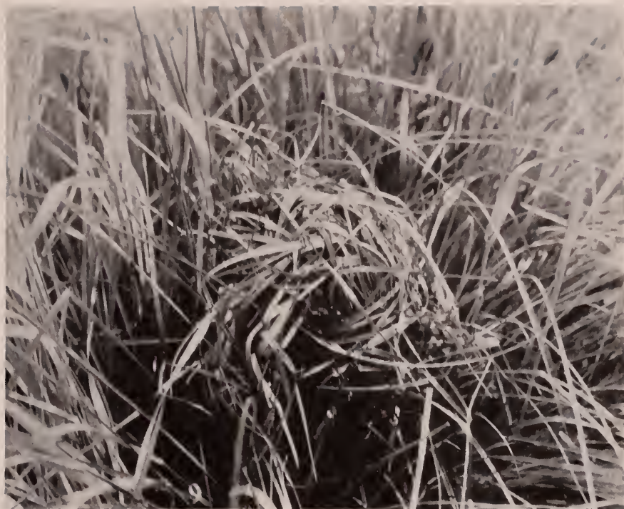
Fig. 220. Nest of short-billed marsh wren; long marsh grass at abandoned farmhouse two miles south of Lakeport. July 24, 1929.