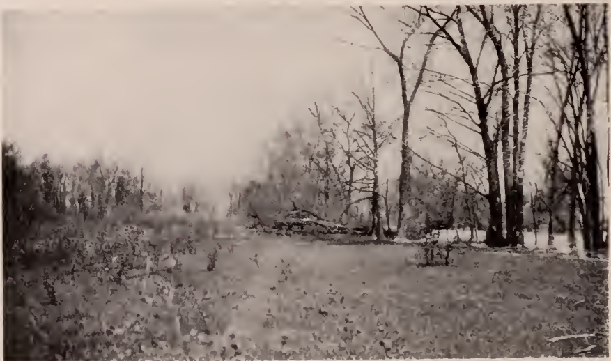
Fig. 130. Willow flats along south side of Chittenango Creek near its mouth. May 11, 1929.