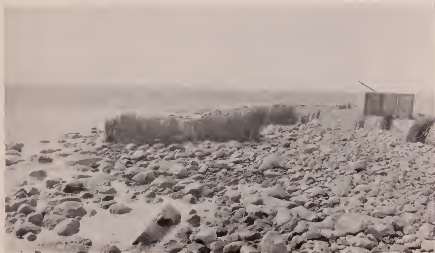
Fig. 172. Bowldery shore on west side of Wantry Island. July 24, 1928.