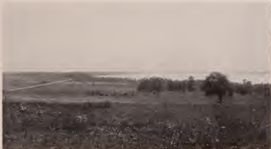
Fig. 144. Looking southeast over Oneida Lake from a point about one mile north of village of North Bay. September 9, 1929.