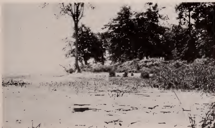
Fig. 176. South end of Frenchman Island. Water lilies, cat-tails and sedges. Feeding place of great blue heron and common black duck. July 24, 1928.