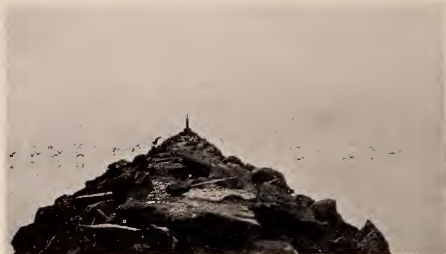
Fig. 191. Ring-billed and herring gulls in flight about breakwater at entrance to Barge Canal. Sylvan Beach. August 9, 1929.