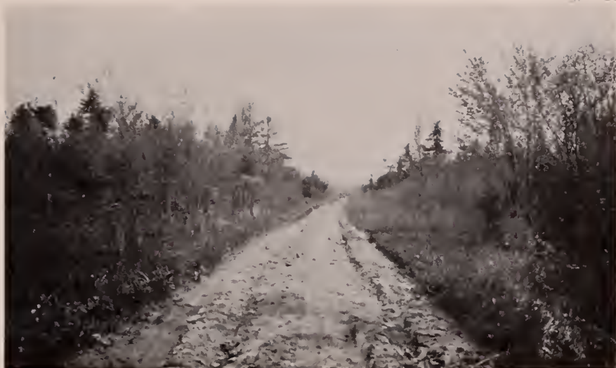
Fig. 119. Looking north on road through Cicero Swamp near Hall Island. May 26, 1928.