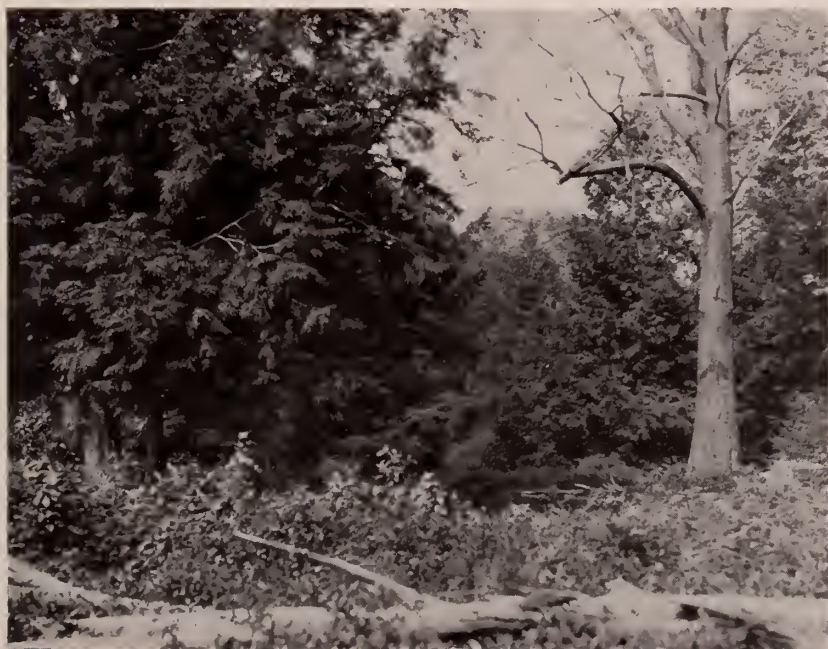
Fig. 148. Hemlock-maple woods about two miles north of Cleveland. Home of black-throated blue, black-throated green and magnolia warblers and oven-bird. June 13, 1928.