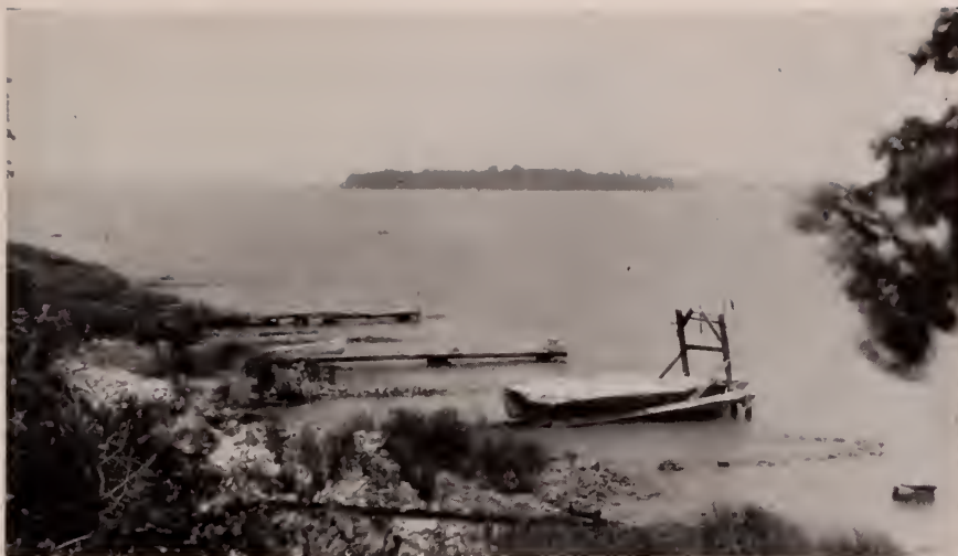
Fig. 175. Dunham Island from shore at Lower South Bay. July 12, 1929.