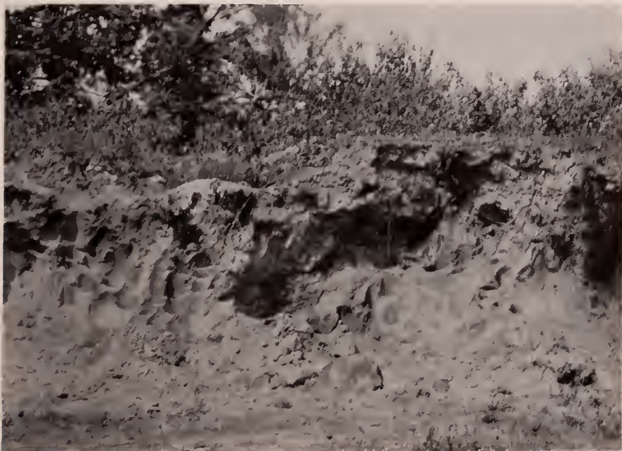
Fig. 194. Burrow of eastern belted kingfisher in sand pit one mile north of Jewell. June 8, 1929.