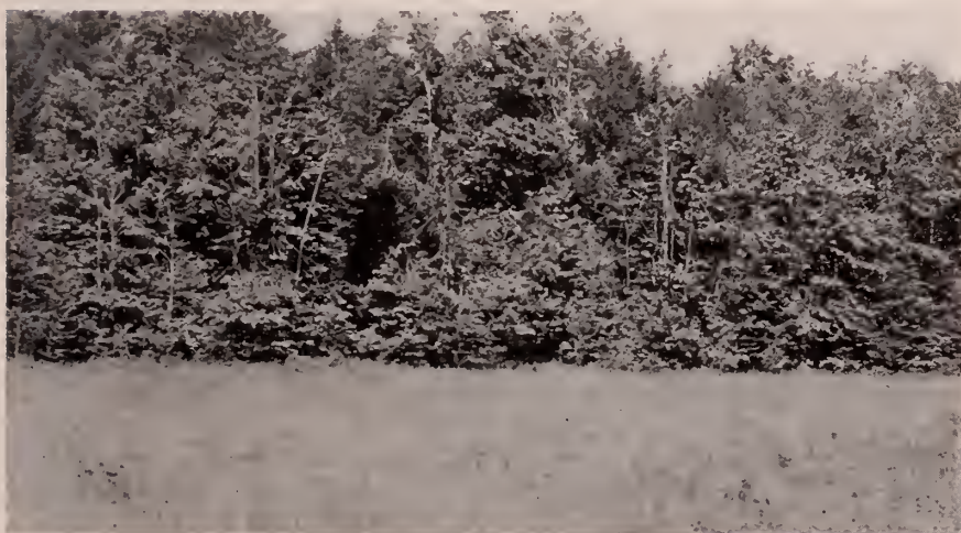
Fig. 160. Grassy field bordering mixed woods. Big Bay district. June 8, 1928.