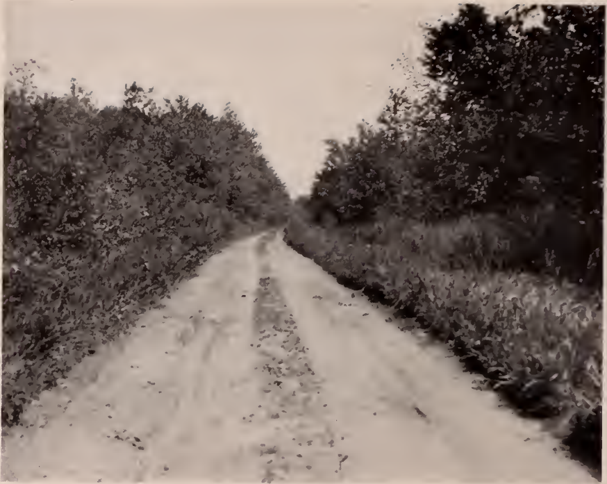
Fig. 161. Road through swamp, Big Bay district. June 8, 1928.