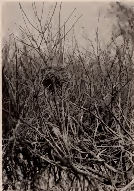
Fig. 228. Nest of eastern red-winged blackbird in willow swamp one mile south of village of Sylvan Beach. May 16, 1928.