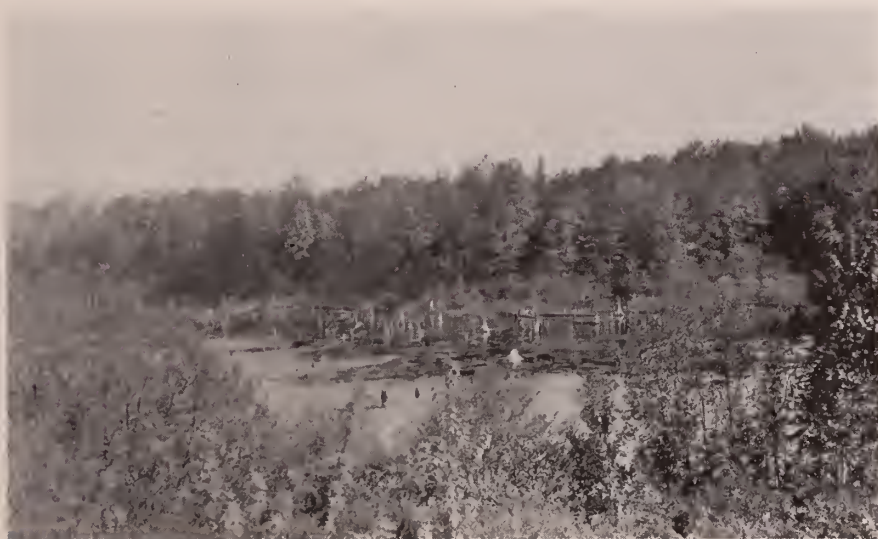
Fig. 214. Gordon Pond and hemlock woods surrounding it. May 31, 1929.