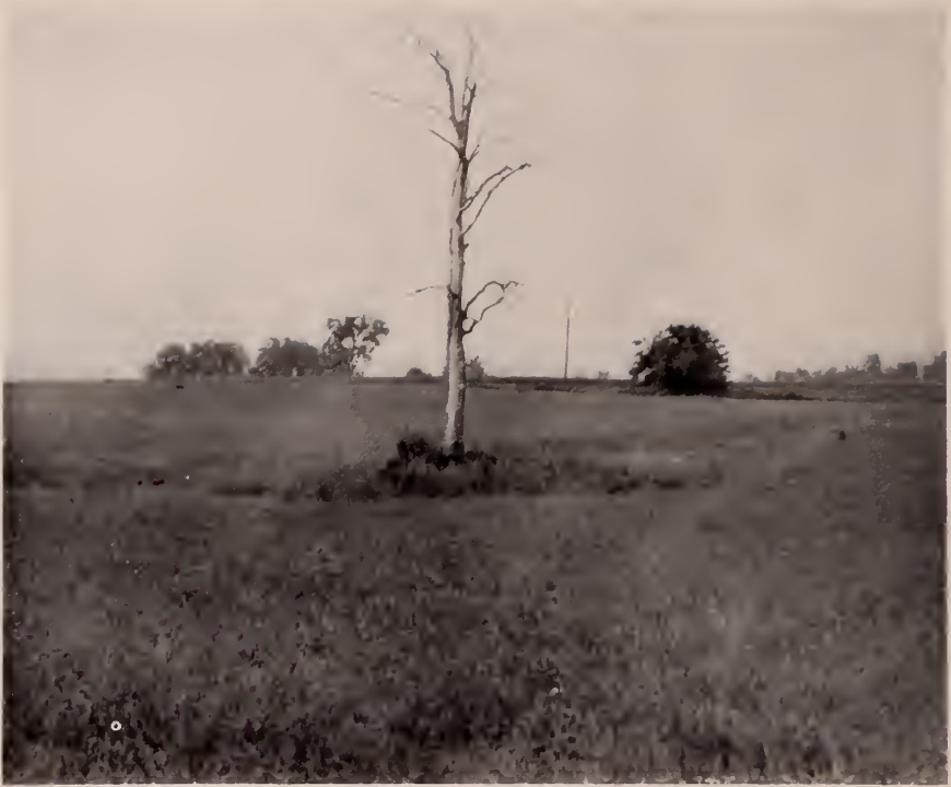
Fig. 181. Dead shag-bark hickory tree in open field one mile west of Bridgeport. Lookout perch for eastern sparrow hawk. July 24, 1929.