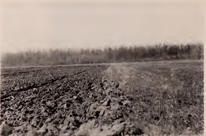
Fig. 122. Low open meadow and plowed field near Hall Island. Habitat of prairie horned lark, pipit and eastern Savannah sparrow. May 9, 1929.