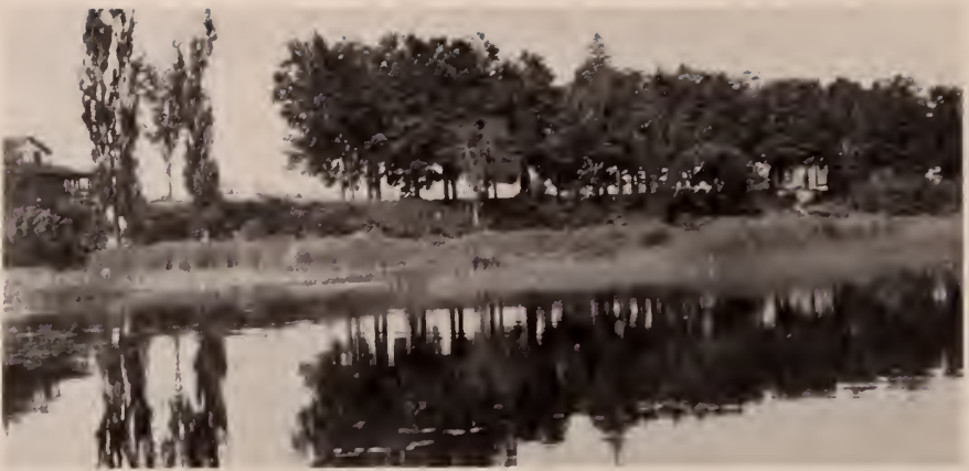
Fig. 177. Small cat-tail bordered bayou at trolley station, Lower South Bay. Feeding place of horned and pied-billed grebes. July 17, 1928.