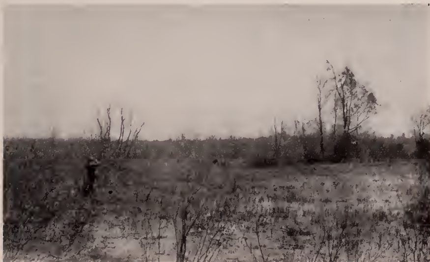
Fig. 227. Willow swamp in South Bay district. Habitat of eastern red-winged blackbird, American bittern and Wilson's snipe. May 16, 1928.