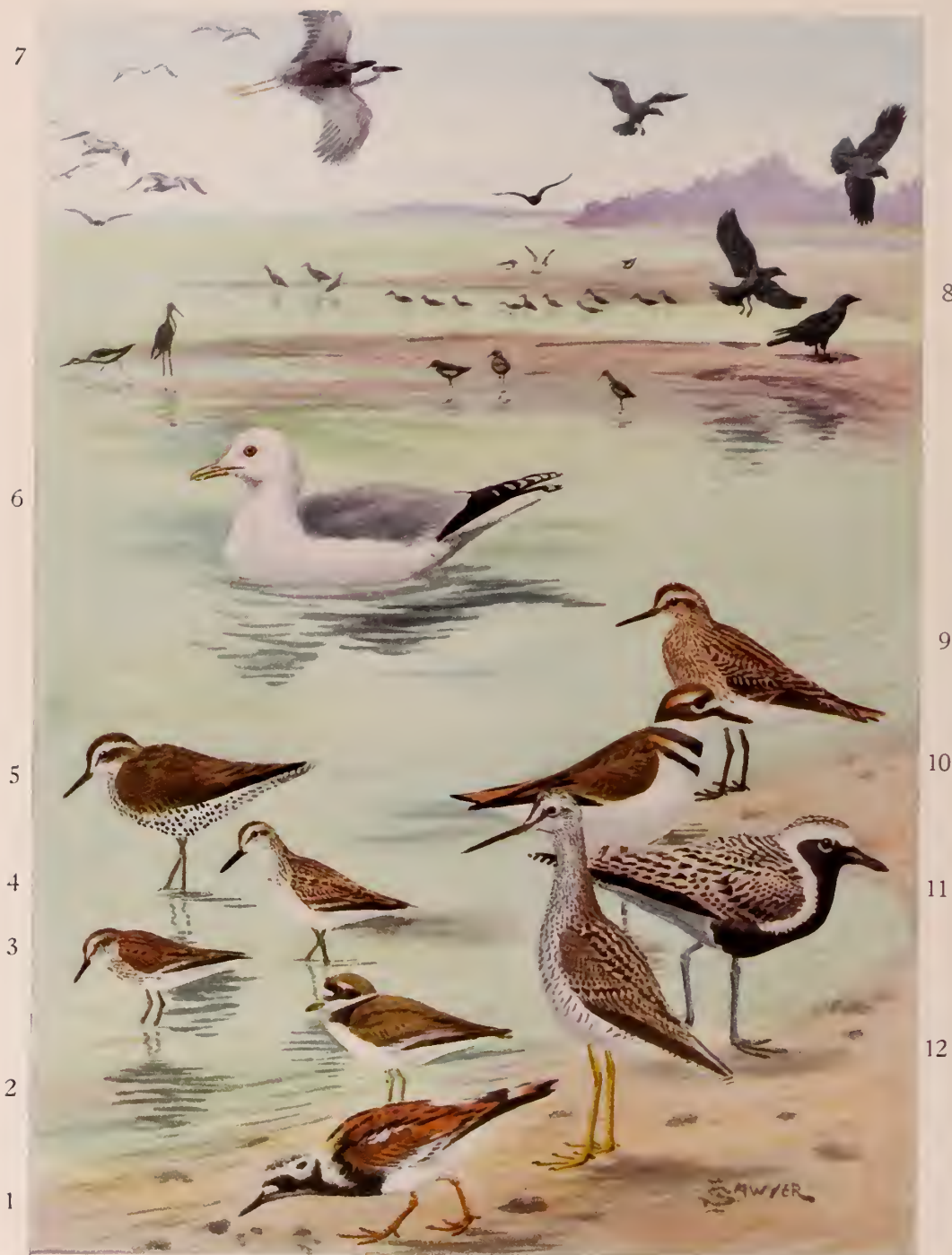
PLATE I. COMPOSITE GROUP OF SHORE AND OTHER BIRDS ON SAND BEACH AT EAST END OF ONEIDA LAKE