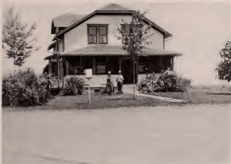
Fig. 117. Field quarters at Lower South Bay.