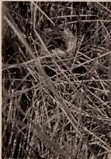
Fig. 229. Nest of eastern red-winged blackbird in grassy marsh about two miles west of village of West Monroe. Nest contains two eggs and two very small young. May 29, 1928.