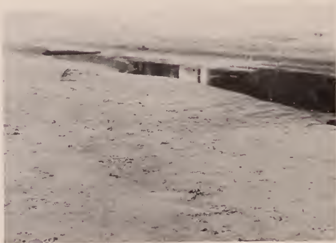
Fig. 186. Young pectoral sandpiper at Sylvan Beach. May 16, 1928.