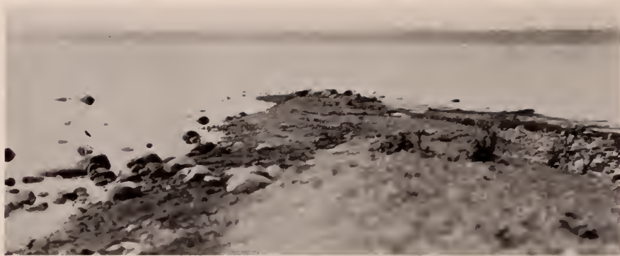
Fig. 173. Spotted and pectoral sandpipers at north end of Wantry Island. July 19, 1928.