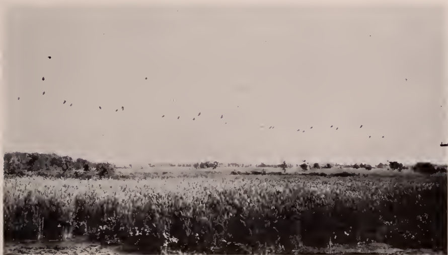
Fig. 206. Barn swallows on telephone wires, Cicero Swamp southwest of Clay. August 9, 1928.