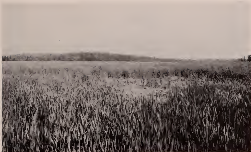
Fig. 167. Cat-tail marsh, pond and old muskrat house in Cicero Swamp one and one-half miles southwest of Clay. August 9, 1928.