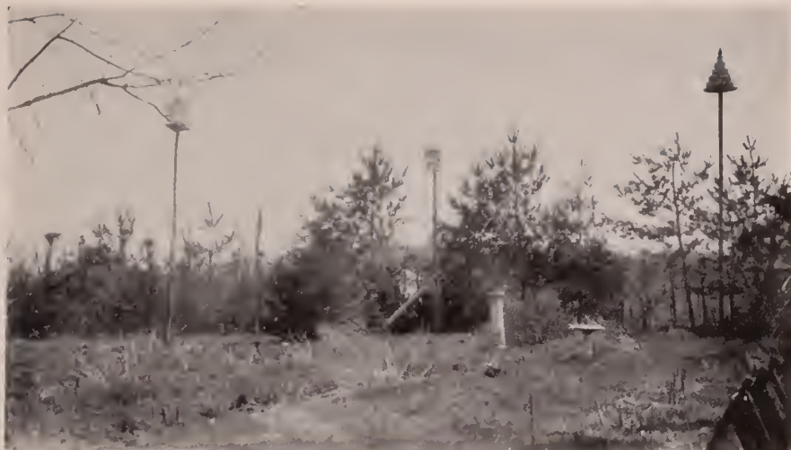
Fig. 201. Bird houses on lawn of summer home at Lower South Bay. May 2, 1928.