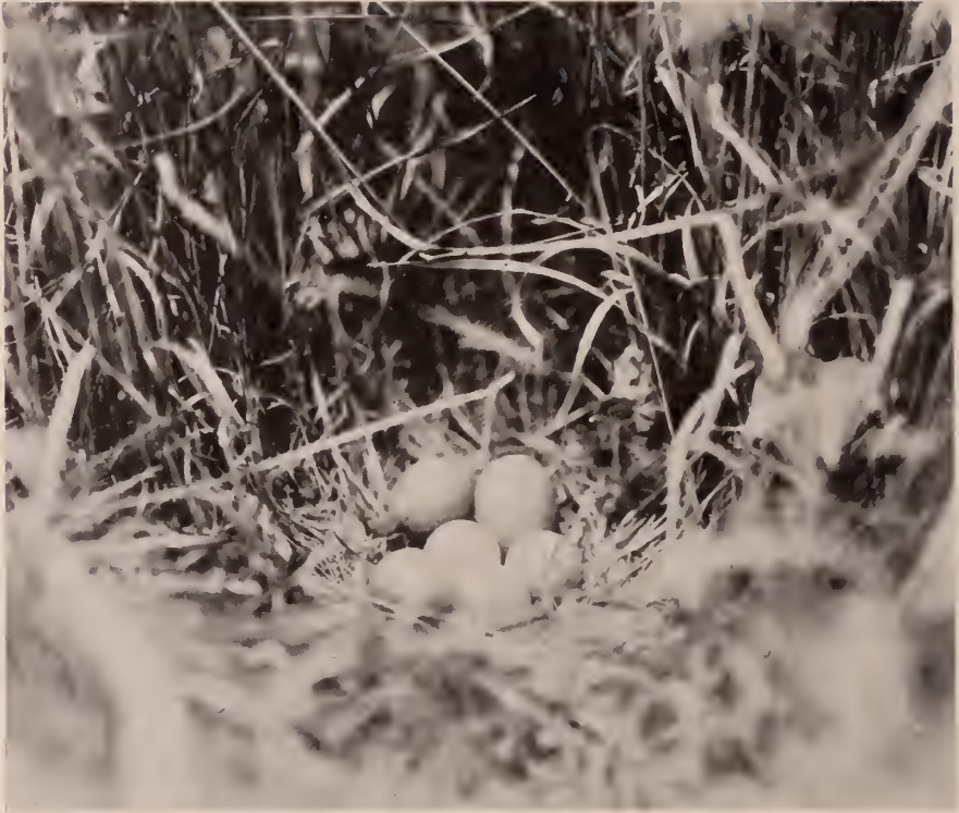
Fig. 185. Nest and eggs of ring-necked pheasant in hay field. Muskrat Bay district. July 18, 1928.