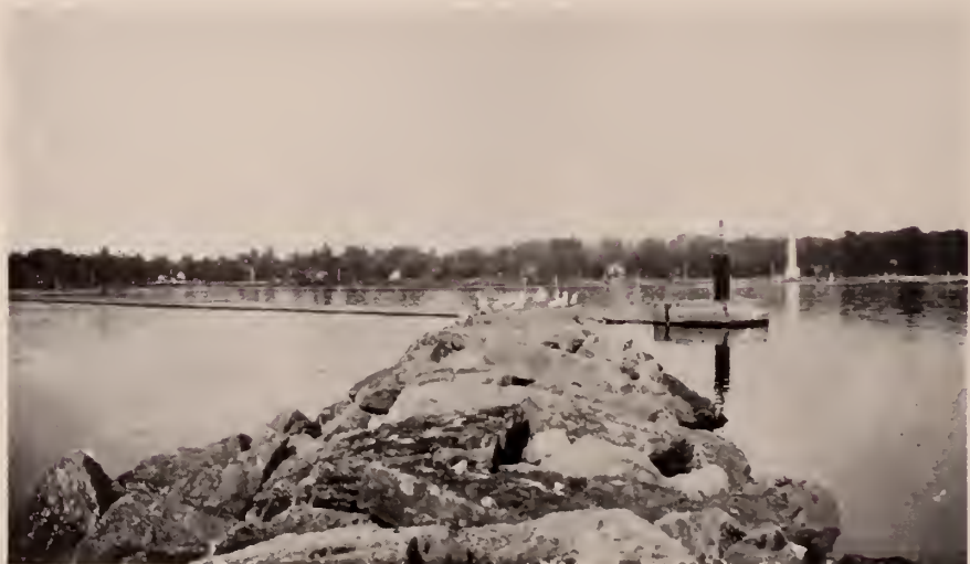
Fig. 190. Ring-billed and herring gulls on stone breakwater at Sylvan Beach. August 9, 1929.