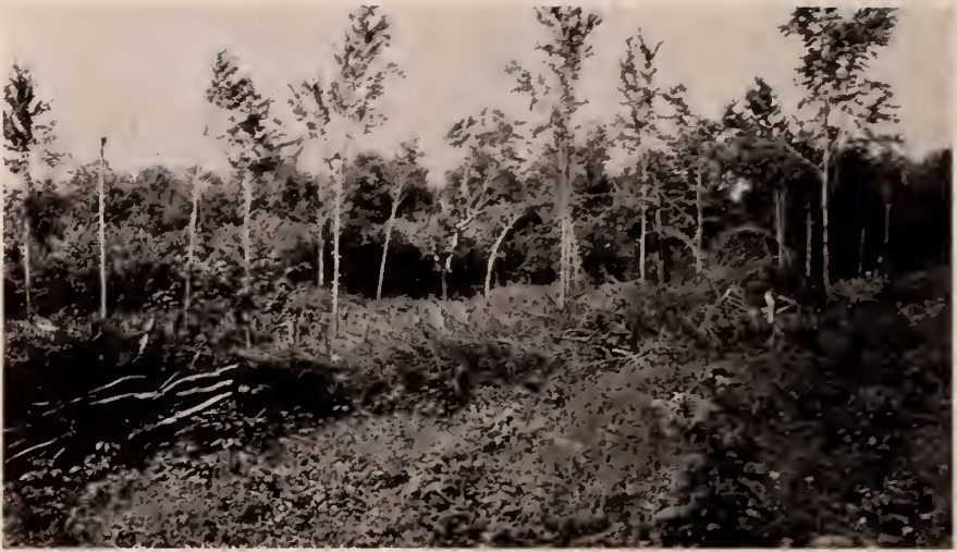
Fig. 149. Brush piles in clearing at edge of Vandercamp woods two miles north-west of Cleveland. Habitat of indigo bunting, red-eyed vireo, towhee and eastern field sparrow; also black-billed cuckoo in maple and aspen seedlings in background. June 25, 1928.