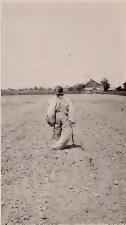
Fig. 218. Scarecrow at edge of corn field, Maple Bay district. June 2, 1928.