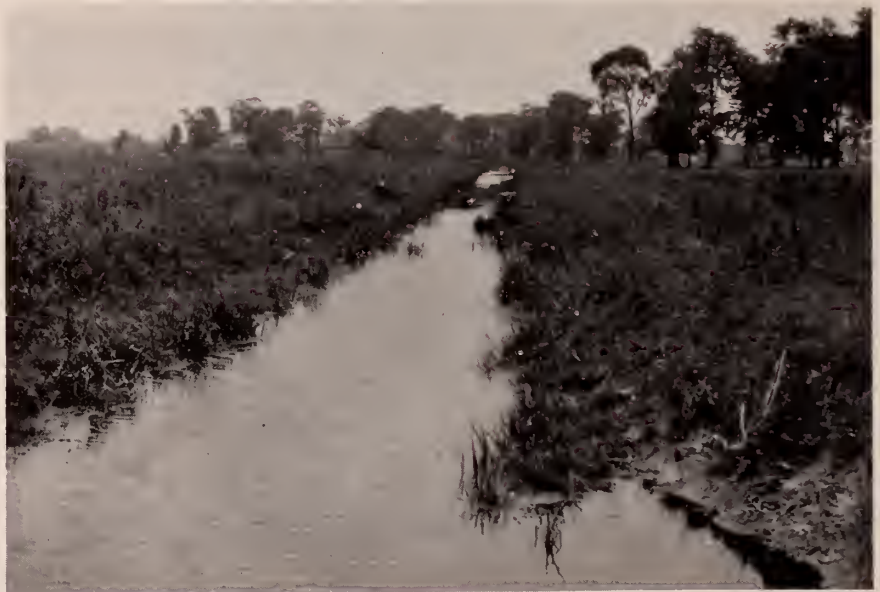
Fig. 126. Mud Creek near village of Cicero. Habitat of American bittern and eastern red-winged blackbird. June 25, 1927.