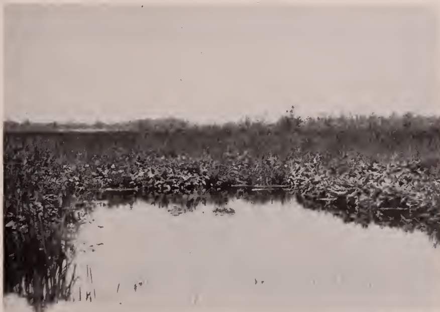
Fig. 168. Mud Creek in Cicero Swamp one and one-half miles southwest of Clay. July 6, 1928.