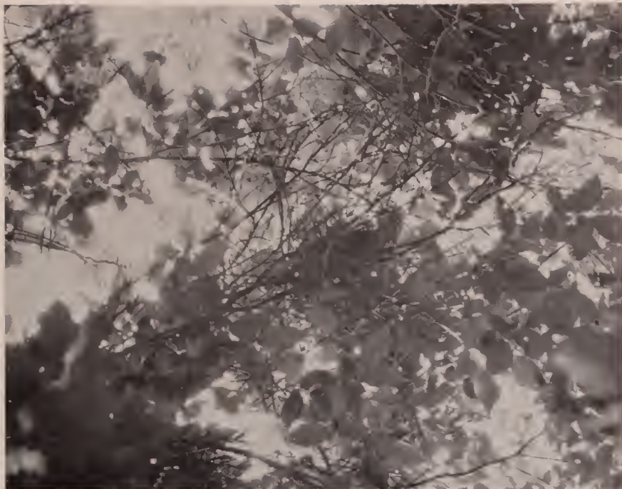
Fig. 179. Nest of eastern green heron; contains five young. Emmons' woods. June 17, 1929.