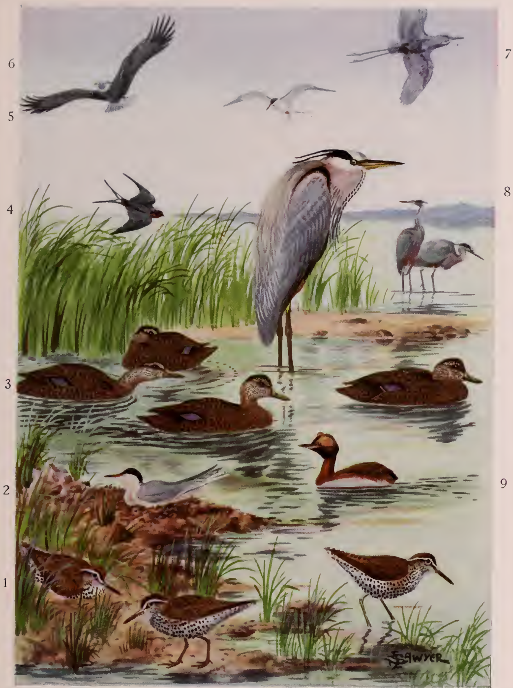
PLATE 2. COMPOSITE GROUP OF SHORE AND OTHER BIRDS ON WANTRAY ISLAND