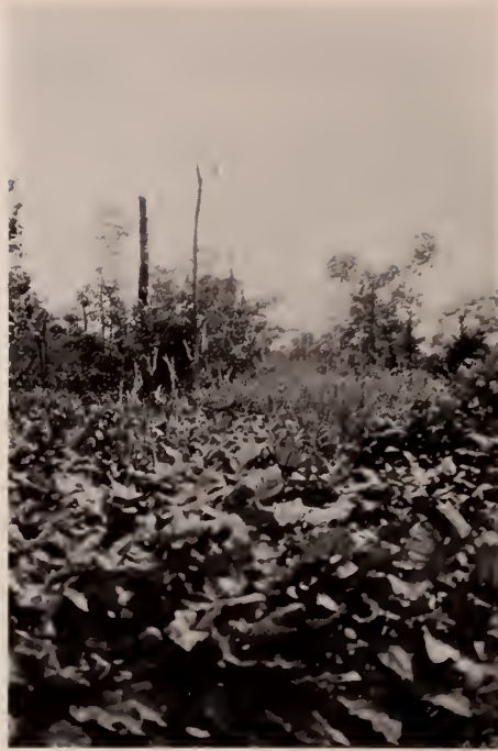
Fig. 165. Cicero Swamp one and one-half miles southwest of Clay. Eastern green heron perched in tree. August 7, 1928.