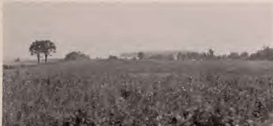
Fig. 132. Reverted grassy field, Delmarter Bay district. Habitat of bobolink and eastern Savannah sparrow. July 12, 1929.