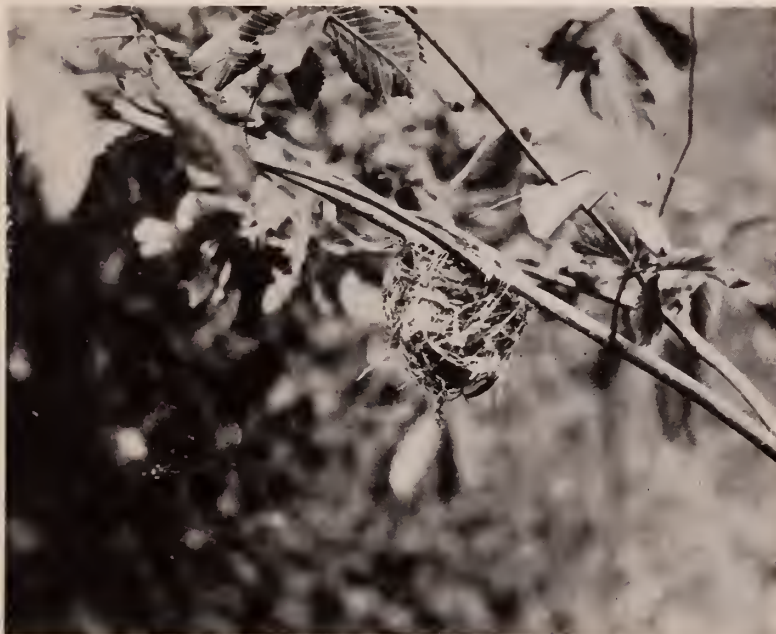
Fig. 225. Nest of redstart in ironwood sapling. Ladd woods, Muskrat Bay district. July 18, 1928.