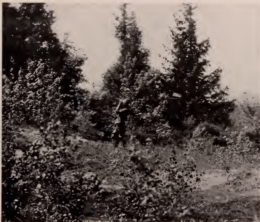
Fig. 147. In the field; cut-over tract one mile north of Jewell. June 8, 1929.