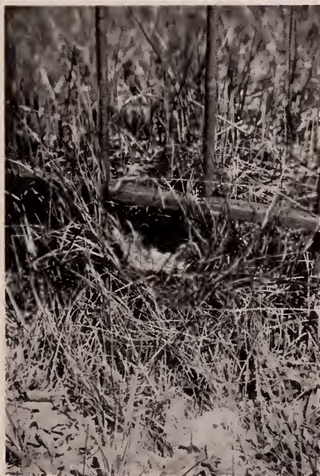
Fig. 234. Nest and eggs of eastern chipping sparrow. Nest on ground under iron fence surrounding West Monroe Cemetery. May 22, 1928.