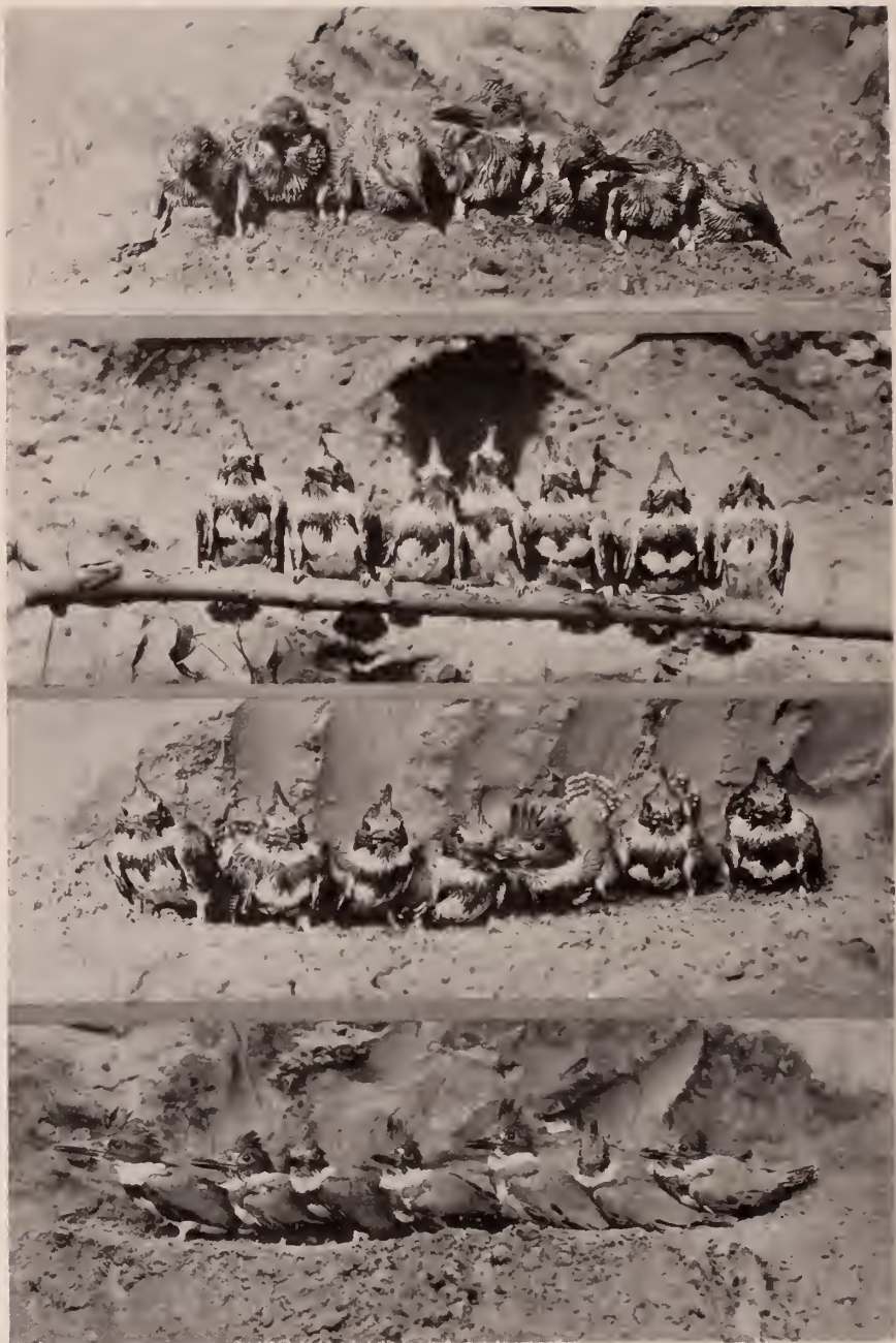
Fig. 195. A family of young eastern belted kingfishers. Upper row photographed on June 16, 1928 when about three weeks old. The birds have been banded. The middle rows show different poses of the same family on June 23. The lower shows the family as photographed on June 27.