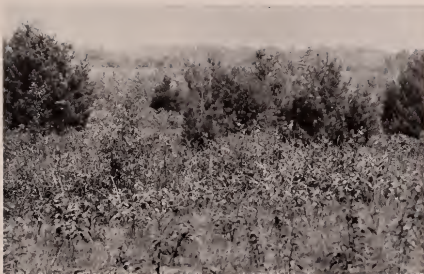
Fig. 159. Bushy tangles and second growth pines on old cleared area bordering wooded tract about two miles north of Cleveland. Habitat of eastern field sparrow and indigo bunting. June 13, 1928.