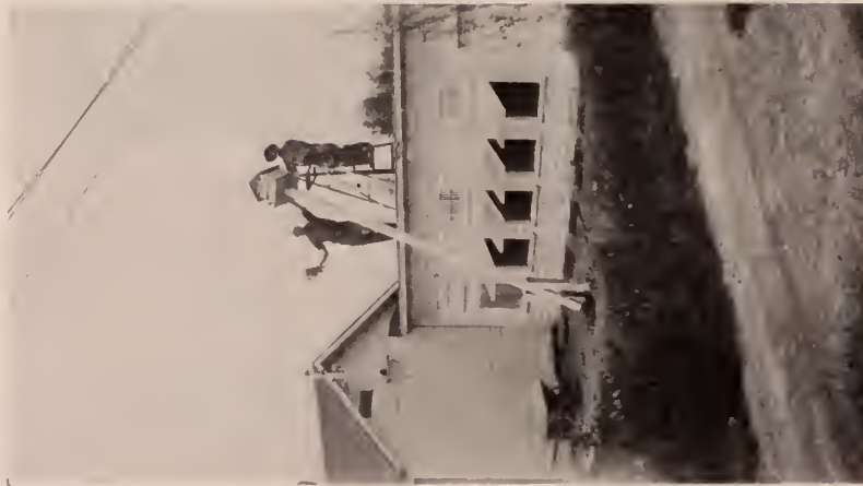
Fig. 199. Removing nests of English sparrows from martin house. Note the method of hanging the supporting pole to a bolt. Another long bolt through the pole holds it in an upright position. May 27, 1928.