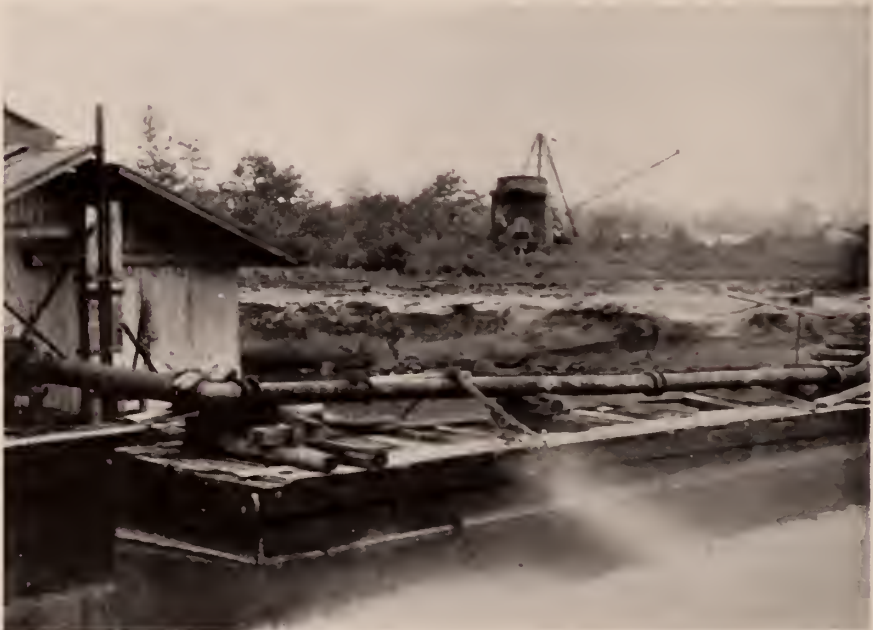
Fig. 210. Burrows of bank swallows at Delahunt sand pit near Cleveland showing proximity of burrows to a more or less constantly used sand pump. July 23, 1928.