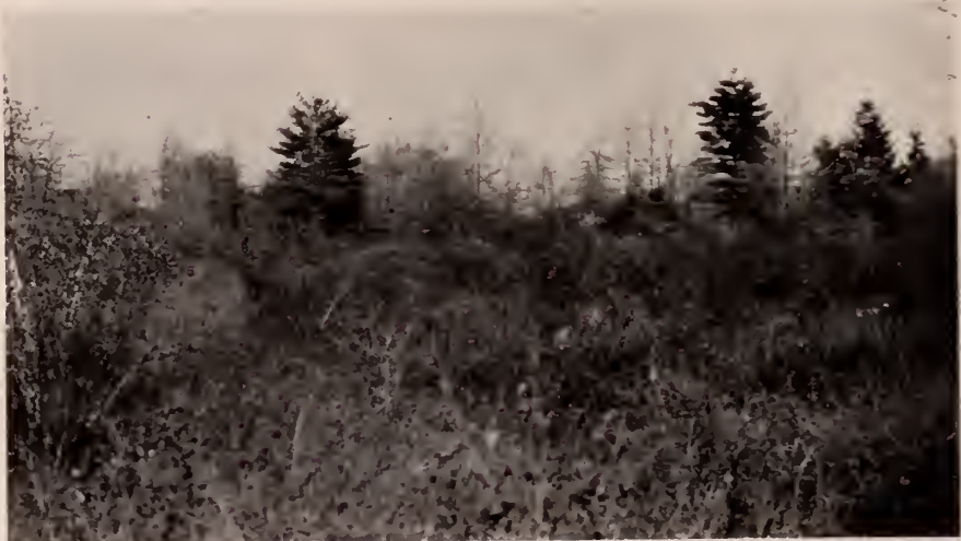
Fig. 150. Blueberry thicket and second growth trees one mile west of village of North Bay. Towhee habitat. May 16, 1928.