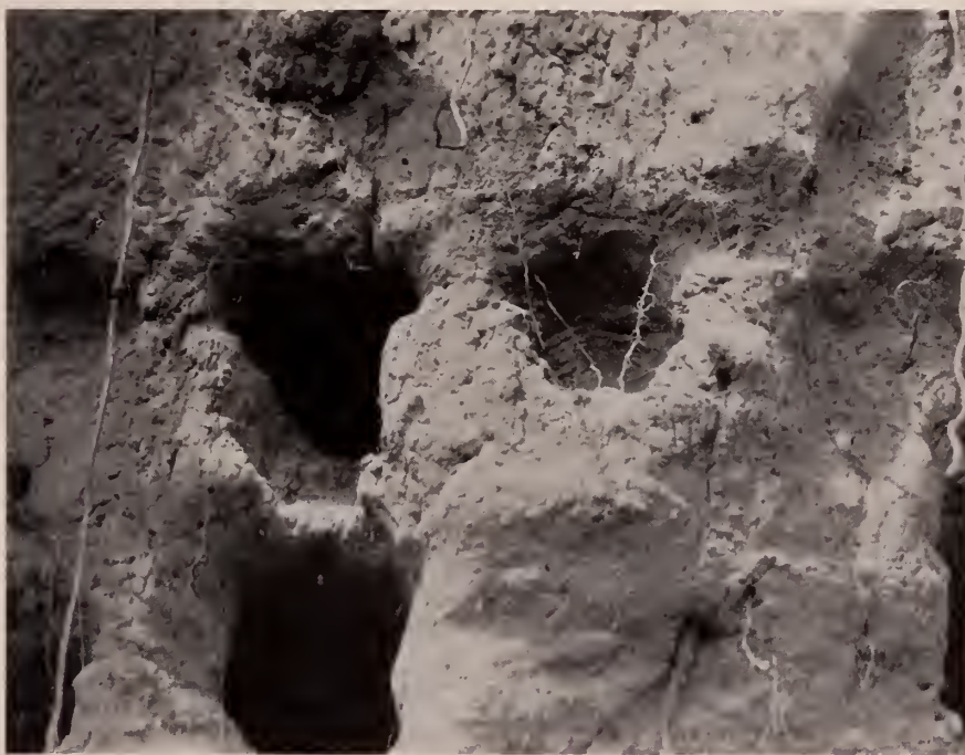
Fig. 212. Burrows of bank swallows in sandy bank of Fish Creek. Note claw marks at opening of completed burrow and in the incomplete one. July 12, 1928.