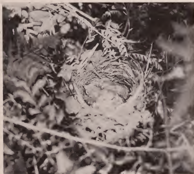
Fig. 223. Nest and young of veery. Young about ready to leave nest. Blueberry and fern undergrowth in woods illustrated in Fig. 222. July 22, 1929.