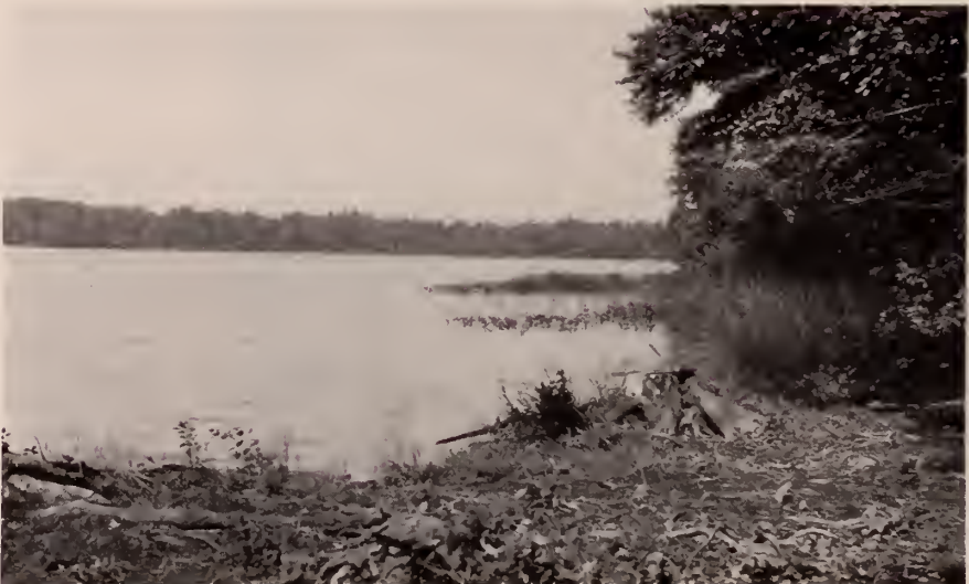
Fig. 154. Panther Lake looking west along north shore. July 30, 1928.