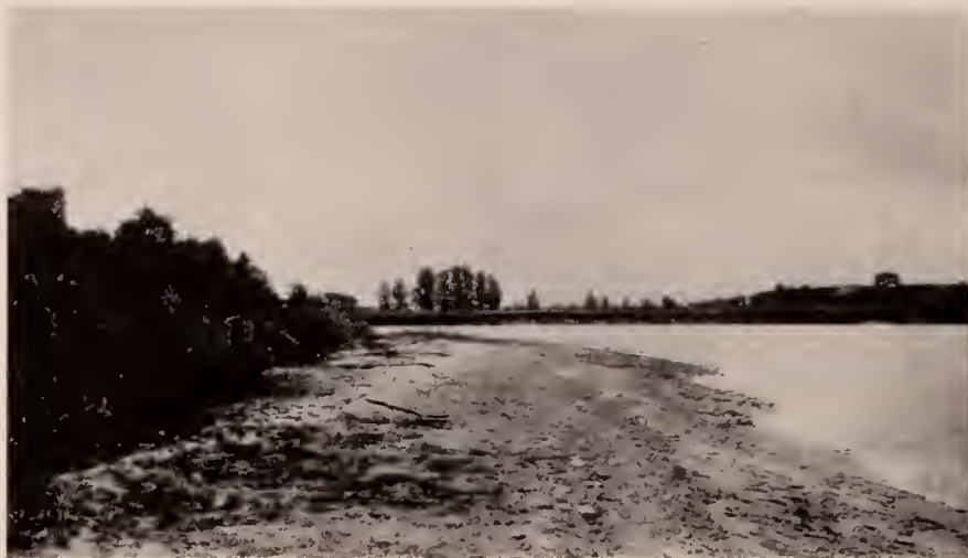
Fig. 145. Sand beach along Fish Creek near village of Fish Creek Landing. Habitat of killdeer and spotted sandpiper. July 12, 1928.