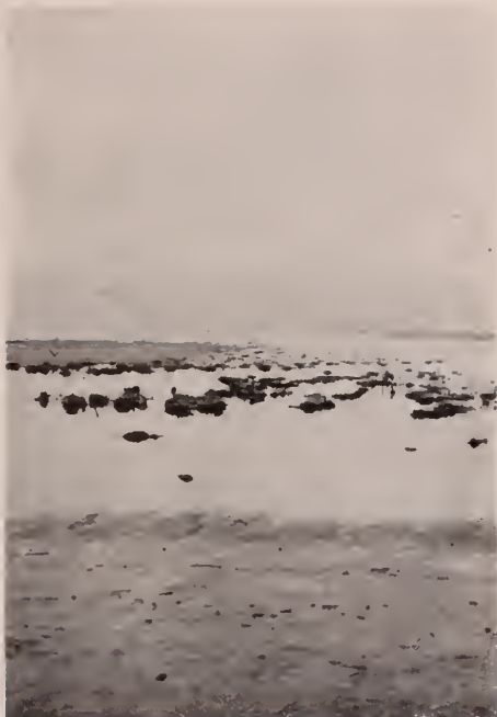
Fig. 187. Greater yellow-legs at Sylvan Beach. May 16, 1928.