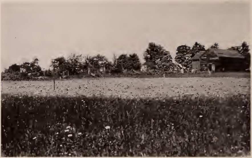
Fig. 217. Large cloths suspended on wires stretched above and around this corn field have been employed as a frightening device to keep away eastern crows. North Bay district. June 16, 1928.