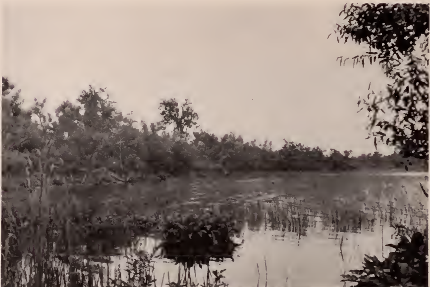
Fig. 162. West side of Big Bay looking north. July 13, 1928, (Photograph by W. A. Dence).