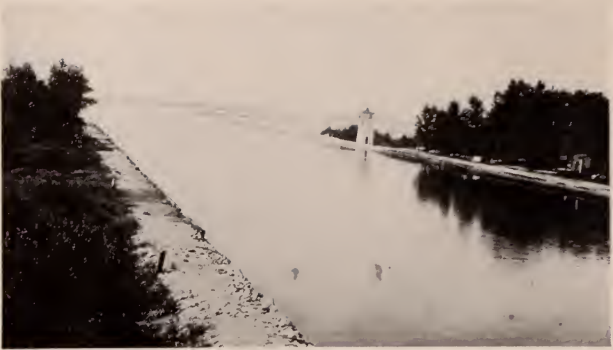
Fig. 141. Barge Canal and breakwater at Sylvan Beach. A favorite gathering place for gulls, terns and shore birds. August 13, 1928.