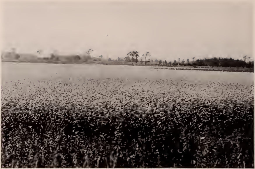
Fig. 121. Buckwheat field near village of Cicero. The seeds are a favorite food of English sparrows, eastern goldfinches and other granivorous birds. August 15, 1928.