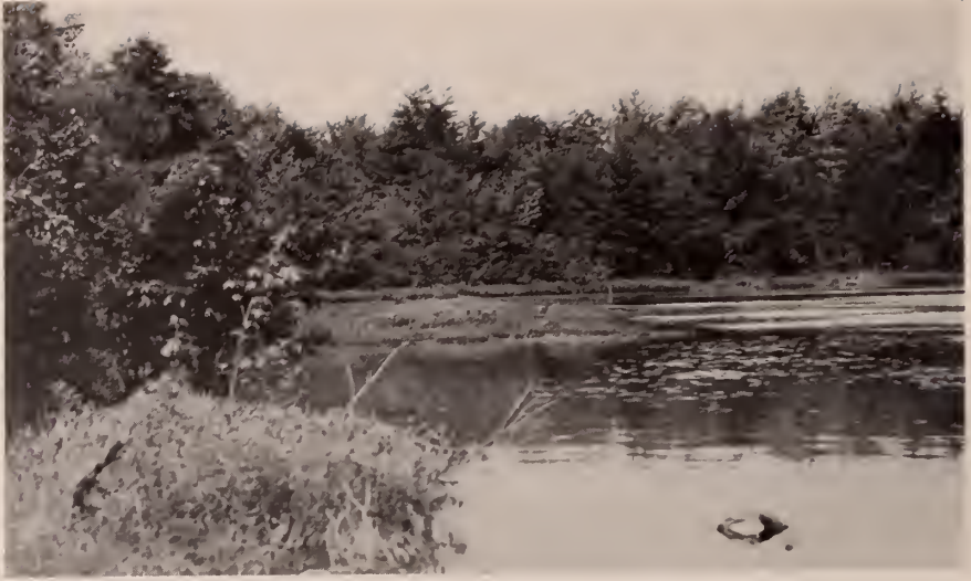
Fig. 157. West end of Kibby Lake. Hemlocks and maples in background. Pond lilies and some duckweed on water. June 15, 1928.