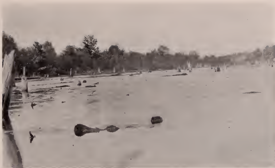
Fig. 213. Gordon Pond showing decaying stumps in which eastern bluebirds and tree swallows nest. May 31, 1929.