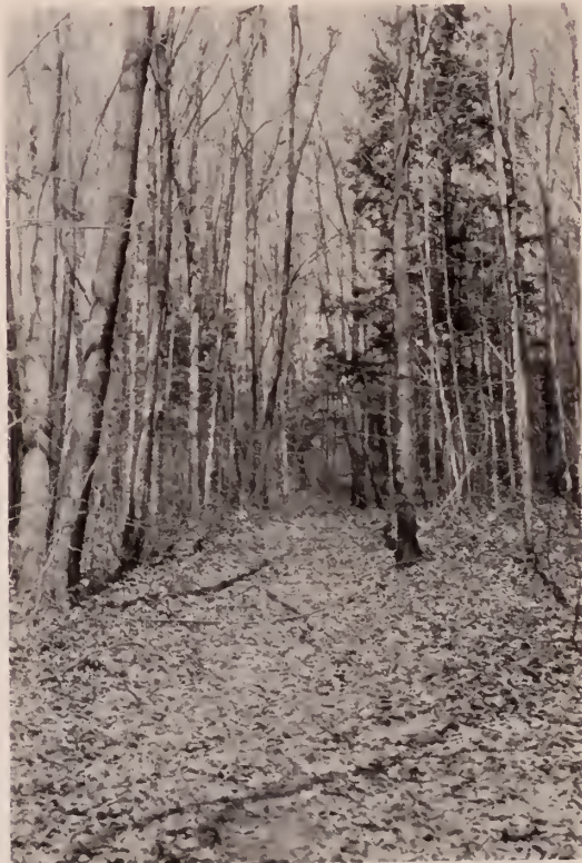
Fig. 158. Maples, birches and a few beeches. Sauer's woods south of West Monroe cemetery. May 8, 1928.