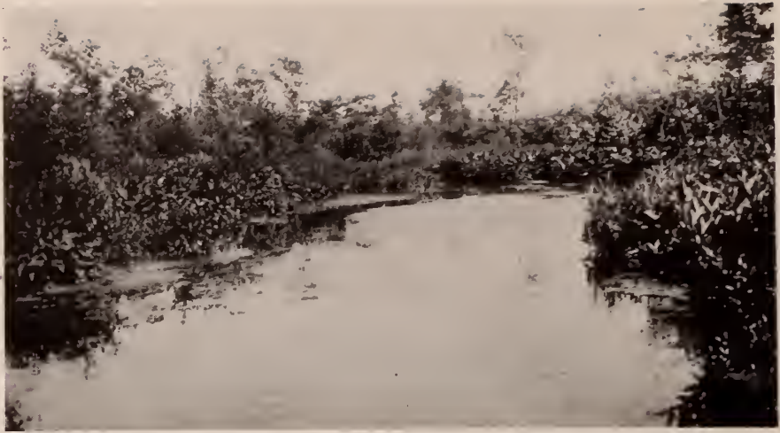
Fig. 169. Mud Creek in Cicero Swamp one and one-half miles southwest of Clay. Habitat of Florida gallinule, eastern least bittern, long-billed marsh wren and swamp sparrow. July 6, 1928.