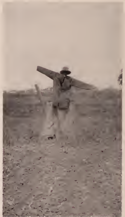
Fig. 219. Scarecrow in corn field near Hitchcock point. June 22, 1929.