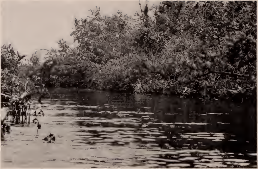
Fig. 125. A short inlet stream at Maple Bay. Habitat of common black duck and eastern green heron. June 28, 1928.