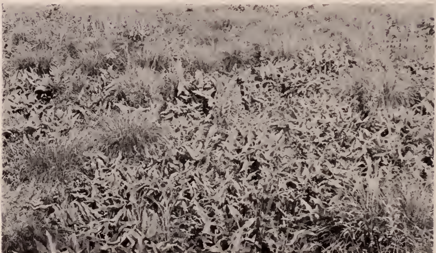
Fig. 166. Arrow arum, marsh grass and ferns in Cicero Swamp one and one-half miles southwest of Clay. Habitat of Virginia rail and Florida gallinule. June 18, 1929.