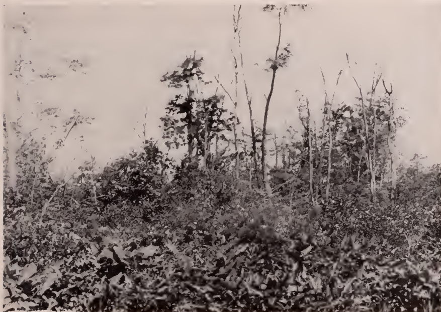
Fig. 164. Big Bay swamp. Habitat of eastern red-winged blackbirds, bronzed grackles, tree swallows, eastern green herons and great blue herons. July 26, 1929.