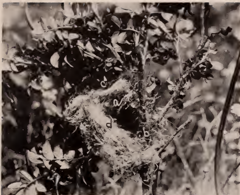
Fig. 224. Nest of eastern yellow warbler with two floors constructed by the bird in an attempt to avoid incubating a cowbird egg laid in floor of original nest. Nest in rose bush at residence in Lower South Bay district. Side cut away to show interior. June 4, 1928. a , floor of new nest; b , floor of original nest on which were deposited a cowbird's egg and two yellow warbler eggs; c , opening of new nest; d , side of original nest, cut away to expose exterior.