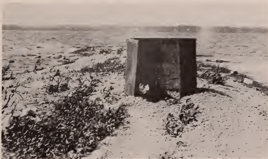
Fig. 171. Blind erected for observation of shore birds on Wantry Island. July 24, 1928.