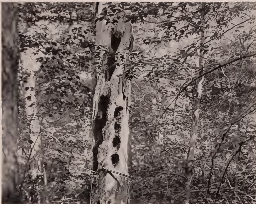
Fig. 196. Workings of northern pileated woodpecker in Adirondack forest.