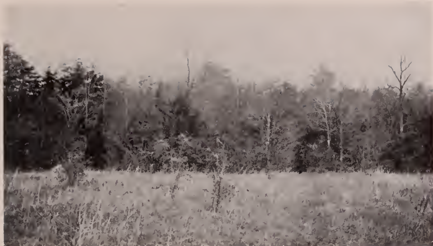
Fig. 151. Emmons' woods from west side. West side Big Bay. Maples and hemlocks. Habitat of cerulean, magnolia, black-poll, redstart and other warblers and of scarlet tanager and olive-backed thrush. May 21, 1928.