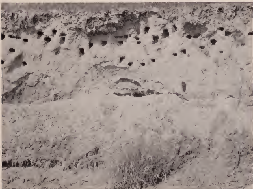
Fig. 208. Near view of bank swallow burrows in sandy bank of Fish Creek opposite village of Fish Creek Landing. July 12, 1928.