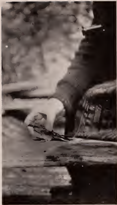
Fig. 205. Adult banded tree swallow. May 28, 1928.