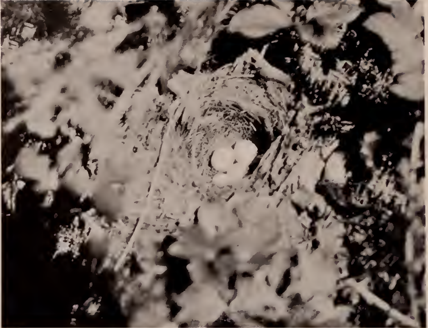
Fig. 231. Nest and four eggs of eastern hermit thrush. Widrig woods. June 20, 1929.