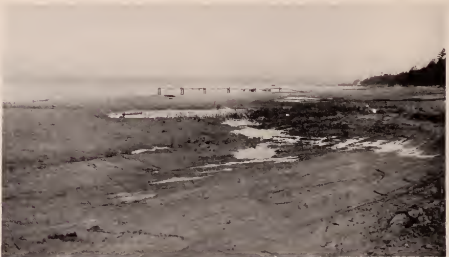
Fig. 138. Shallow pools at Verona Beach. Feeding grounds of least and semipalmated sandpipers, semipalmated plovers and other shore birds. August 13, 1928.