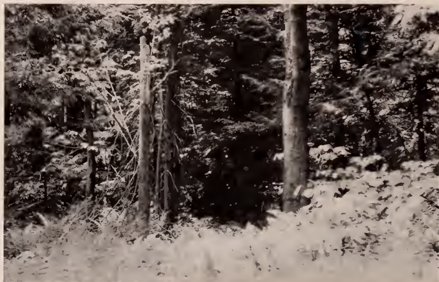
Fig. 146. Hemlock, maple and birch woods one-half mile north of village of Cleveland. June 13, 1928.