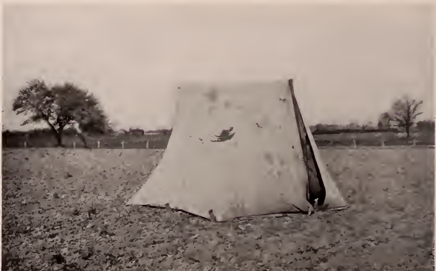
Fig. 216. Blind erected in corn field from which eastern crows were shot as they pulled up the newly sprouted corn. Muskrat Bay district. June 1, 1928.