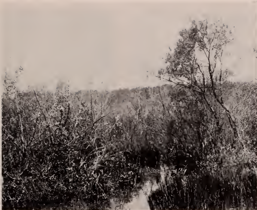
Fig. 226. Willow swamp, Big Bay district. Breeding place of eastern red-winged blackbird. June 8, 1928.