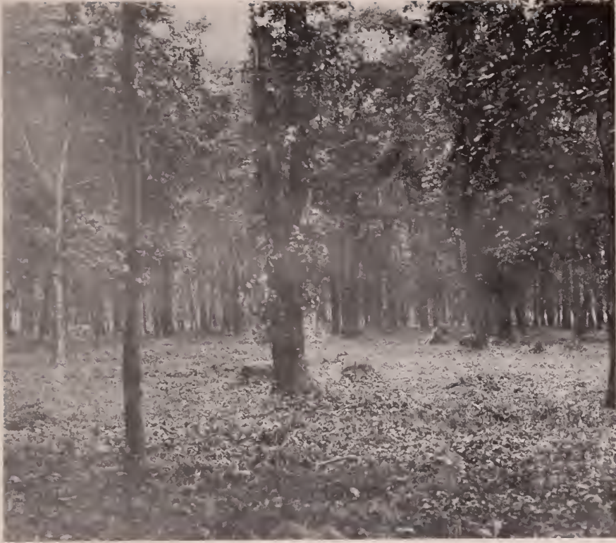
Fig. 183. Nesting site of eastern sparrow hawk; dead stub of maple tree. Oakland Beach, fifty yards from shore of Oneida Lake. June 30, 1928.