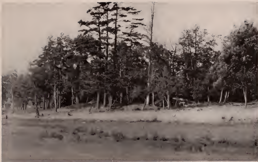
Fig. 139. Tall white pines at Verona Beach. Lookouts for eastern crows. August 13, 1928.