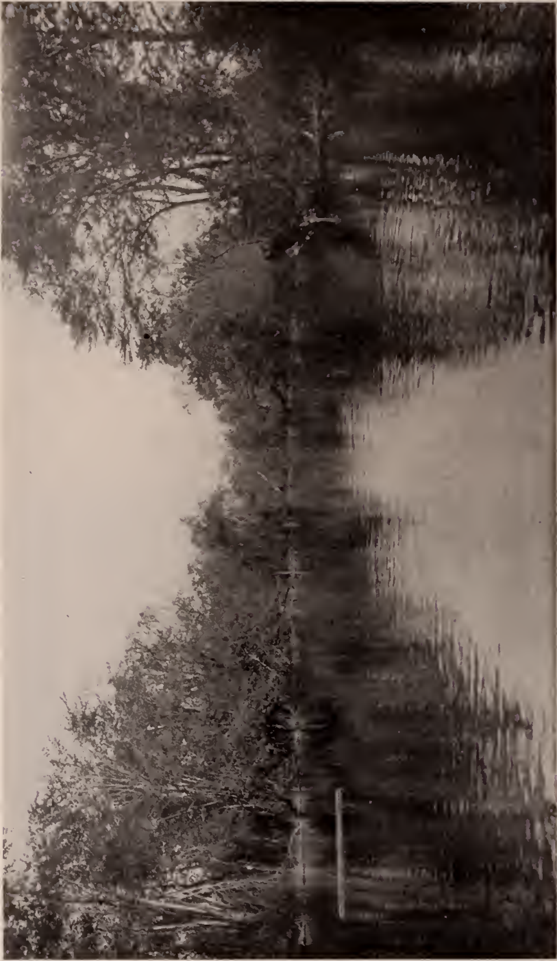
Fig. 203. Chittenango Creek near its mouth. Nesting habitat of eastern kingbird, northern crested flycatcher, bronzed grackle and tree swallow. The stump on the bank at the right of the scene hides an incubating tree swallow. May 28, 1928.