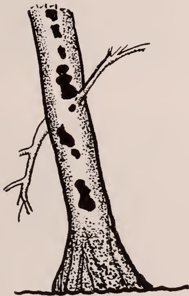
Fig. 197. Diagram illustrating type of work of northern pileated woodpecker observed on hemlock tree in Constantia Center district. July 31, 1928.