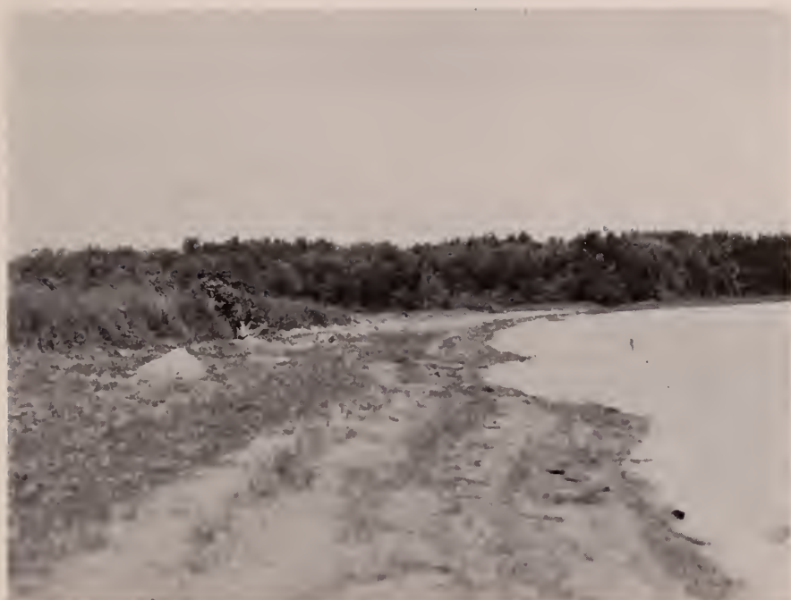
Fig. 131. Gravel beach at Delmarter Bay. Feeding ground for spotted sandpiper and semipalmated plover. July 13, 1928.