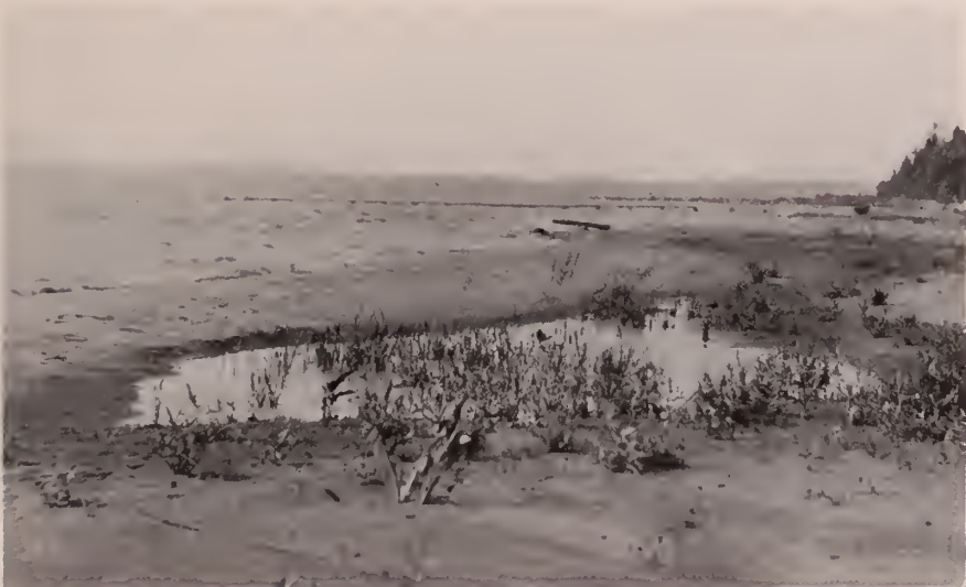
Fig. 136. Verona Beach. Beach pool and aquatic vegetation in foreground. A typical shore bird habitat. August 13, 1928.