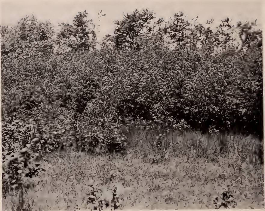
Fig. 129. Alder thicket, west side of mouth of Chittenango Creek. Habitat of Canada warbler and northern Maryland yellow-throat. June 11, 1928.