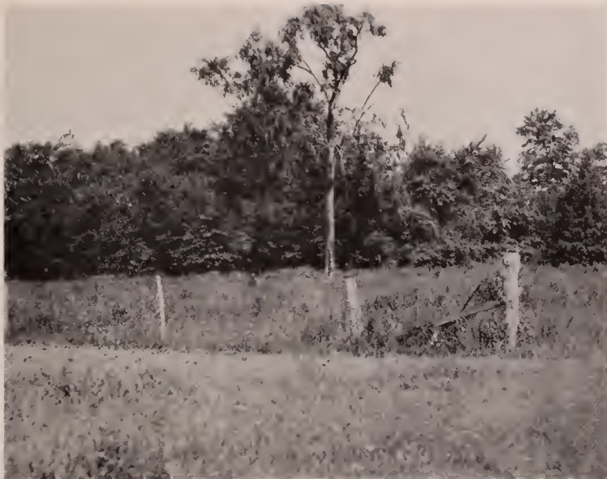
Fig. 127. Wright woods, Lower South Bay district. Hemlock-elm-beech with undergrowth of blackberry, raspberry and elderberry. July 17, 1928.