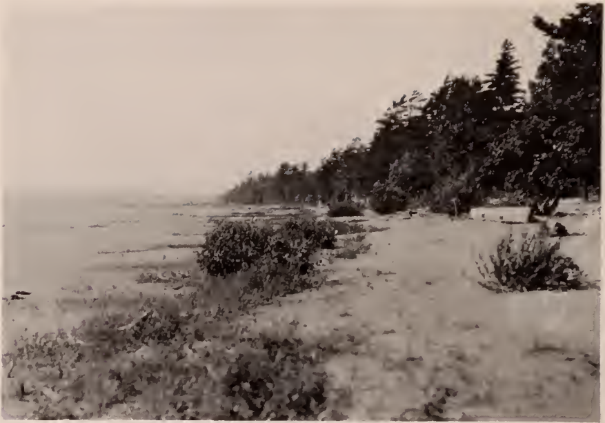
Fig. 133. Looking north along Verona Beach. August 13, 1929