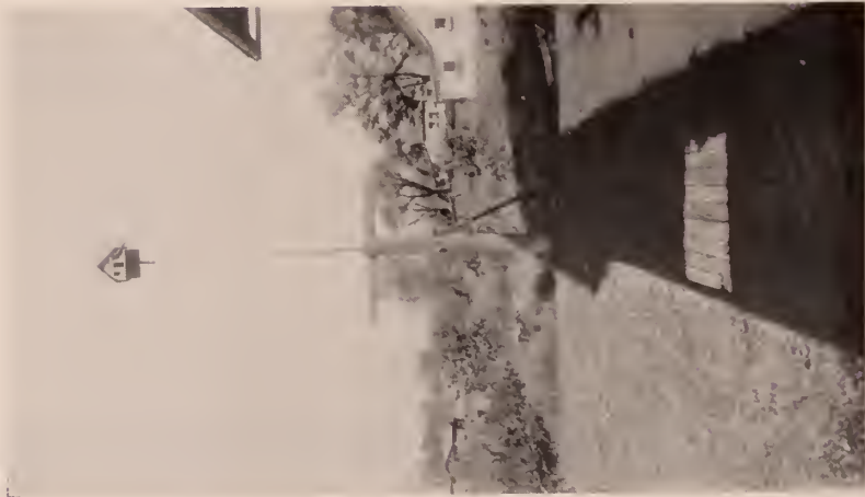
Fig. 198. Eastern robin at martin house. Lower South Bay district. The robin successfully reared a brood in this house. May 23, 1928.