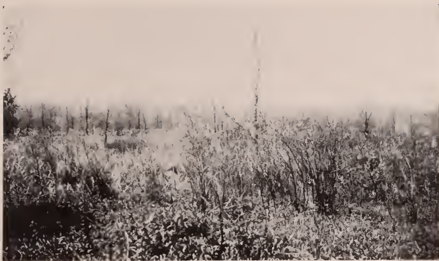
Fig. 143. Grassy willow swamp near South Bay. Home of Wilson's snipe, American bittern and swamp sparrow. May 13, 1929.