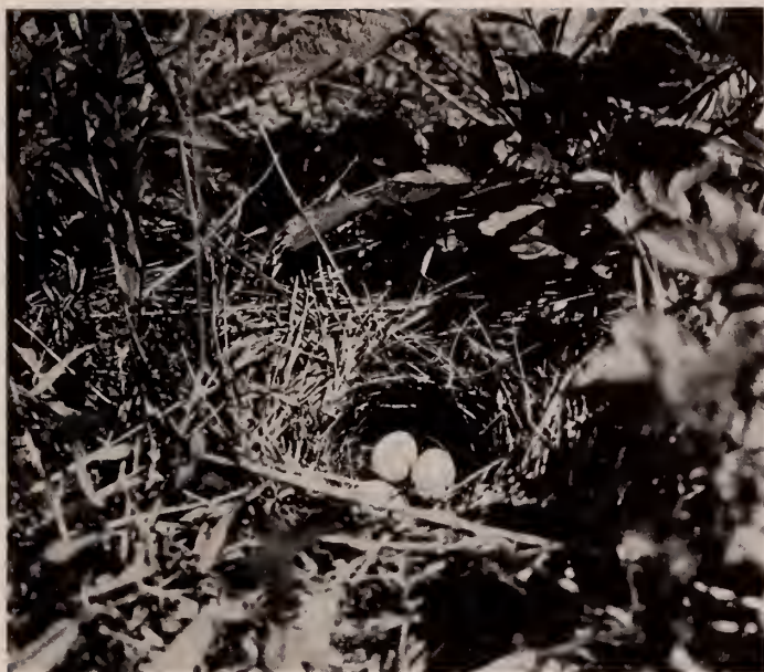
Fig. 233. Nest and three eggs of eastern vesper sparrow among dewberry vines at edge of woods. Oak Orchard. July 9, 1928.