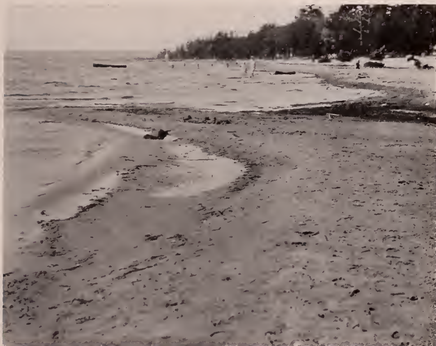
Fig. 188. Pectoral sandpiper at Sylvan Beach. July 12, 1928.