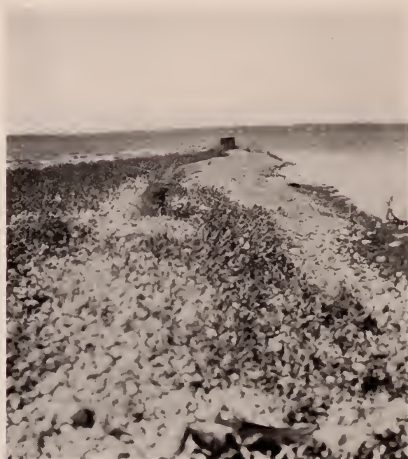
Fig. 174. East side of Wantry Island. Woods on north side of Oneida Lake in background. July 24, 1928.