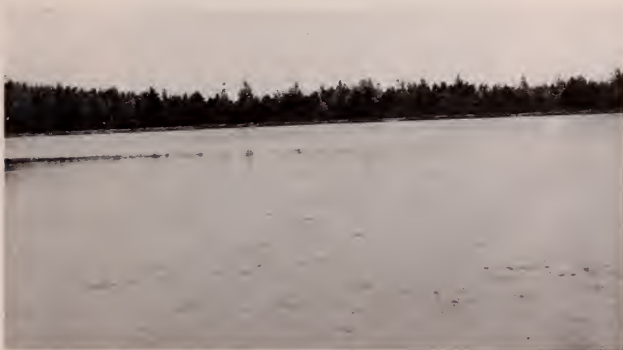
Fig. 156. Looking east across Kibby Lake. June 15, 1928.