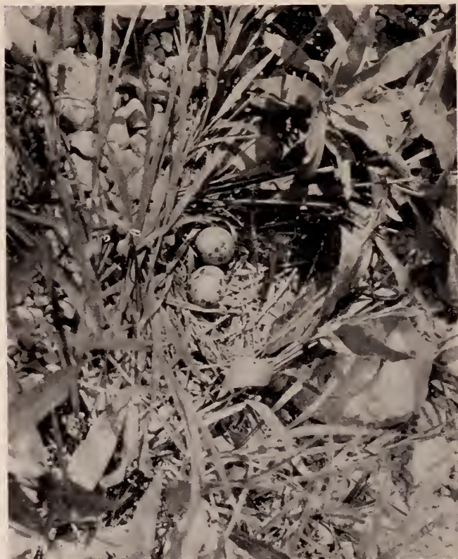
Fig. 192. Nest and eggs of common tern on Long Island. August 2, 1929.