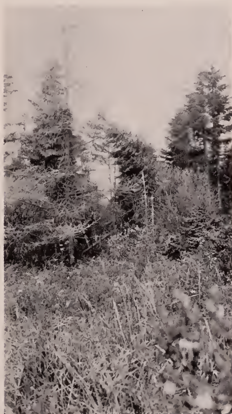
Fig. 152. Scene in hemlock-maple portion of Emmons' woods. May 21, 1928.