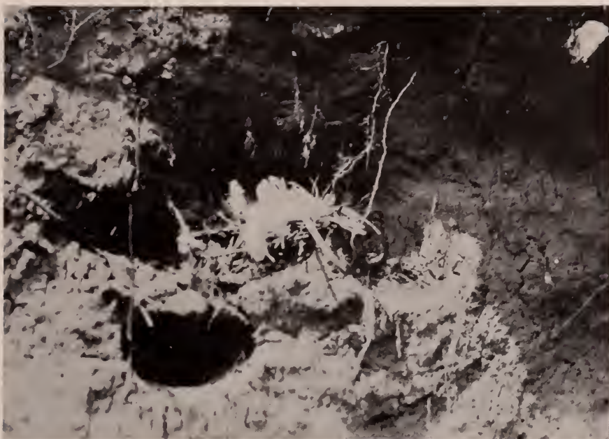
Fig. 211. Nest of bank swallow exposed by falling away of sand bank. Fish Creek near village of Fish Creek Landing. Note white lining composed of feathers from domestic fowl. July 12, 1928.