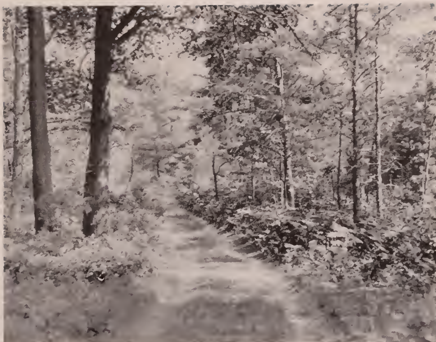
Fig. 222. White oak, black oak, pitch pine and hemlock woods one mile east of Verona Beach. August 13, 1928.