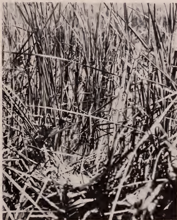
Fig. 180. Nest and four eggs of eastern least bittern. Cattail marsh in Coble Bay district. June 23, 1930.