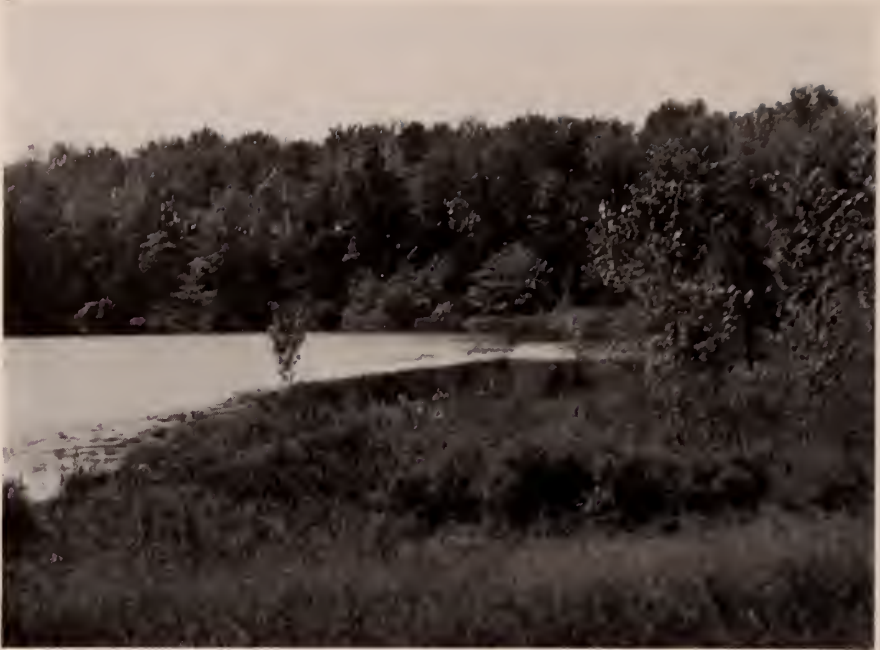
Fig. 153. Pond three miles north of Cleveland. Habitat of eastern red-winged blackbird, black-billed cuckoo, redstart and oven-bird. June 10, 1929.