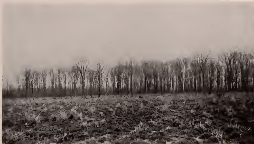
Fig. 123. Maple woods and hummocky swamp. Maple Bay district. Habitat of marsh hawk. May 4, 1928.