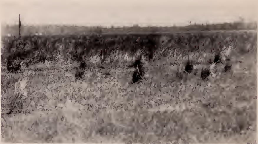
Fig. 182. Grassy marsh at Shaw Point. Habitat of marsh hawk, eastern red-winged blackbird and Wilson's snipe. May 22, 1929.