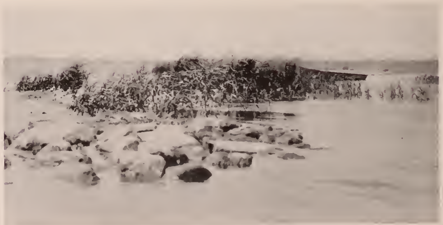
Fig. 170. Wantry Island. July 24, 1928.