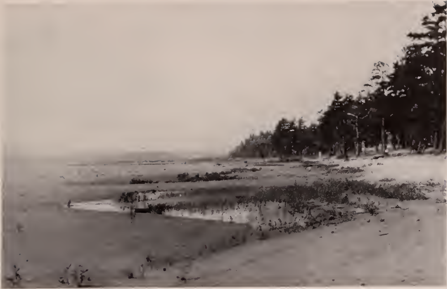
Fig. 135. Verona Beach. A congregating place for shore birds. August 13, 1928.