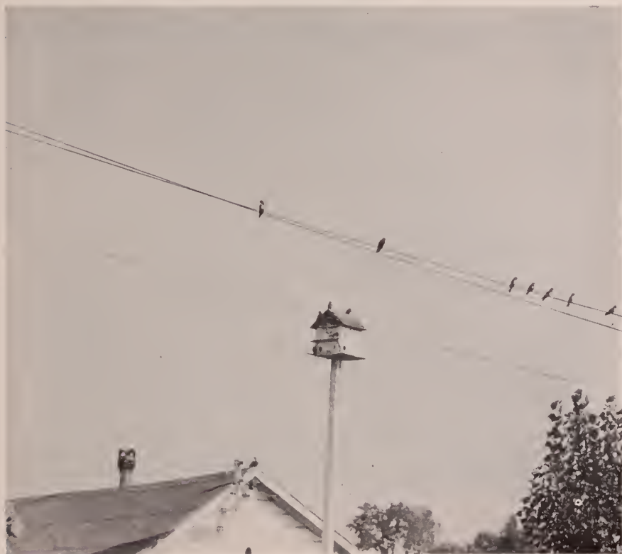
Fig. 202. Purple martins on telephone wires, Lower South Bay. August 15, 1928.