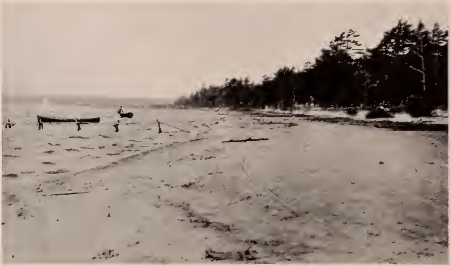
Fig. 137. Verona Beach, looking north, east shore of Oneida Lake. Mixed woods along higher part of shore. August 13, 1928.