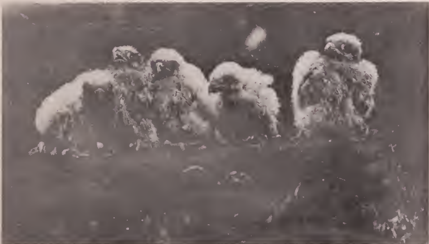
Fig. 184. Young eastern sparrow hawks. Nest in maple tree at Oakland Beach. June 30, 1928.