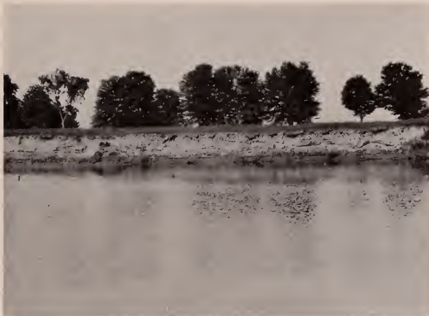
Fig. 207. Bank swallow burrows in bank of Fish Creek at village of Fish Creek Landing. July 12, 1928.