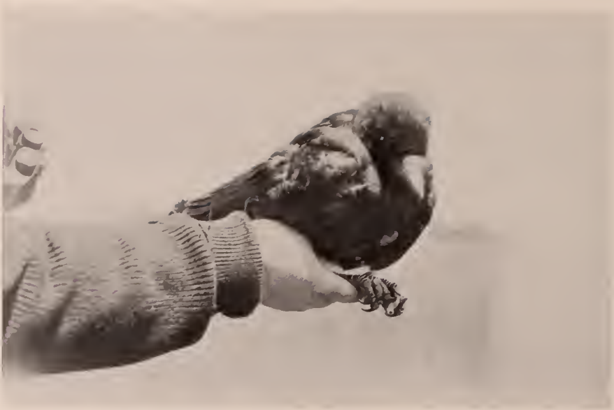
Fig. 215. Captive immature eastern crow. June 15, 1928.