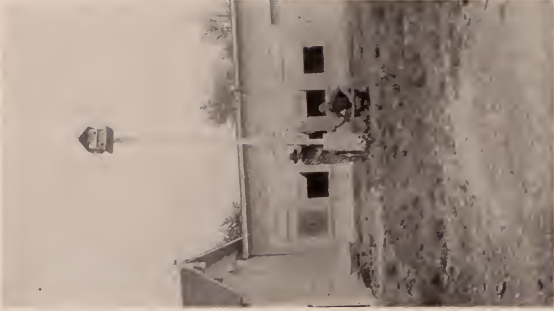
Fig. 200. House erected for purple martins. Lower South Bay. May 27, 1928.