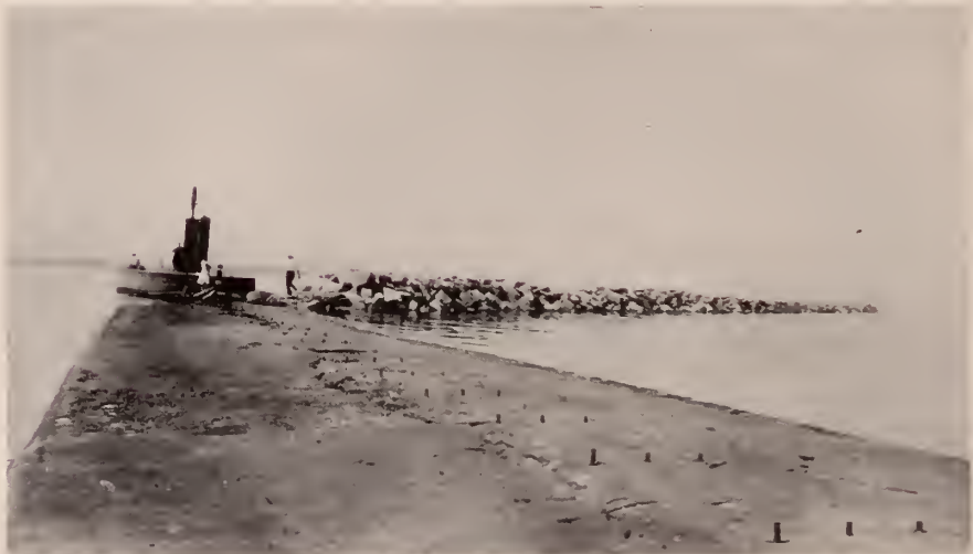
Fig. 142. Stone breakwater at entrance to Barge Canal, Sylvan Beach. August 13, 1928.