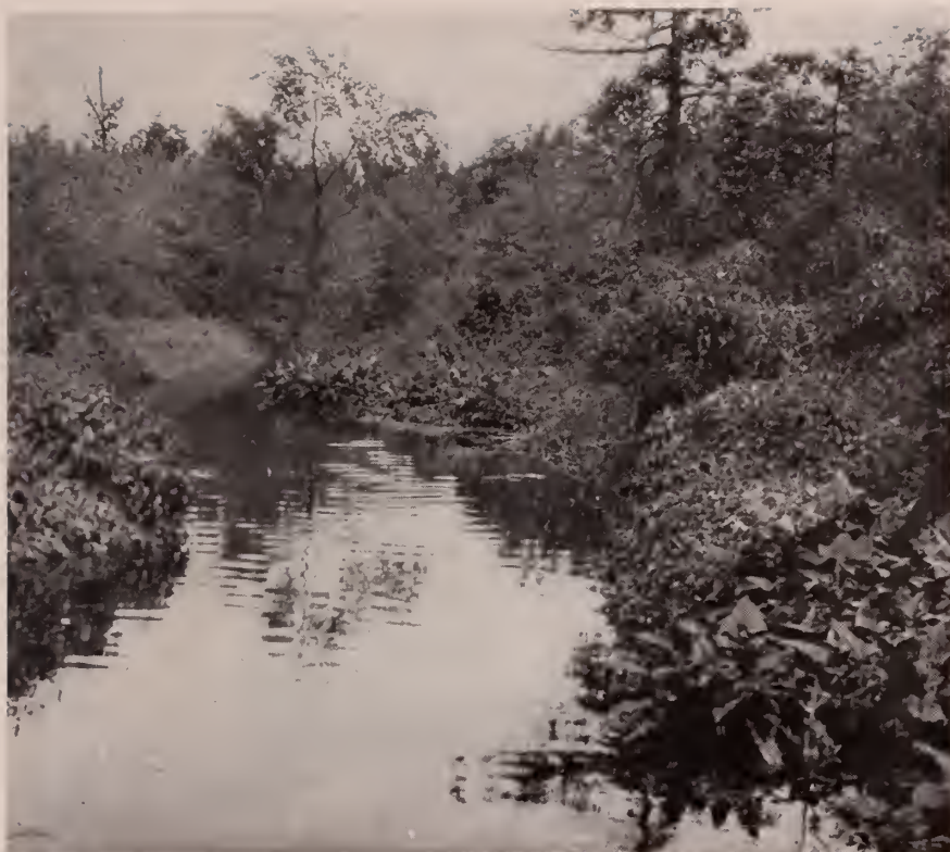
Fig. 163. Three Mile Creek, one-half mile from shore line, east side of Big Bay. Arrow arum and swamp loosestrife afford abundant cover for many species of birds. August 10, 1928.