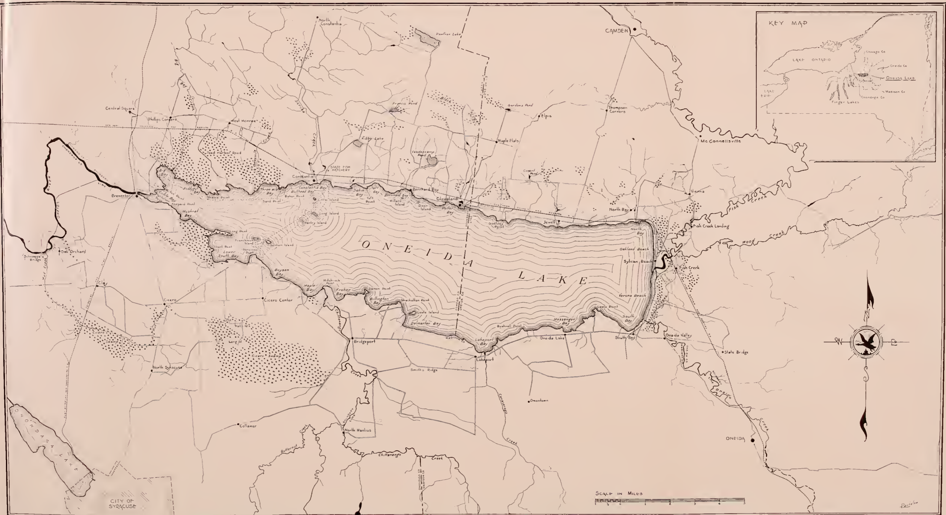
Map 2. Map of Oneida Lake and contiguous territory showing routes traversed and places visited during this investigation. Adapted from the U. S. Geological Survey Quadrangles. Key shows counties immediately surrounding Oneida Lake and the location of this lake in relation to other central New York lakes.