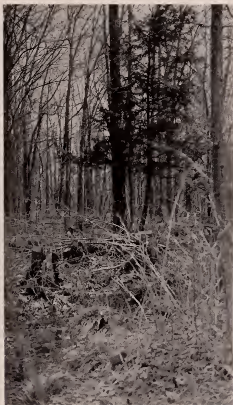
Fig. 124. Maple Bay hardwoods. Habitat of eastern winter wren, Louisiana water-thrush and swamp sparrow. May 4, 1928.