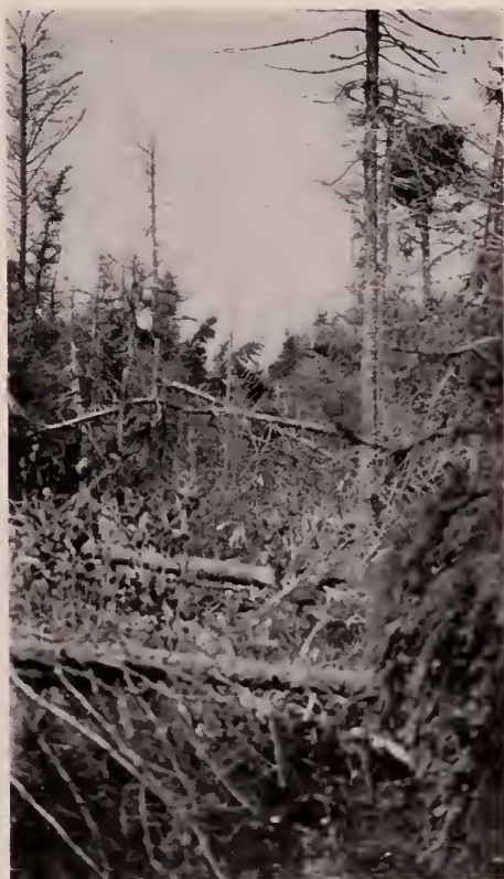
Fig. 120. Cicero Swamp near Hall Island. Habitat of white-throated sparrow and Canada and magnolia warblers. May 26, 1928.