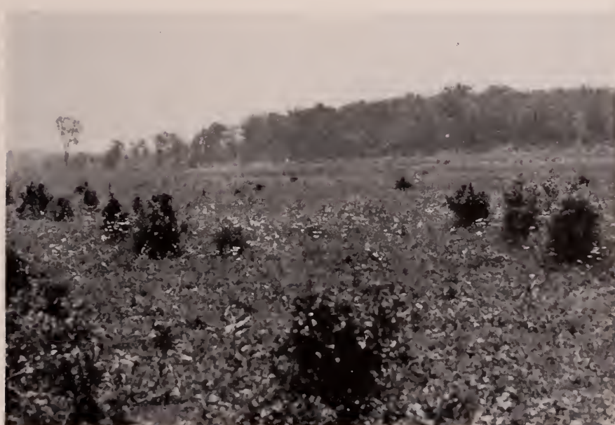
Fig. 118. Van Antwerp woods. Example of isolated wooded tract characteristic of the south side of Oneida Lake. June 12, 1929.