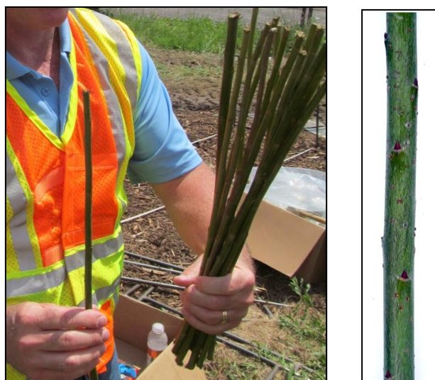
Figure 2 - Bundle and close up image of unrooted 20" shrub-willow stem cuttings for planting.