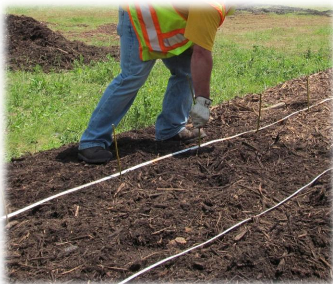
Figure 5 (left) – Applying wood mulch to a planted shrub-willow snow fence Figure 6 (right) – Planting cuttings directly through mulch and landscape fabric underneath