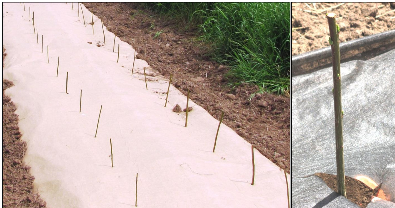
Figure 3 (left) – Willow cuttings installed through paper landscape fabric in a double row pattern