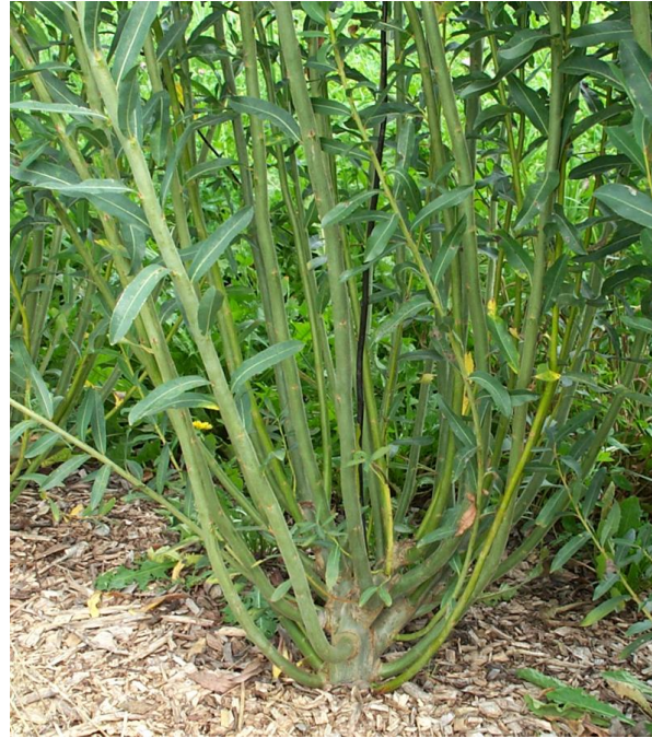
Figure 3 (left): This photo shows a dormant shrub-willow plant after one growing season. The plant was grown from a correctly planted 20 inch stem cutting, leaving about 10 inches of the main stem above the ground. Coppicing this plant at the dotted yellow line will be within the desired height range at approximately 8 inches, and also leave at least four side-branches on the main stem and cut to the same height

Figure 4 (right): After coppicing, new side-branches will resprout from the main stool and all preexisting side-branches. The number of new side-branches depends on the variety of shrub-willow, the site conditions, management practices and vigor of the plant. This variety of shrub-willow ( Salix purpurea ) produces numerous new stems from each side-branch left on the plant after coppicing.