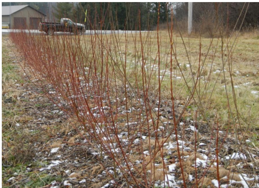
Figure 5 (left): Some willow fences under best management practices can create many stems after the first growing season without coppicing