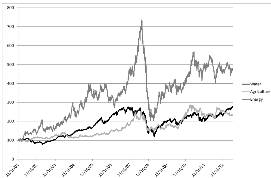
Figure 1. Agriculture, Energy and Water indexes