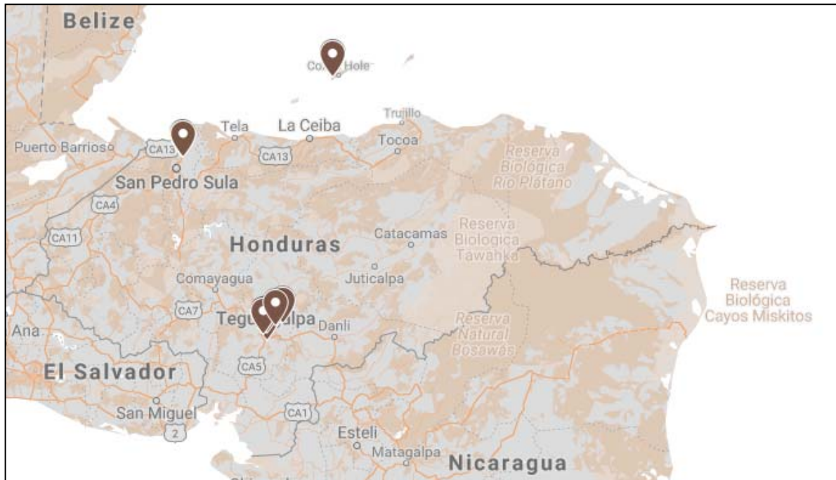
Figure 3. Location of the Research